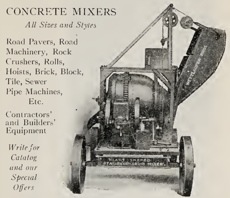
Famous Heart Shape Mixer

We make a specialty of equipping complete plants for manufacturing Cement Products, Brick, Block, Drain Tile and Sewer Pipe, Etc.