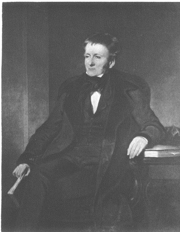
PORTRAIT OF THOMAS DE QUINCEY.

From a painting by Sir J. Watson Gordon, P. R. S. A.