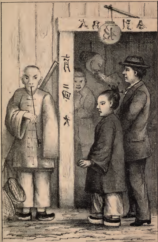
JOB ON THE WARPETH.