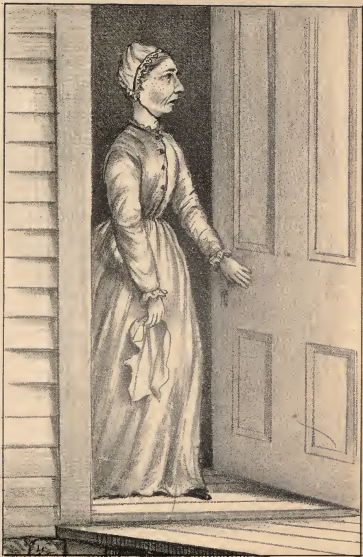
PEGGY PUTS OUT THE YELLOW FLAG.