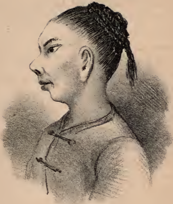
BESSIE'S PROMISING PUPIL.