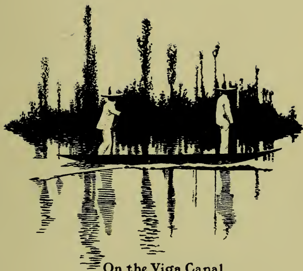
On the Viga Canal