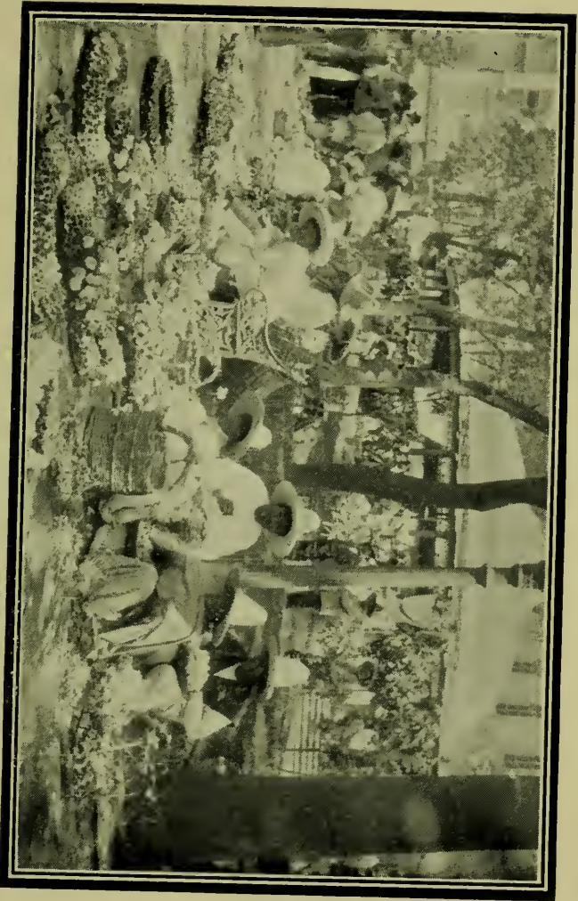
NEAR THE FLOWER MARKET