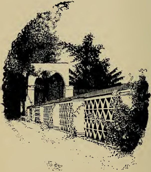
At a Mexican Country-house