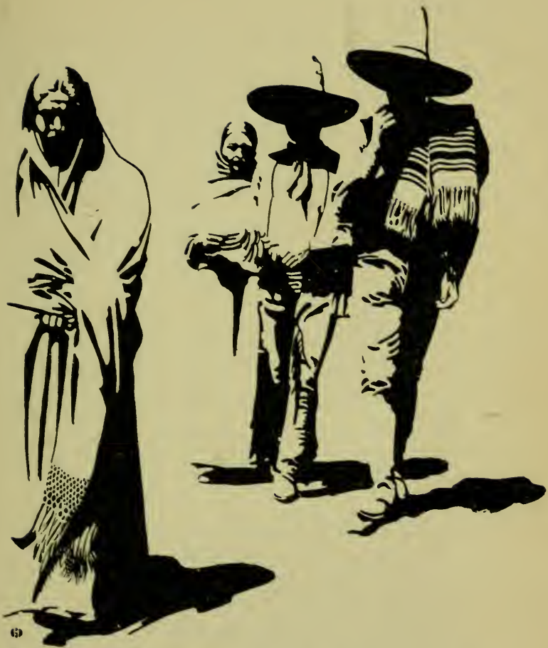
A Street Scene