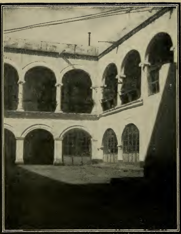
SUNLIGHT AND SHADOW