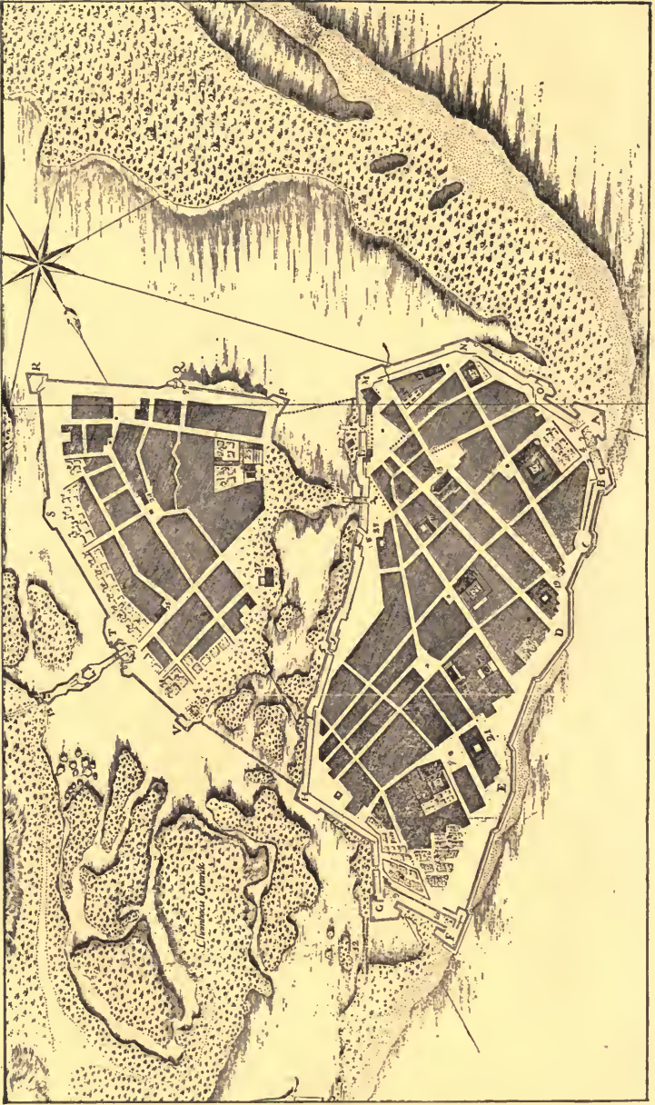
Plan of Cartagena