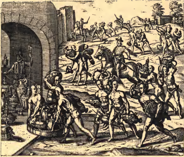
Treasure from El Dorado