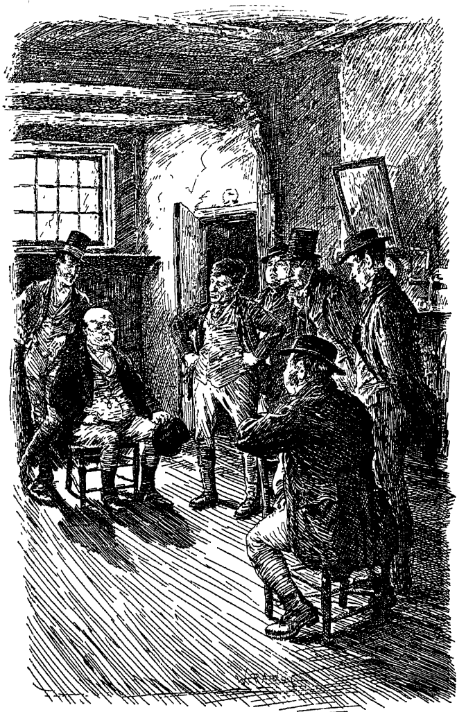
Mr. Pickwick sits for his Portrait