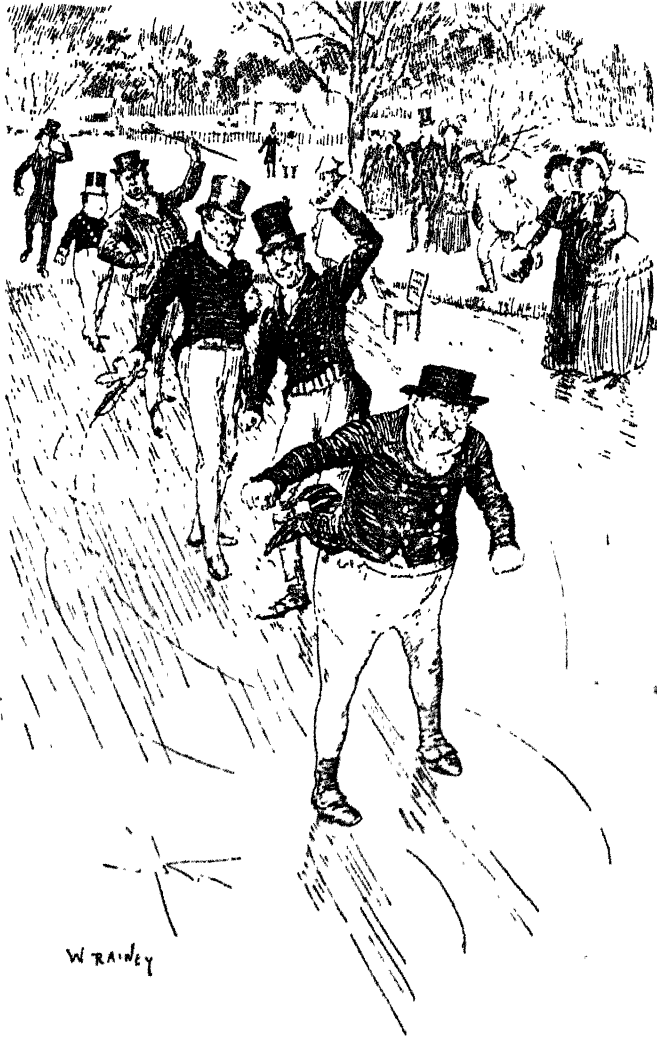
Mr. Pickwick on the Ice