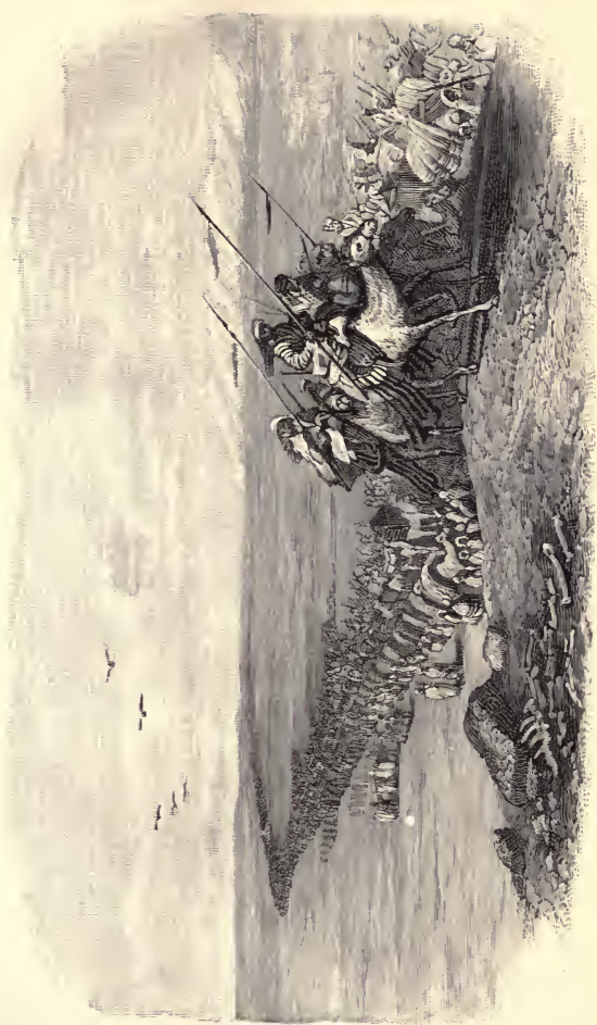
THE MECCA CARAVAN. Irving, Vol. Nine, p. 20.