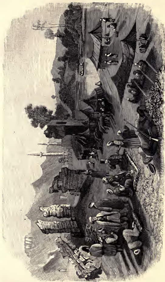
HALT OF THE MECCA PILGRIMS.