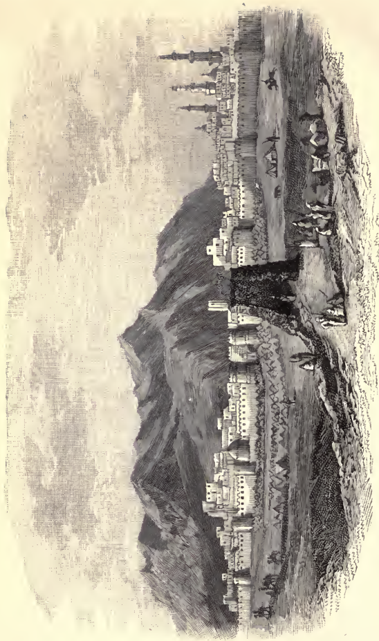
EL MEDINAH, THE PROPHET'S BIRTHPLACE.