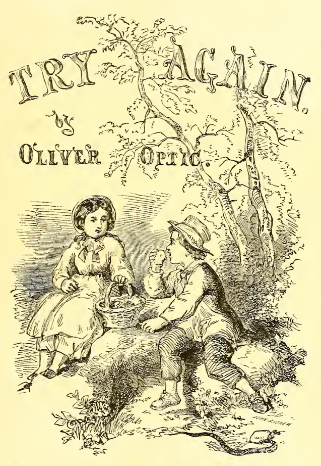
BOSTON, LEE & SHERARD.