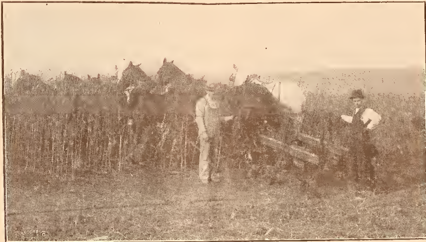
The Correct Way to Dig Trees.