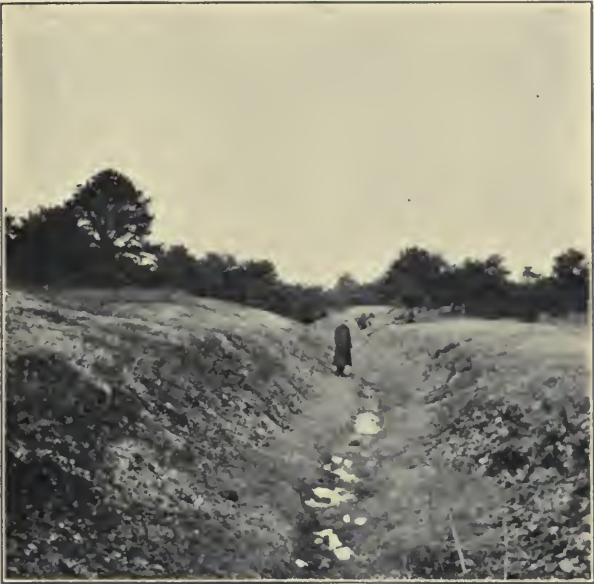
FIG. 7. — Neglected herring ditch, Marston's Mills Herring River.