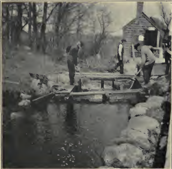
FIG. 4. — Catching alewives at Barker's River, Pembroke.