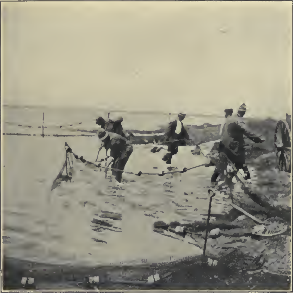
FIG. 3. — Seining alewives, Mattakessett Creeks, Edgartown.