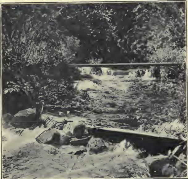
FIG. 8. — Obstructing material in Chebaeco Brook, Essex River.