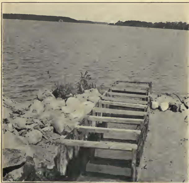
FIG. 2. — Wooden runway at outlet, Long Pond, Harwich.