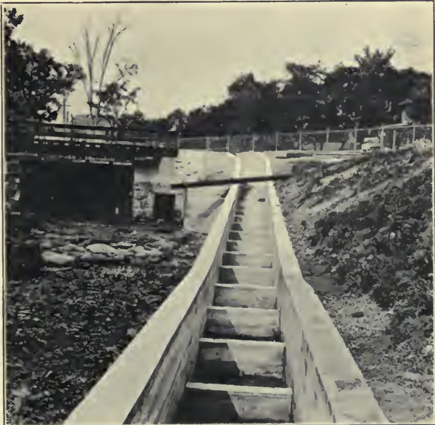
FIG. 12. — Standard straight-run fishway of concrete, Stanley Iron Works, Bridgewater.