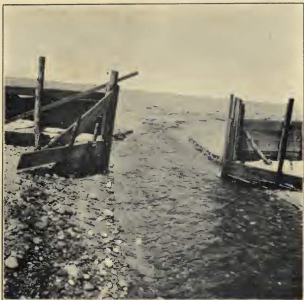
FIG. 1. — Outlet to ocean, Squibnocket Pond, Martha's Vineyard.