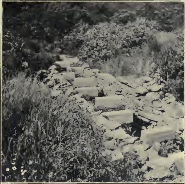
FIG. 11. — Stone fishway with concrete baffles, Nemasket River.