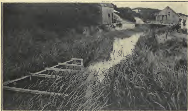
FIG. 6. — Obstruction with wild rice, Herring River, Wellfleet.