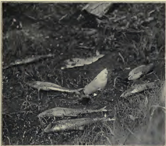
FIG. 9. — Shad killed by trade waste pollution in Agawam River before installation of filter beds.