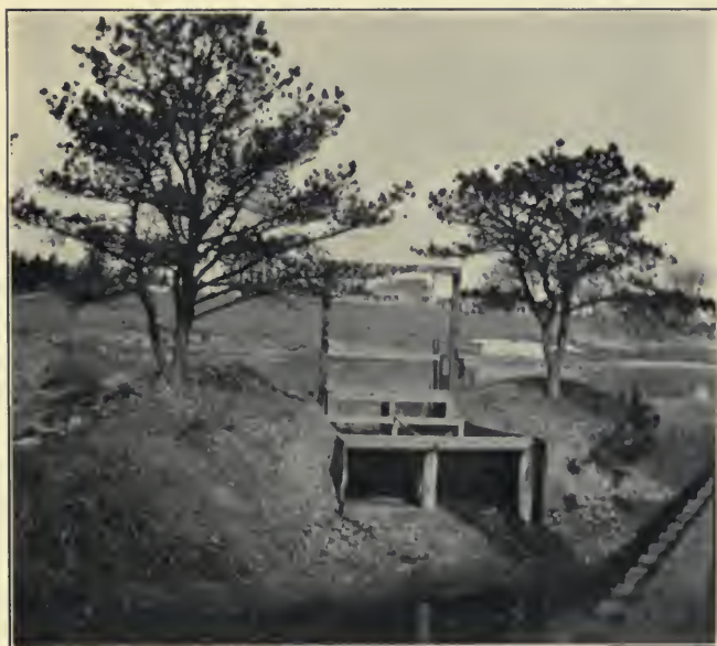
FIG. 10. — Charcoal screen and filter beds of New Bedford and Agawam Finishing Company, on Agawam River.