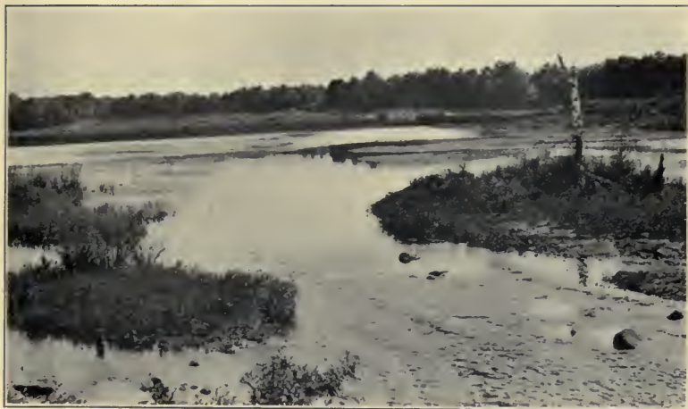
FIG. 5. — Flooded cranberry bogs, Mattapoissett River.