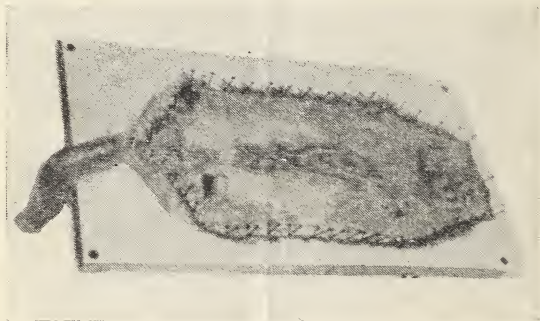
FIGURE 3.—A chinchilla pelt stretched out and nailed to a small board.

The ears, eyelids, lips, and the skin of each leg above wrists and hocks should be left on the pelt. The skin of the legs is left protruding from the flesh side of the pelt. Care should be taken to keep the legs from touching the skin while the pelt is being dried. The pelt should be scraped gently yet firmly with the edge of a spoon or with a dull knife to remove excess fat. Sawdust absorbs the fat and makes the slippery pelt easier to handle. Sometimes only sawdust is used