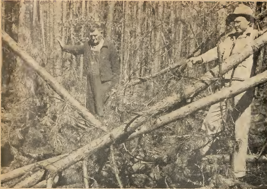
Farmer Dwight Campbell (left) inspects his ice-damaged timber with County Agent John Moosburg and decides he can do this much for war and plans to get the 3,000 cords to the mill.

■ An ice storm hit east Texas January 14 to 16—one of the heaviest on record. Timber was down on more than 300,000 acres of forest land, and timber was a strategic war material. High-ranking army officers, officials from the War Production Board, and forestry experts flew to the scene of the catastrophe, thinking of the war goal of 14 million cords of pulpwood needed in 1944. After examining the damage, they figured that 1 million cords could be salvaged; but more than a third of this fallen timber was on small farms, and much of the salvage would have to be done within the next few months to prevent loss.