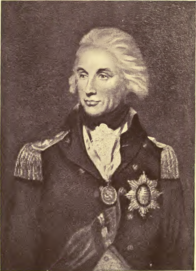
REAR-ADMIRAL SIR HORATIO NELSON in 1798,

from Captain Mahan's "Life of Nelson," New Edition (published at 7/6 net).