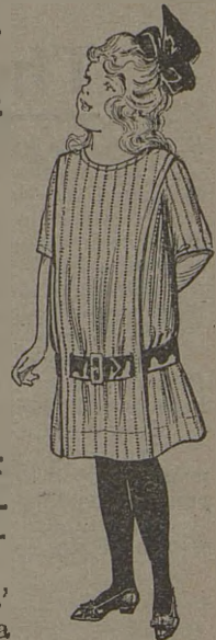
7058—Girls' Dress Sizes 4, 6, 8, 10, 12 Years.