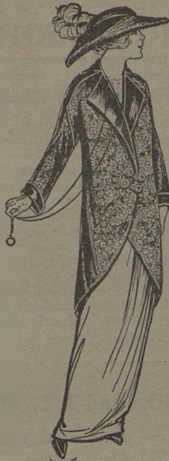
7059—Ladies' Coat Sizes 32, 36, 40, 42, Inches bust measure.