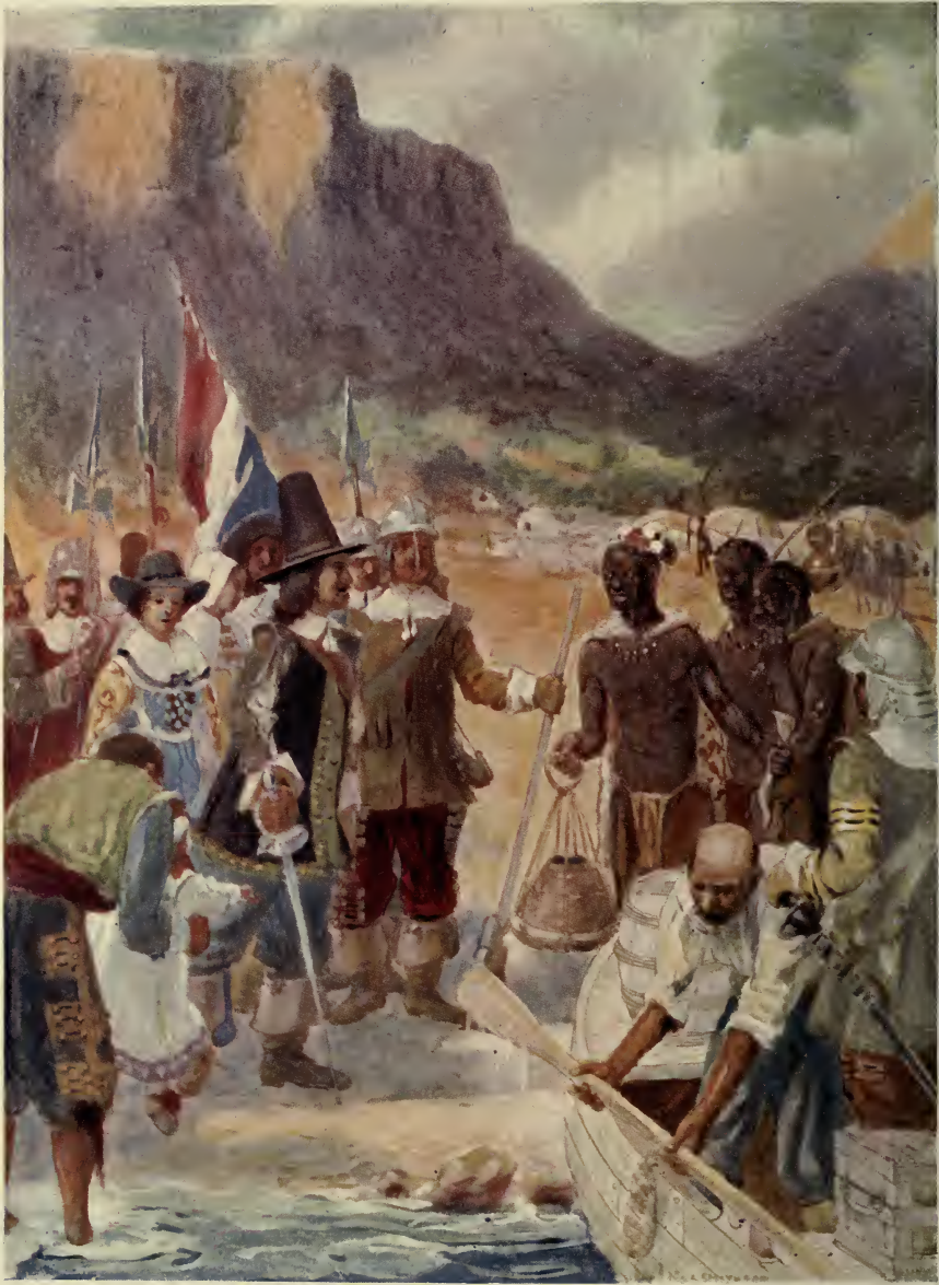
The Landing of Van Riebeck