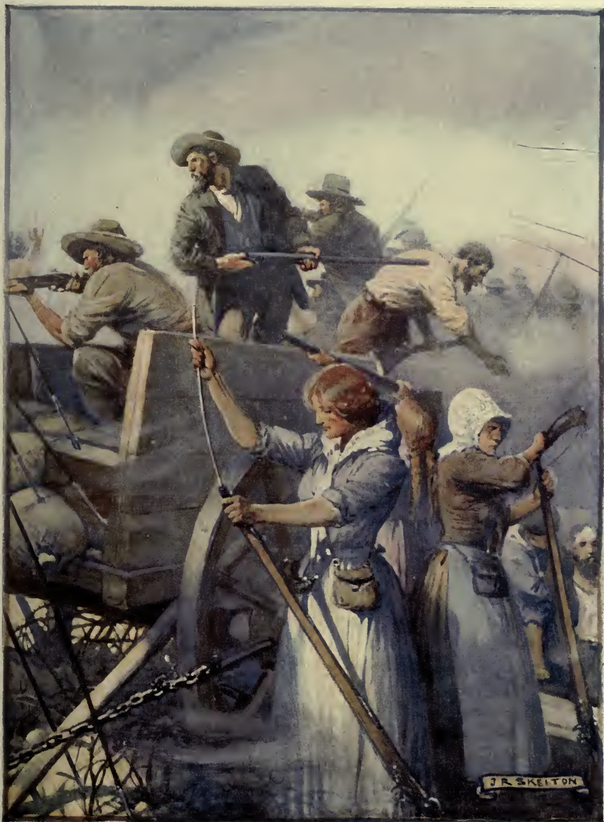
The Women Loaded the Empty Guns