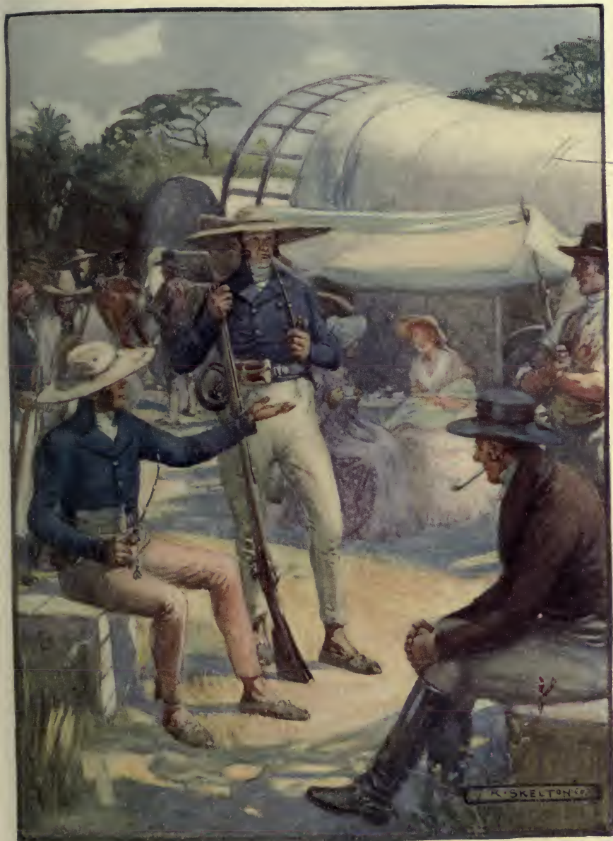
1820 Settlers and their Boer Convoys