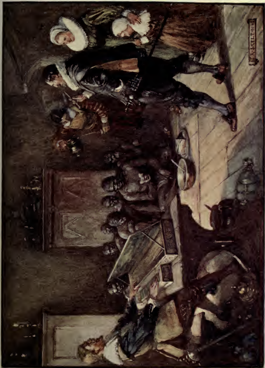
Van Riebeck Entertains the Hottentots