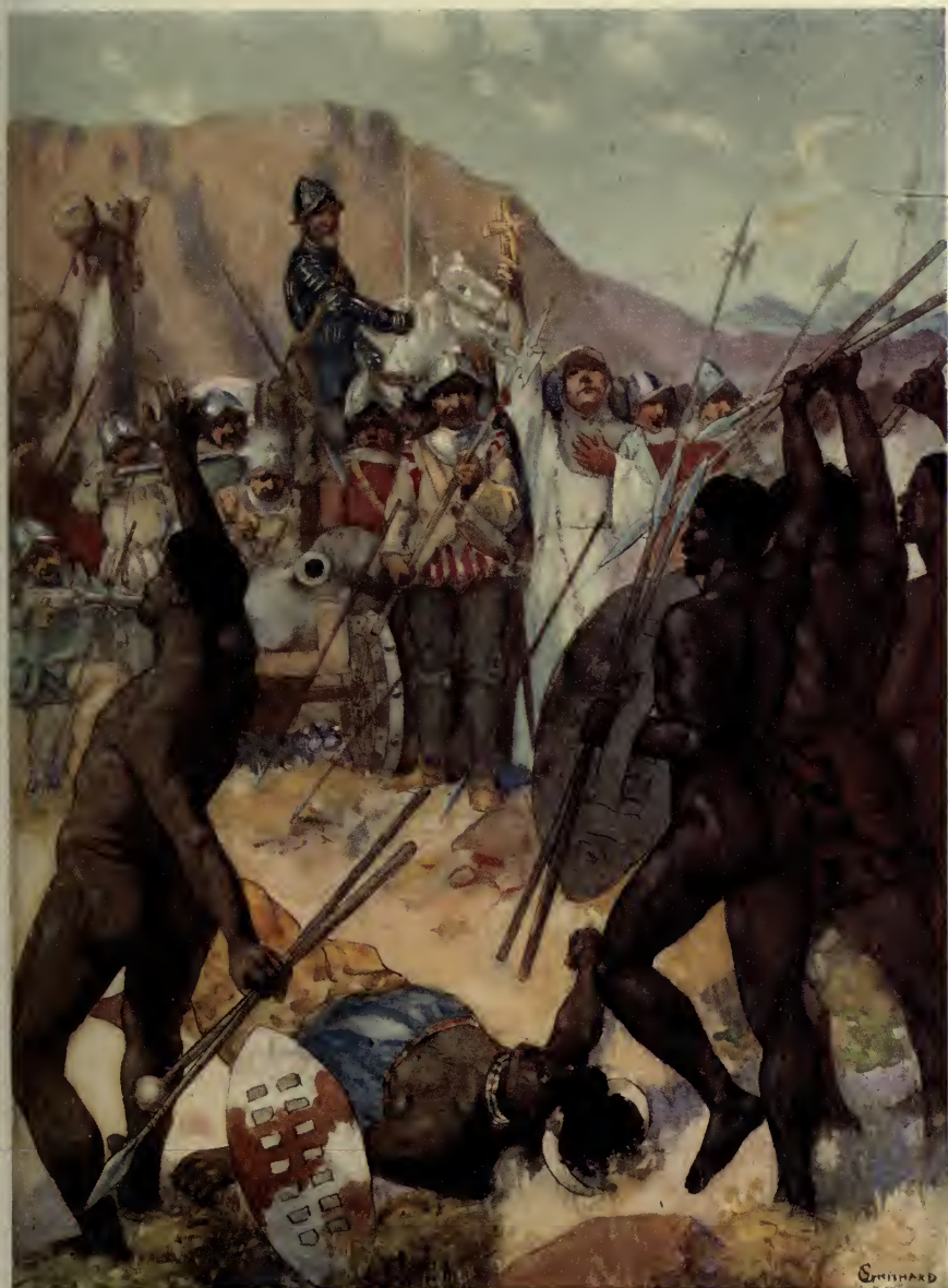
Barreto Fights the Kafirs