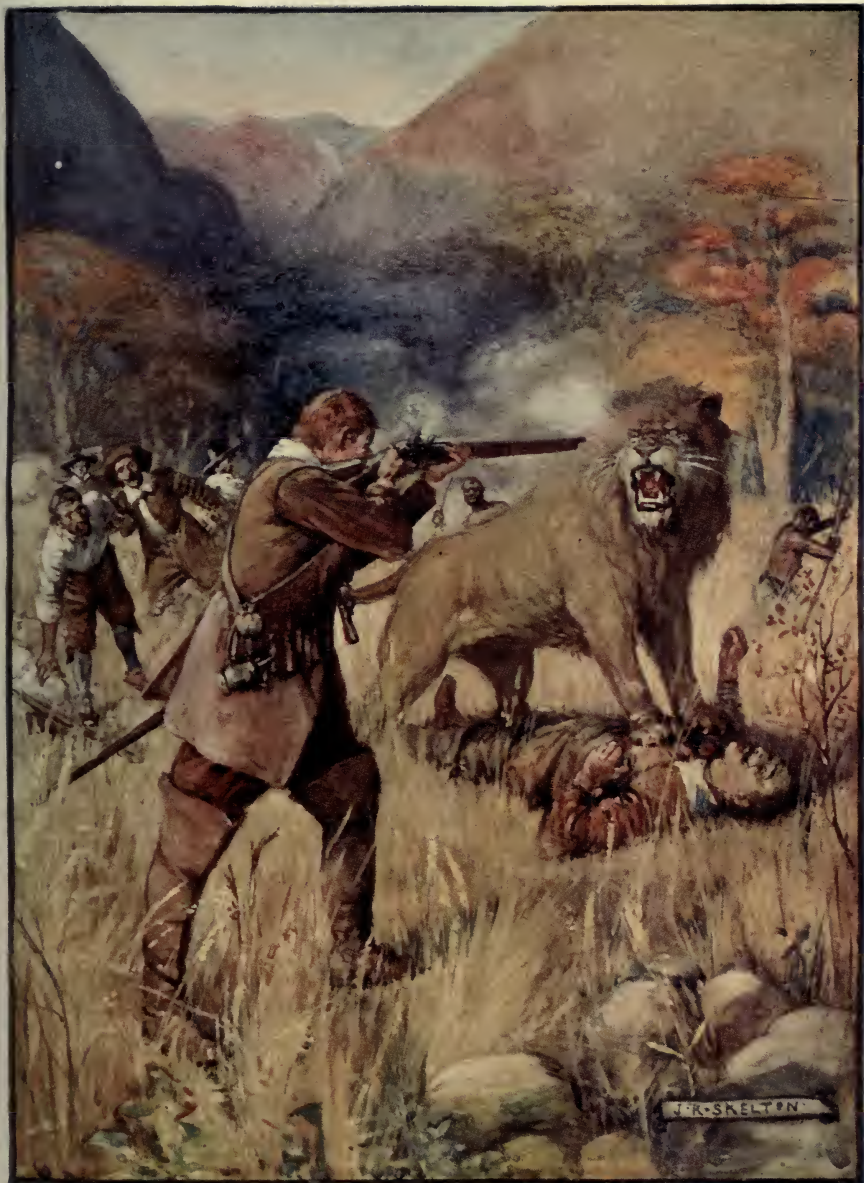
A large Lion sprang upon one of the Men