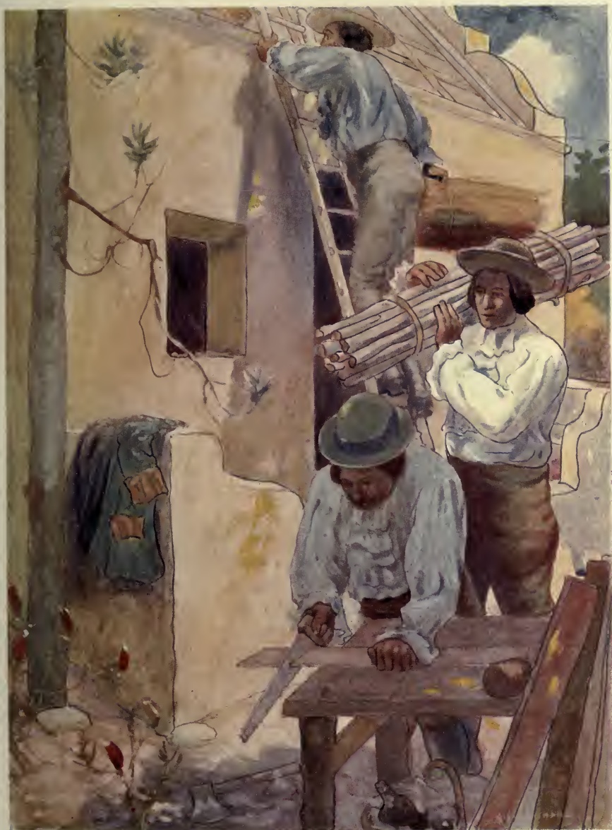
Huguenots Building their Homesteads