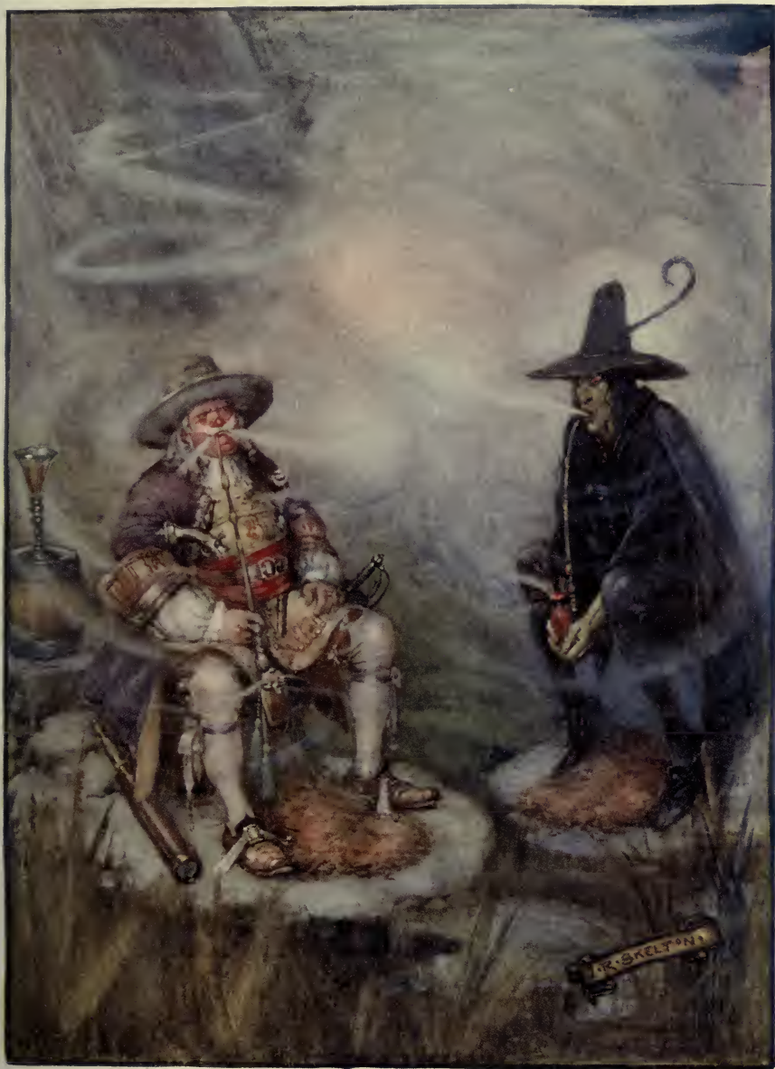
How Table Mountain got its Cloud