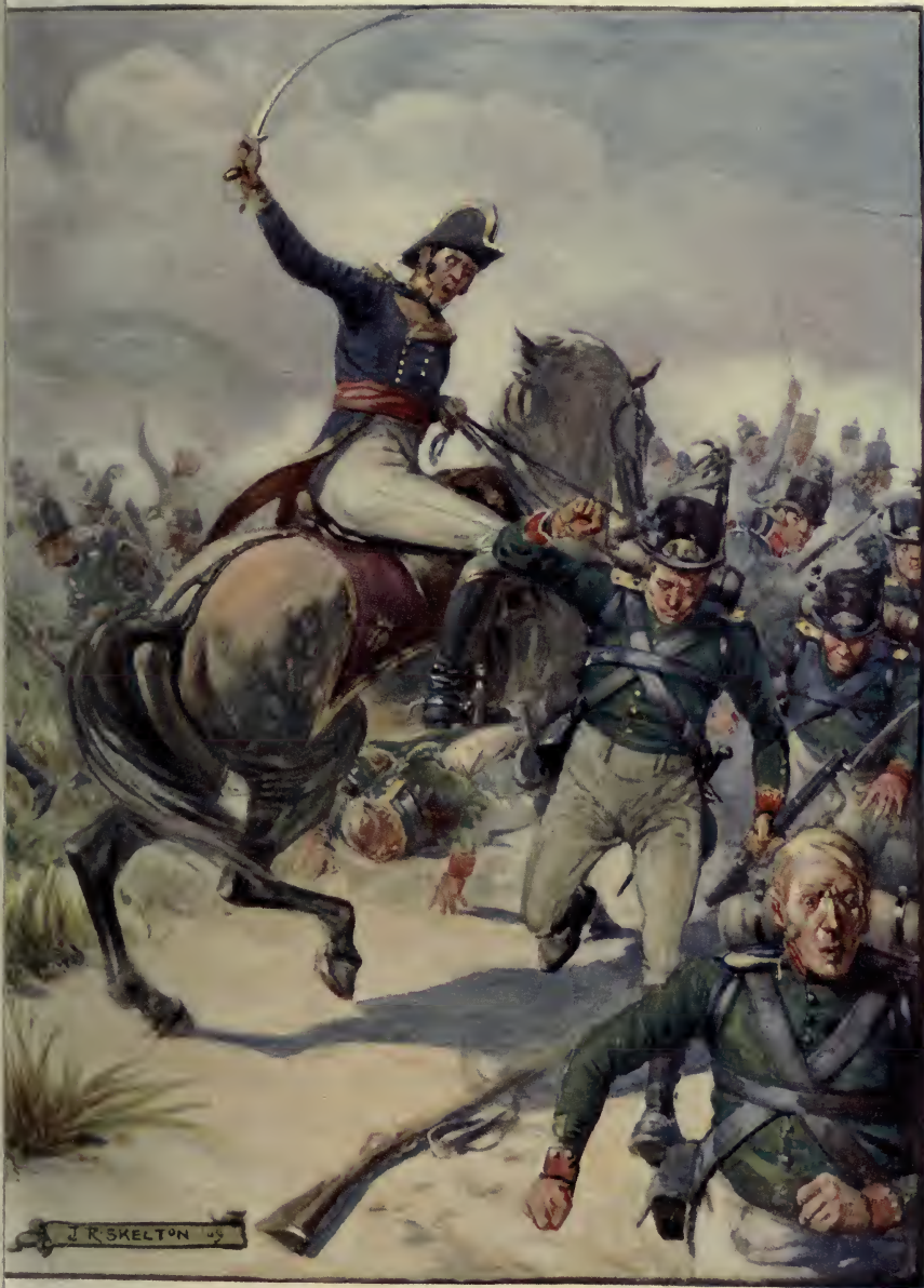
General Janssens at the Battle of Blaauwberg