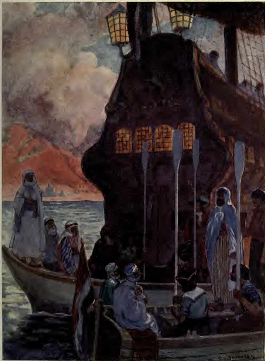
The Coming of Sheik Joseph