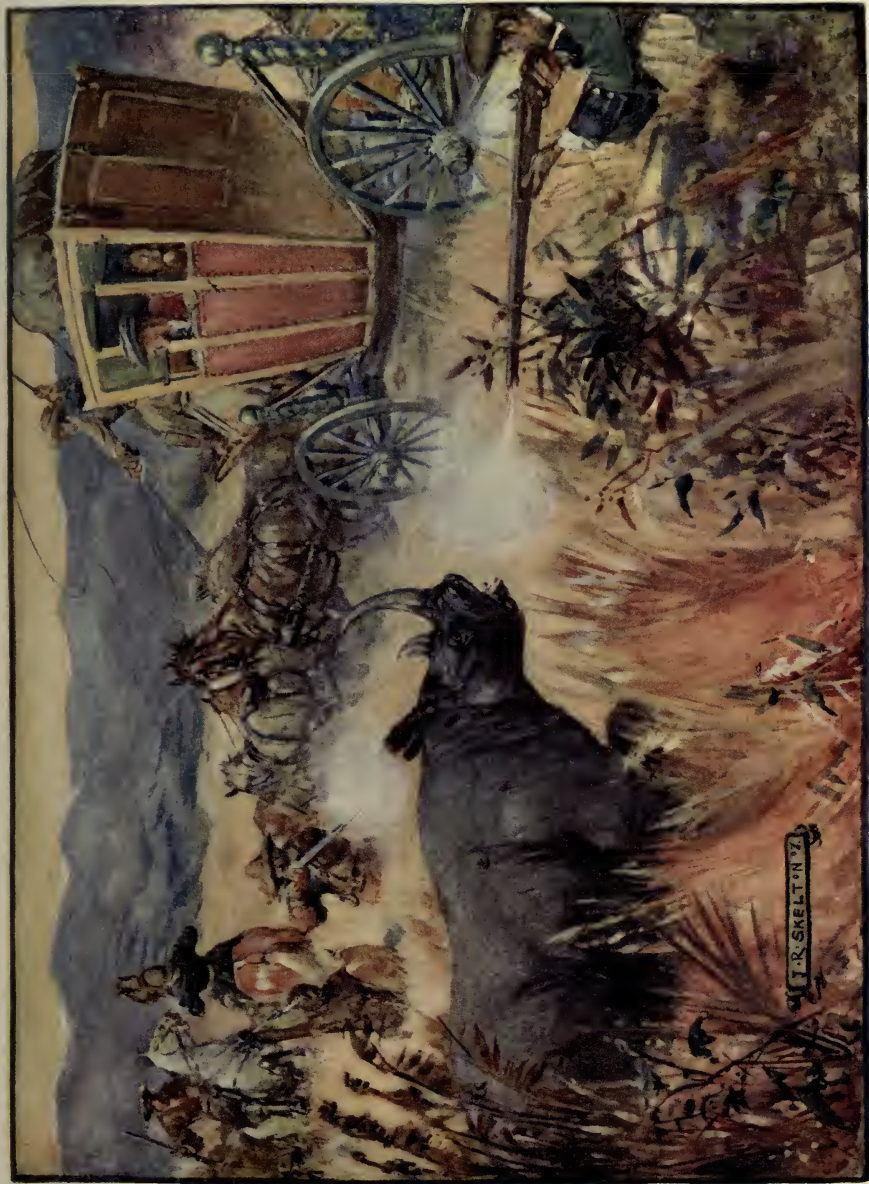
Simon Van der Stel and the Rhinoceros