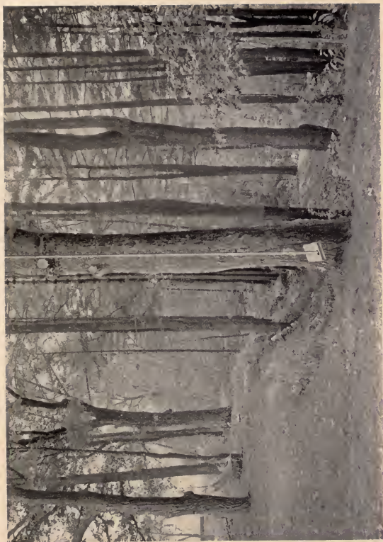
THE SWING WALK, TARRYAWHILE.