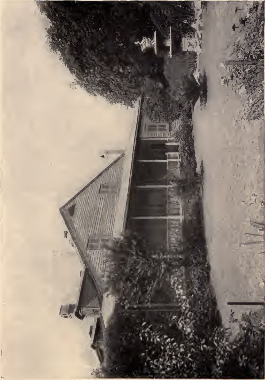
THE HOUSE ON ANNUNCIATION SQUARE, NEW ORLEANS, IN WHICH MR. CABLE WAS BORN.