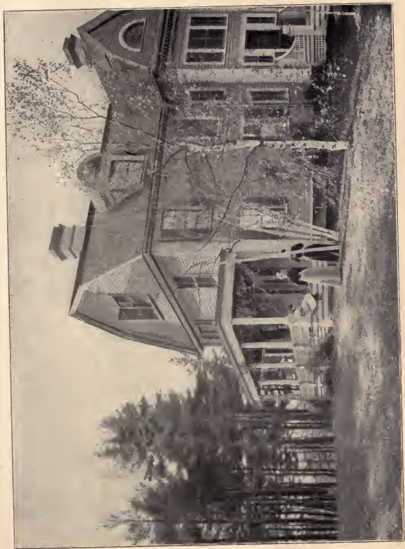
TARRYAWHILE, MR. CABLE'S HOME, NORTHAMPTON, MASS.