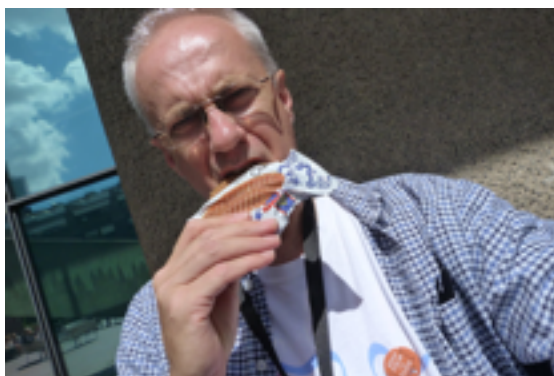
By Gordon Joly from London, UK (Wikimania 2014, Barbican, London) [CC-BY-SA-2.0 ( http://creativecommons.org/licenses/by-sa/2.0/ )], via Wikimedia Commons 9 August 2014, 12:57