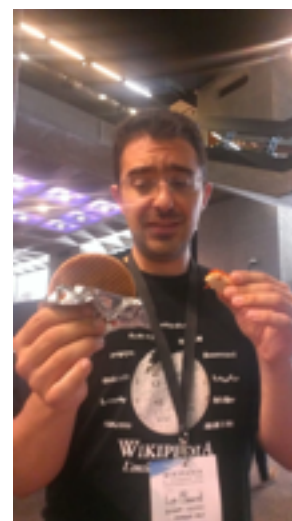
By Sannita (Own work) [CC-BY-SA-3.0 ( http://creativecommons.org/licenses/by-sa/3.0/ )], via Wikimedia Commons