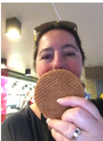
By Islahaddow (Own work) [CC-BY-SA-3.0 ( http://creativecommons.org/licenses/by-sa/3.0/ )], via Wikimedia Commons 18:11, 9 August 2014