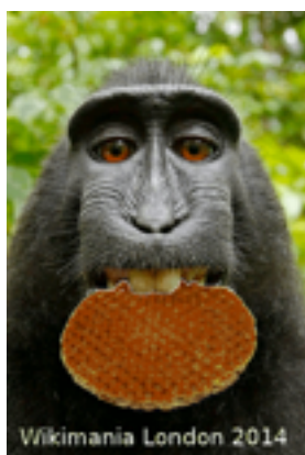
By AlisonW (Own work) [CC0], via Wikimedia Commons