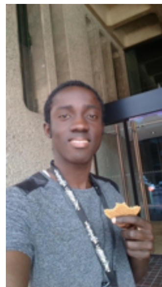
By Nkansahrexford (Own work) [CC-BY-SA-4.0 ( http://creativecommons.org/licenses/by-sa/4.0/ )], via Wikimedia Commons