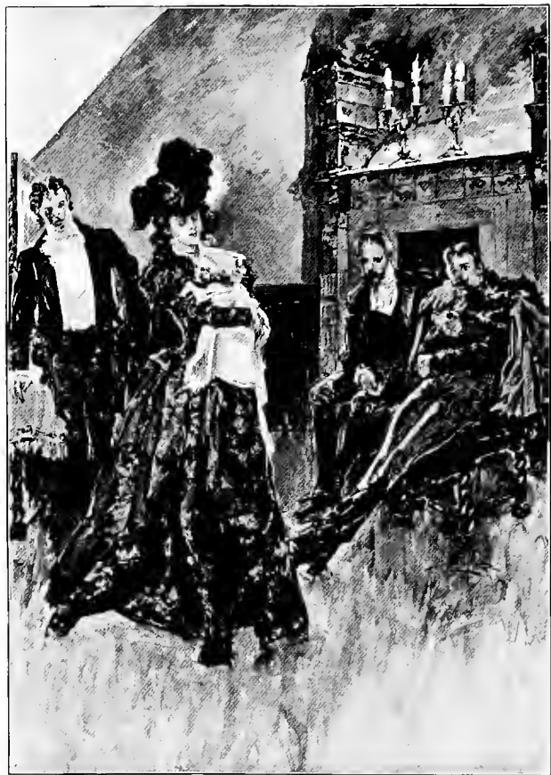
"THAT MOST EXQUISITE PICTURE . . . THE WOMAN AND THE CHILD"