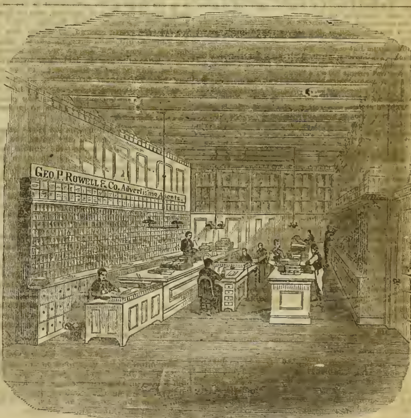
THE LIST DEPARTMENT.

Advertisers will readily see the advantages we possess for transacting their business.