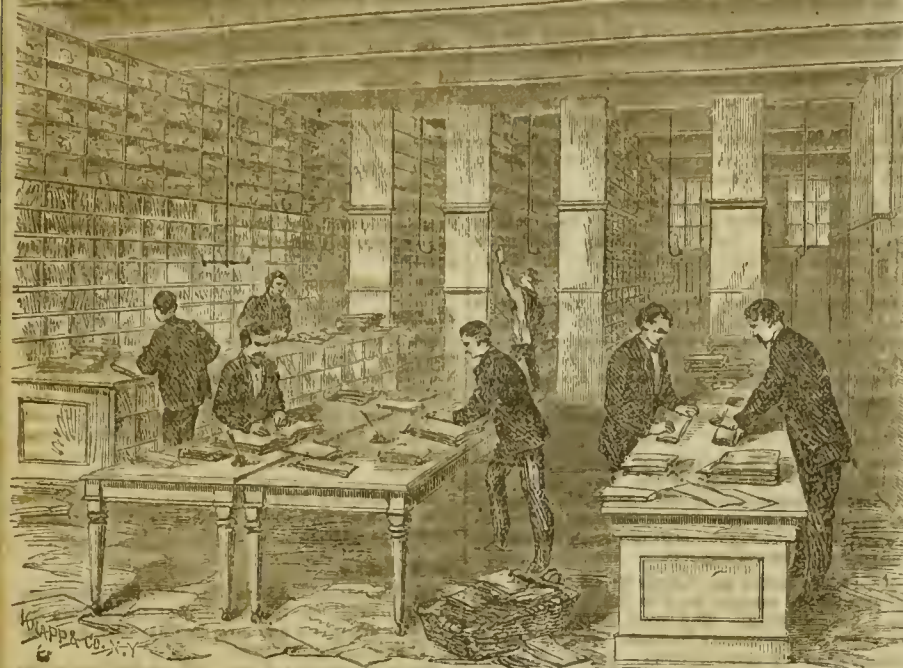
THE NEWSPAPER ROOM.

A Pamphlet of 32 pages, containing a list of over 1,000 Newspapers, which are particularly recommended to advertisers, with estimates showing the cost of any advertisement, sent free on receipt of Stamp.