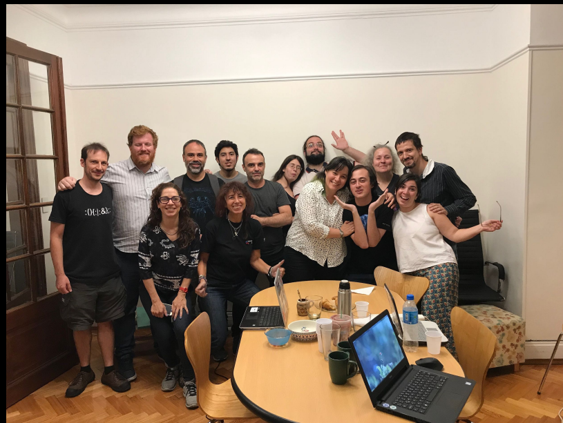
“Espacio de edición Wikidata 2019 01” by Constanza Verón (WMAR). CC-BY-SA 4.0 ( Link )