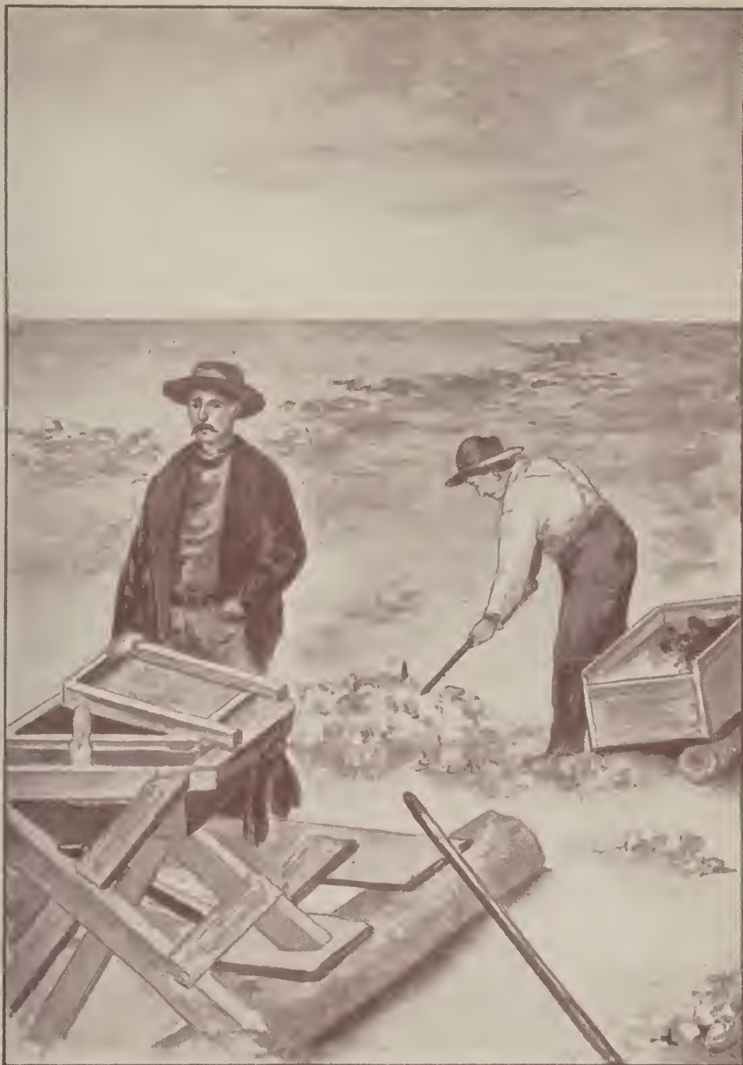
“LET’S WATCH THOSE TWO MEN. THEY HAVE EVIDENTLY STAKED A CLAIM TOGETHER.”