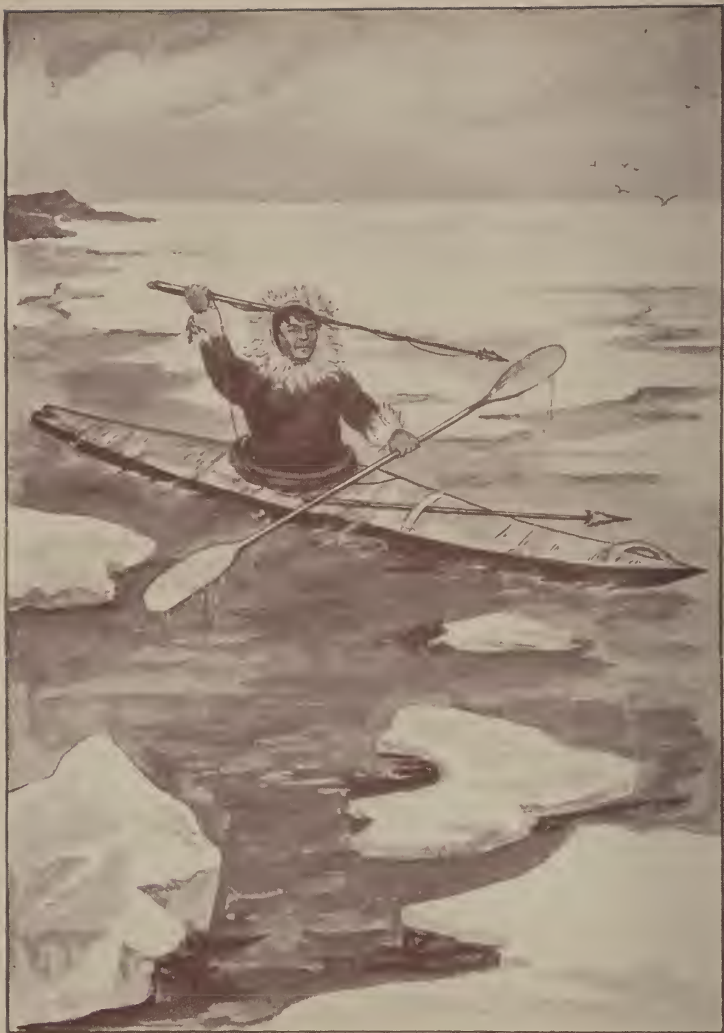
"AWAY WENT ANOTHER STINGING LANCE."