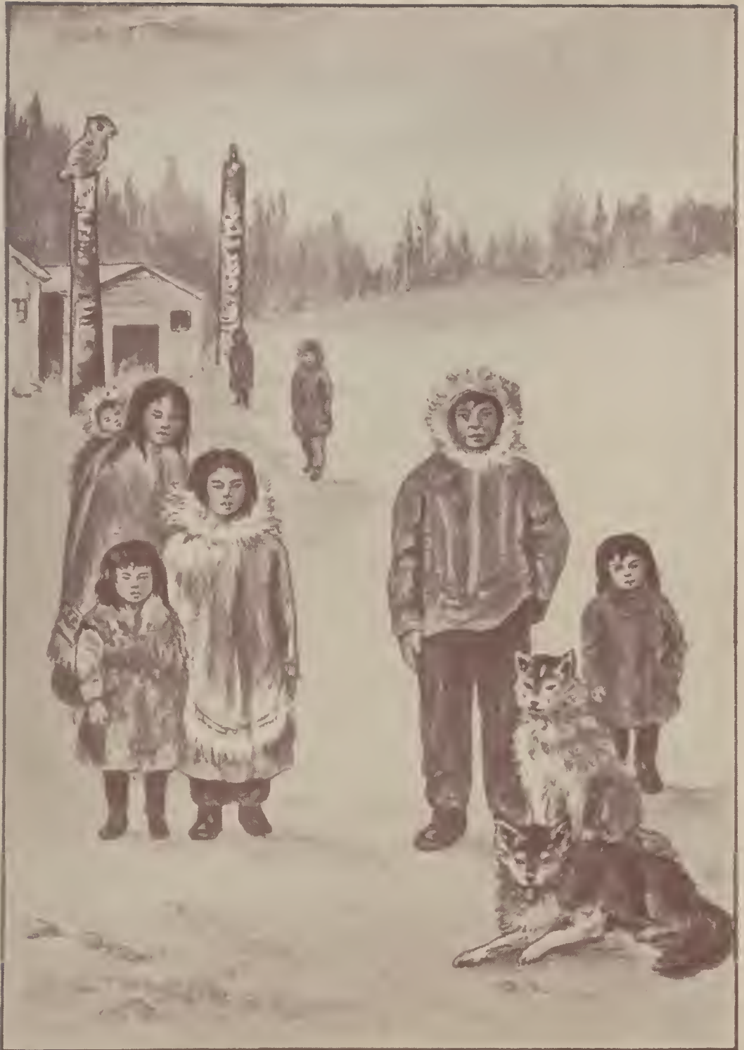
“A GROUP OF PEOPLE AWAITING THE CANOES.”