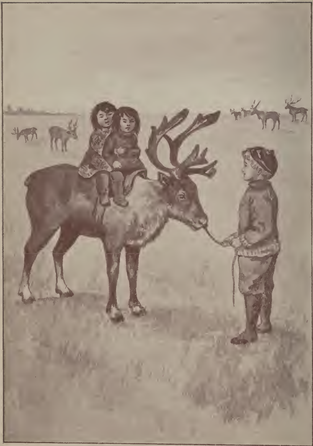
"TWO FUNNY LITTLE LAPP BABIES HE TOOK TO RIDE ON A LARGE REINDEER."