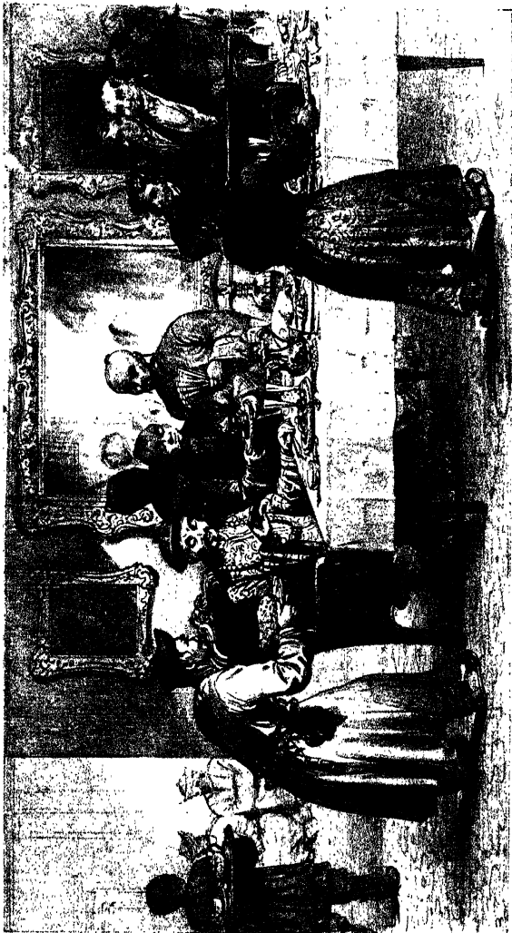
PLAYING THE GRAND ROLE — Illustration from 'The Grand Role'.