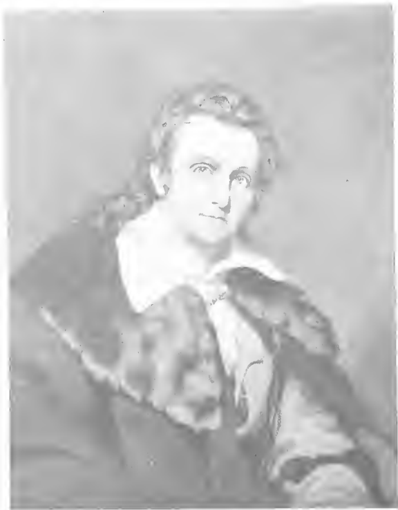
JOHN J. AUDUBON.