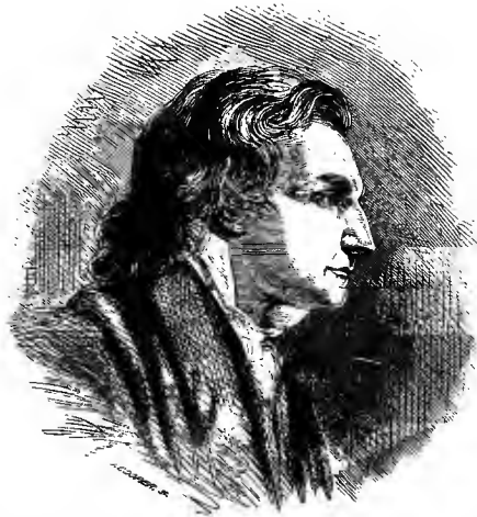
AUDUBON AT GREEN BANK, LIVERPOOL. ( From a drawing by himself. ) Sept. 1826.

LONDON: SAMPSON LOW, SON, & MARSTON, CROWN BUILDINGS, 188, FLEET STREET. 1869.