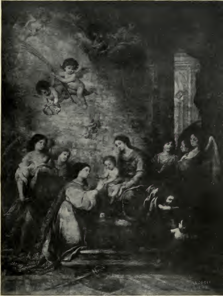
MURILLO THE MARRIAGE OF ST. CATHERINE (Cadiz)