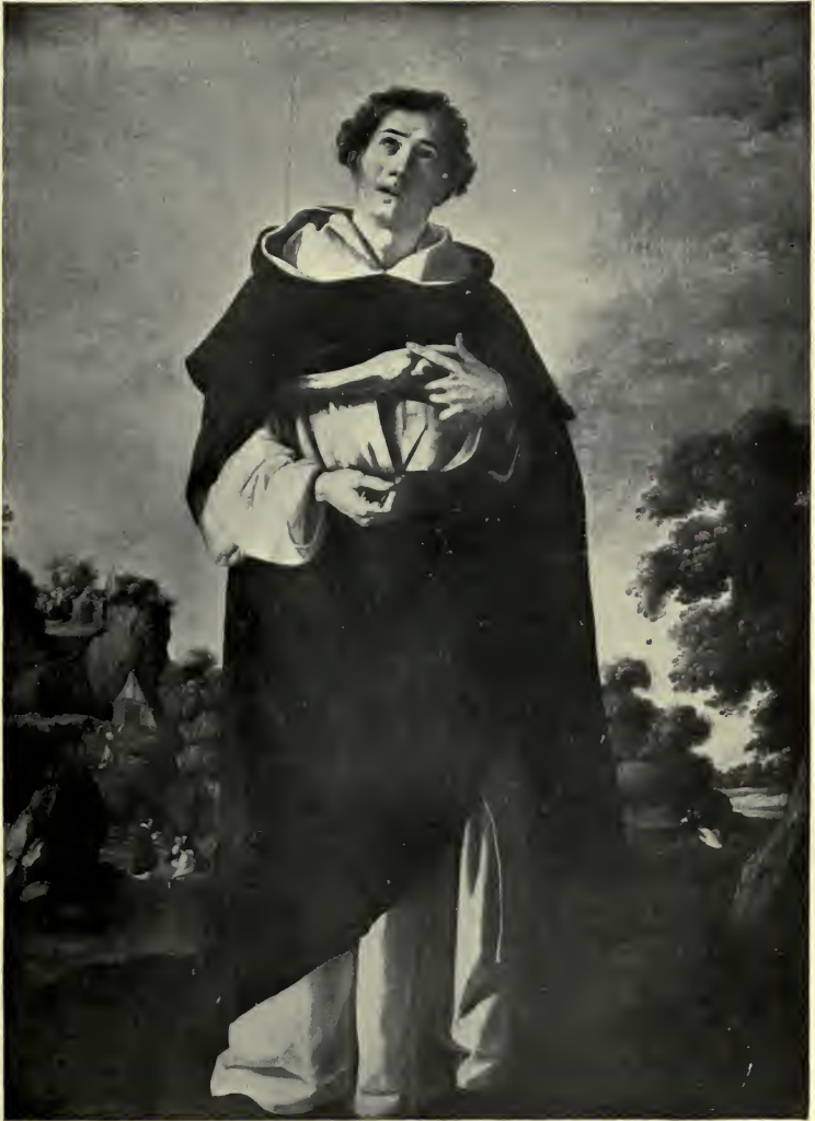
ZURBARAN THE BLESSED ENRIQUE SUZON ( Museum, Seville )