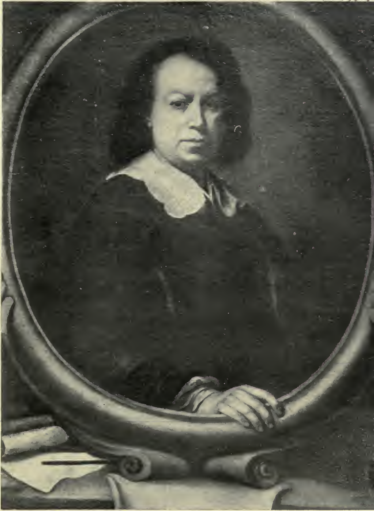
TOVAR PORTRAIT OF MURILLO (Prado)