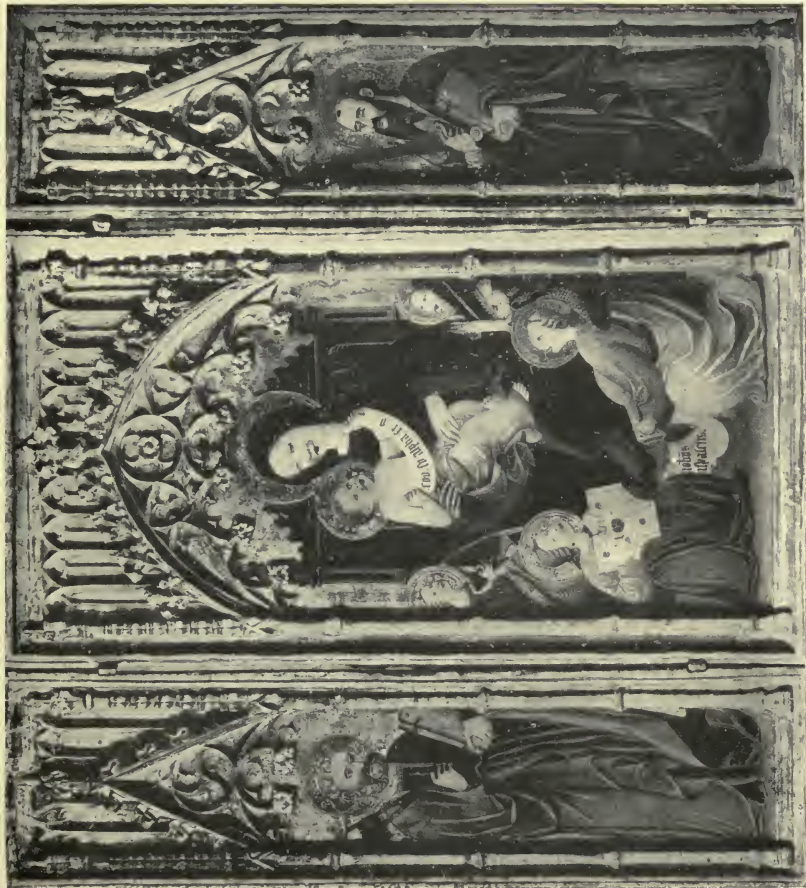
JUAN HISPALENSE (TRIPTYCH)