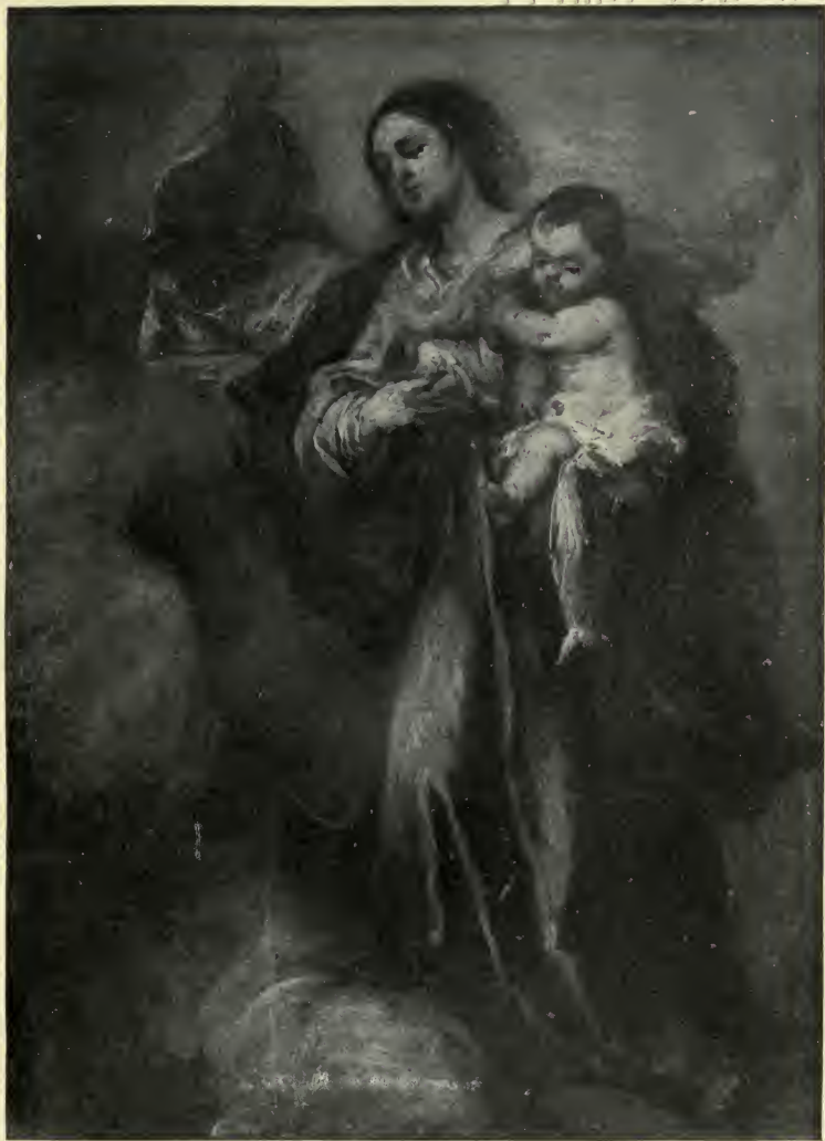
MURILLO SKETCH FOR THE "VIRGIN AND ST. BERNARD" (Prado, Madrid)