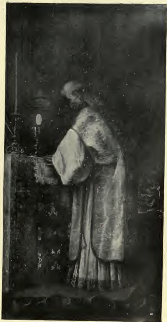
VALDES LEAL SAYING MASS