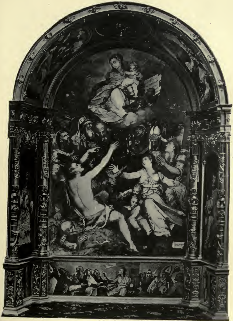
L. DE VARGAS ALTAR-PIECE OF "LA GAMBA"