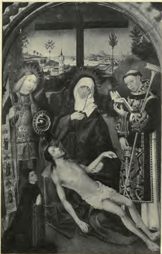
JUAN NUÑEZ VIRGIN WITH THE DEAD CHRIST (Cathedral, Seville)