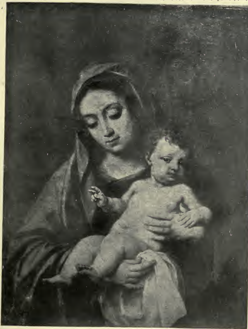
CANO VIRGIN AND CHILD (Cathedral, Seville)