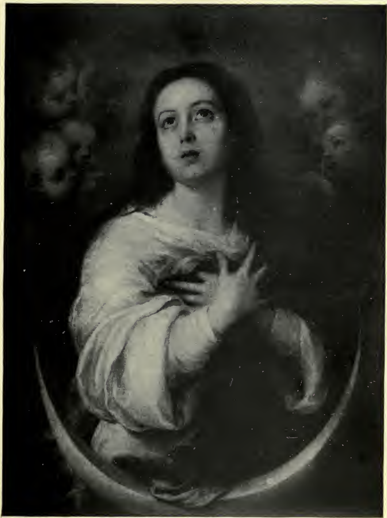
MURILLO MADONNA (Prado, Madrid)