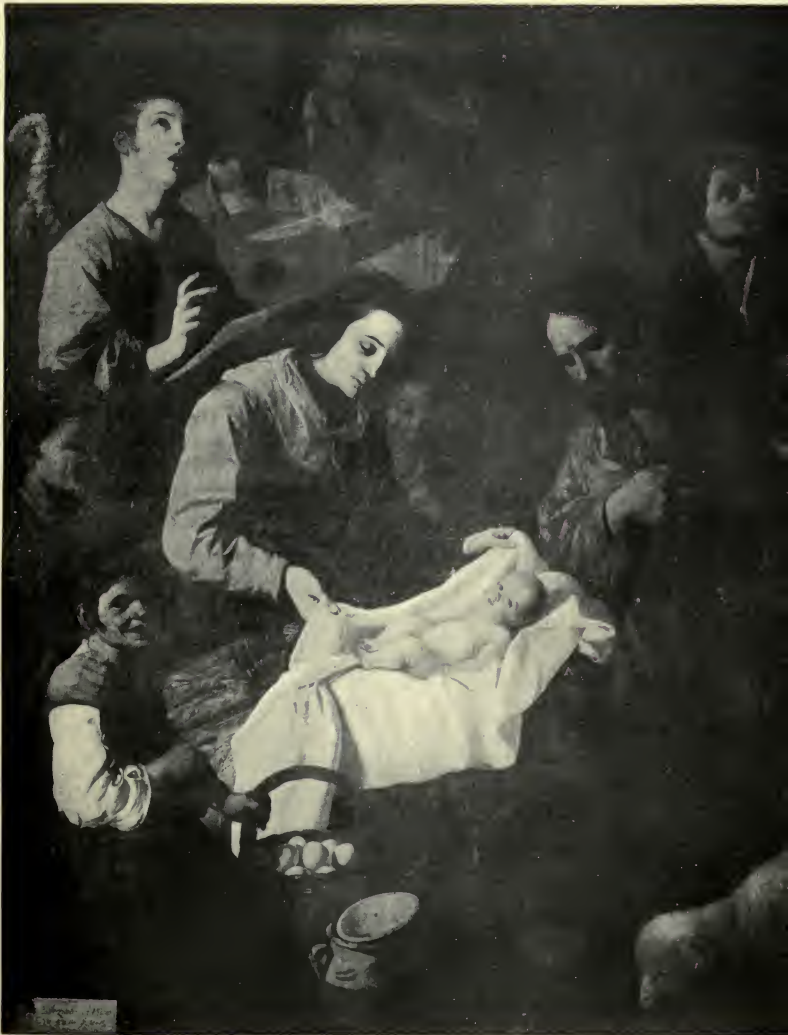
ZURBARAN THE NATIVITY

(Collection of the Duke of the Montpensiere)