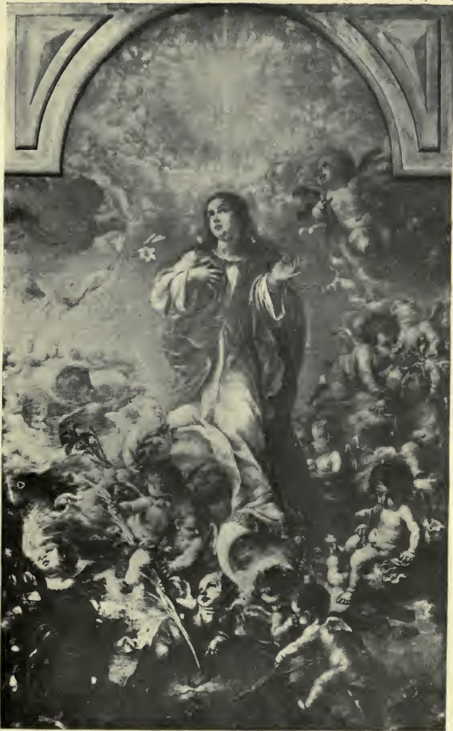
VALDES LEAL THE IMMACULATE CONCEPTION (Museum, Seville)