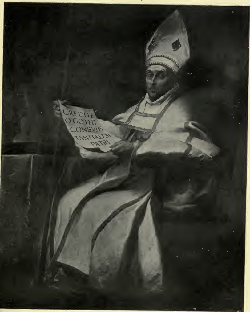
MURILLO ST. LEANDRO (Cathedral, Seville)