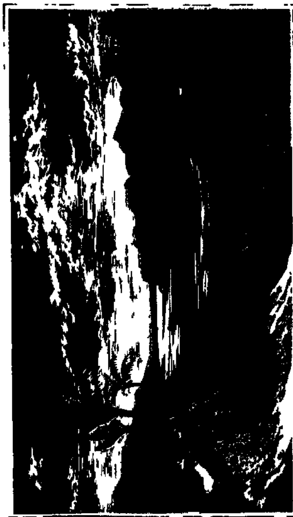
THE DEAD SEA