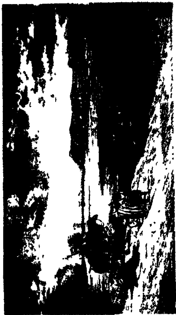
ISTHMS OF SUEZ