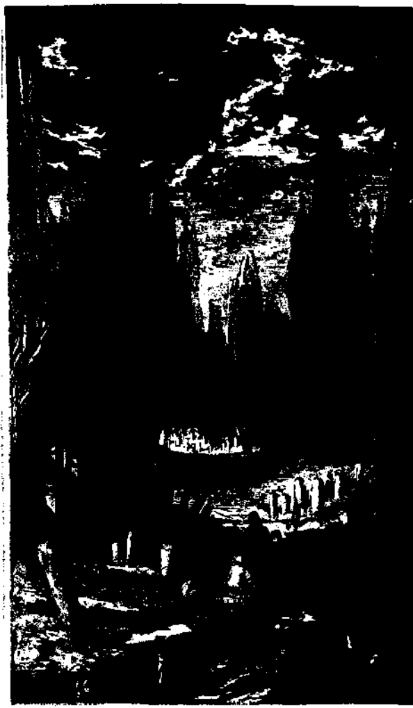
BURIAL PLACE AT SCUTARI.