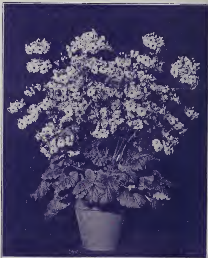
The New Primula Malacoides "Eriksonii"