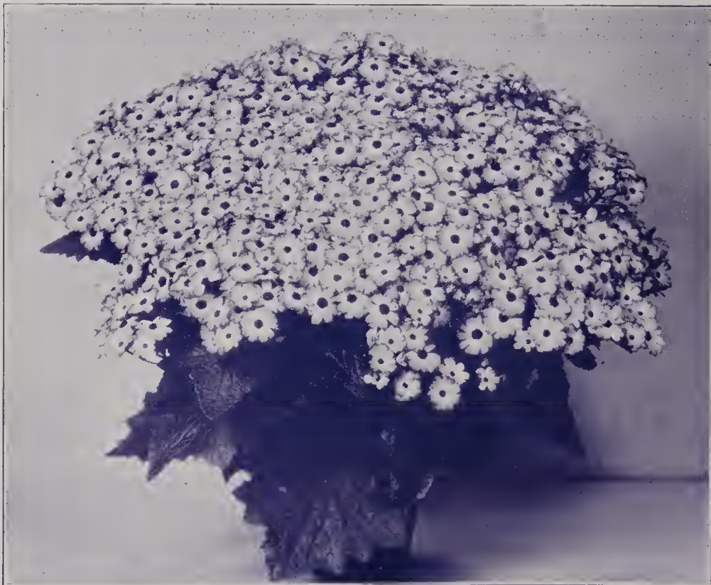
Specimen 7-inch Pot of Cremer's First-Prize Cinerarias A Most Valuable New Introduction

Prices: Tr. Pkt. .... $1.50 1, 32 oz. .... $4.50 1/16 oz. .... $8.00