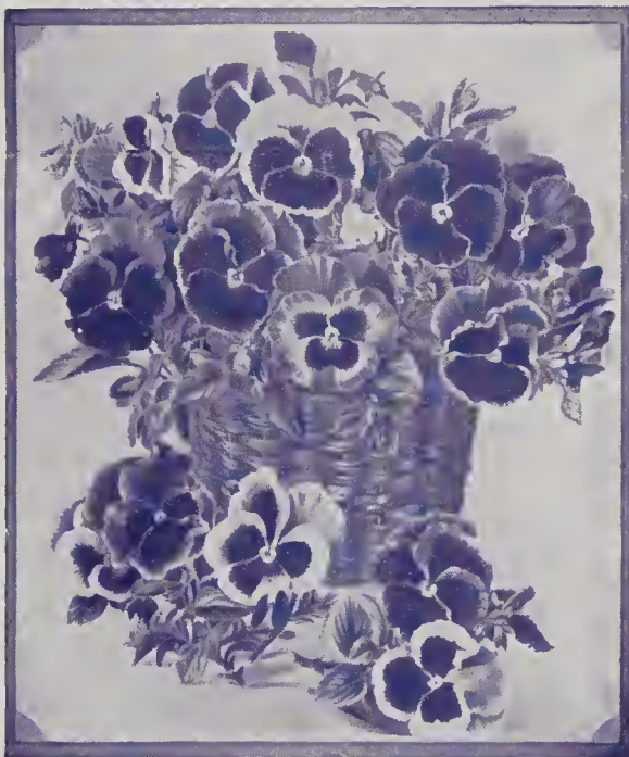
A. B. C. "De Luxe" Pansies (One-sixth natural size)

"De Luxe" Mixture will satisfy your critical trade both as to size and variation of coloring. Truly the "last word" in Pansy mixtures.