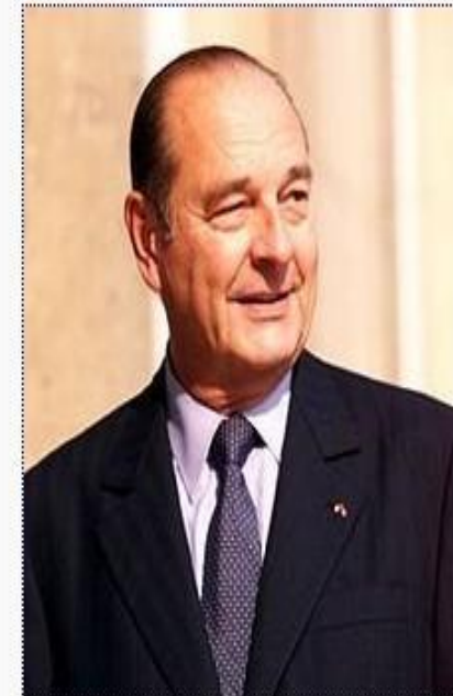
Chirac in 1999