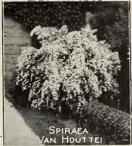
SPIRAEA VAN HOUTTEI