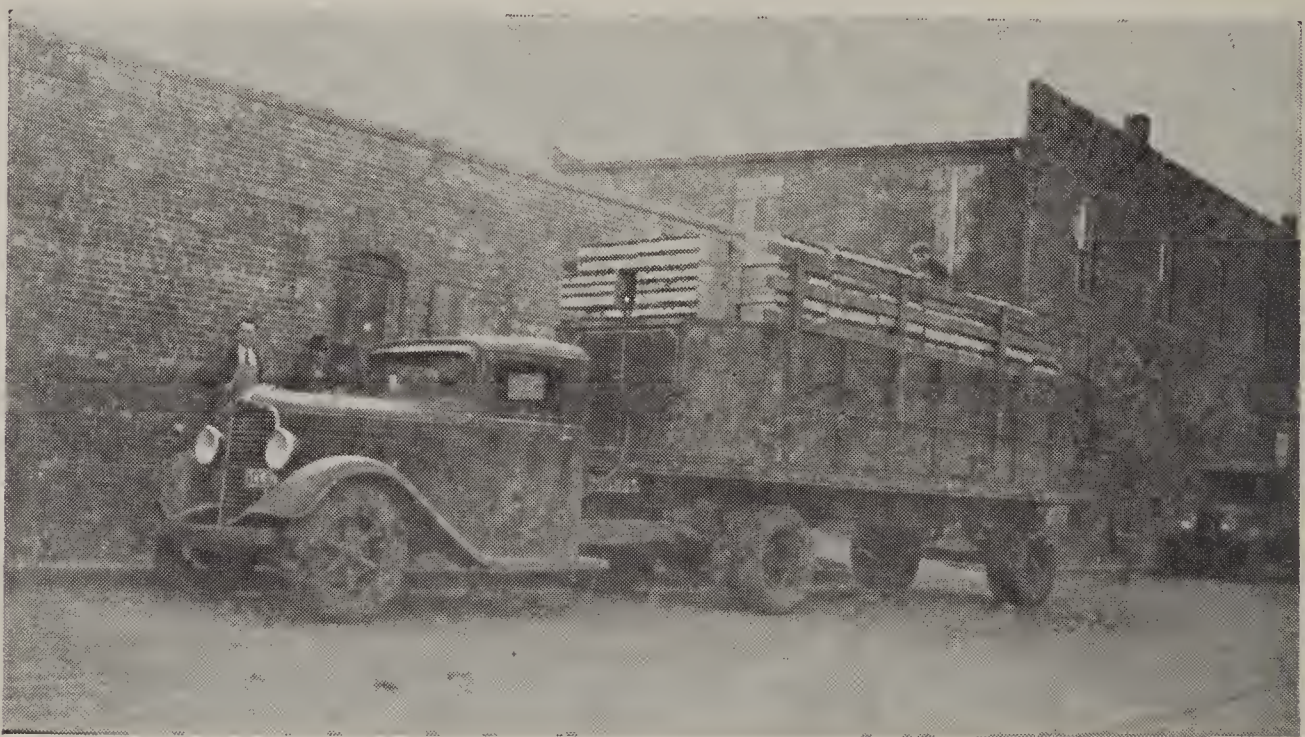
Meng's Auto Trucking Service of Kansas

A truck load of 600,000 strawberry plants at their destination in Kansas and delivered in 50 hours from my packing house by Meng's Auto Trucking Service. And I shipped as many more plants by Railway Express to the same place in Doniphan Co., last spring. Growers there say "Todd's plants do better for them."