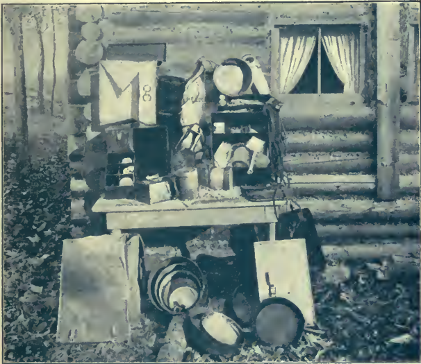
The Cooking Kit

Have all your tin-ware stamped out of extra heavy block tin, as camp fires play havoc with solder. Don't let any one persuade you to take aluminum