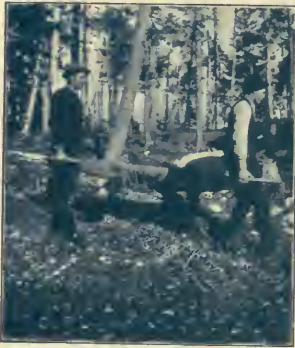
Taking an Injured Man Out

THERE is nothing so necessary to have in camp as a medicine case with medicines for the common cases of illness, and a small case of surgical instru-