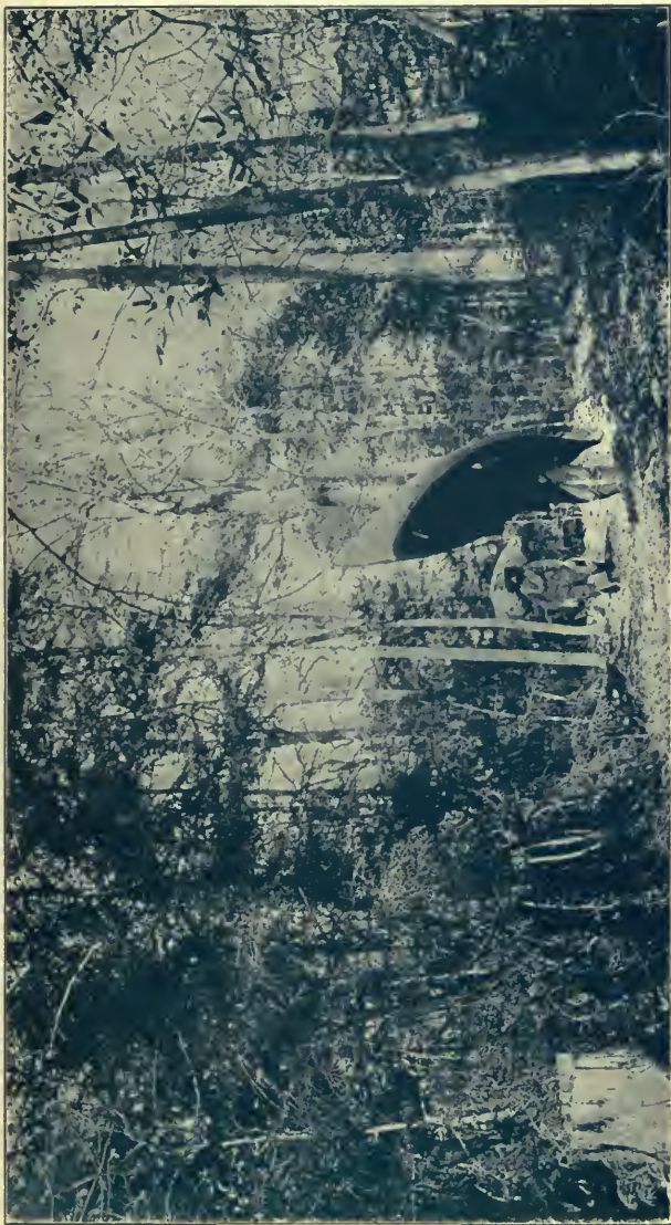
Getting Back to Civilization