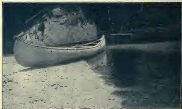
A Reminder of Wood Life

Never use buckshot in a choked barrel, as the shot are so large that they are apt to flatten in getting through the choke of the barrel, which makes them scale when going through the air. There is also a liability of the shot jamming and the gun exploding.