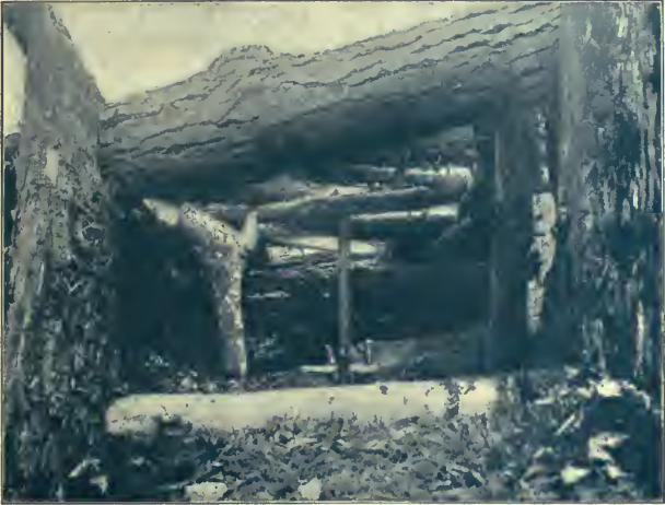
A Bear Trap

The advantage of using a deadfall instead of a steel trap for bear as well as other animals, is that it generally kills the animal when it is sprung, and if