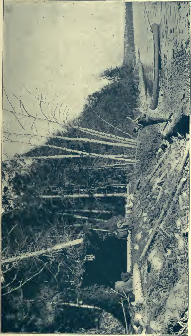
A Lean-to Camp