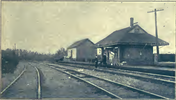
Waiting for the Train

Have the person lie down and give him as much hot water as he can drink in order to wash out his stomach. If the vomiting does not stop after this put a mustard plaster on the pit of his stomach.