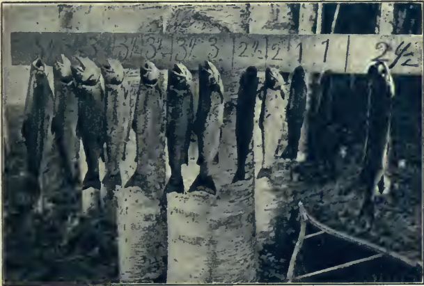
A Day's Record

If you have fastened your fish and he pulls hard give him line, but make him earn every inch of it. When he gets tired reel him in, but look out for his last break, for nearly every trout, no matter how