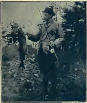
Satisfied with His Catch

THE land-locked salmon, the winanische, the wananische, and the ouinaniche of Canada are the same fish. Although many of these fish are land-