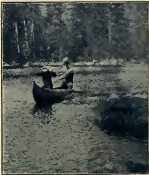
An Unexpected Shot

THE ambition of most every sportsman is to have hanging in his hall the head of a deer with a good pair of antlers. This head, if he is a true sportsman, he