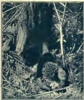
Guarding the Nest

ALTHOUGH in the Bible story the quail sent as meat to the famished is properly called a quail, there is no such bird in this country, as the American quail, so