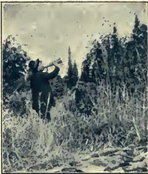
A Love Call

It will only be a question of time before you will want a shot at a moose, as he is the largest of the deer family and often weighs fifteen hundred pounds.