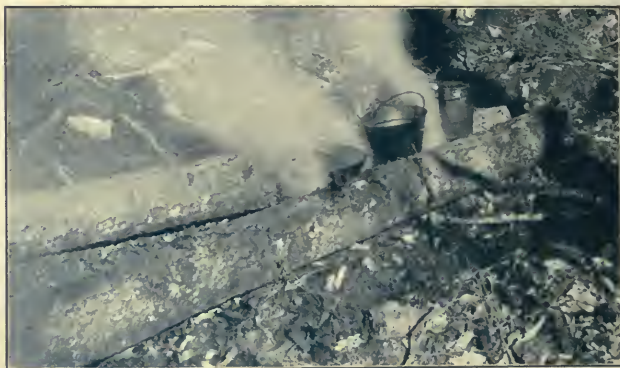
The Simplest Way

pole with one end held down by a stone or a log, the other end being over the fire. The common way, however, is to drive two crothed sticks into the ground, one on each side of the fire, and put a cross piece from one to the other, from this cross piece hanging forked sticks, with nails driven into them at different heights to hold the boiling pails on, the