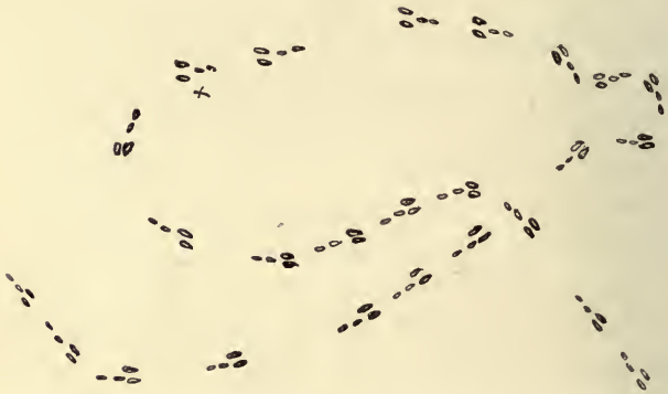
Rabbit Tracks in Snow. Drawn by the Author's Young Chum.

covered with moss and leaves, as though nature were trying to give it a decent burial. Again, it is the stray fragment of some bird song which adds to the wildness and feeling of isolation, now a woodpecker hammering away at a tree or a borer drilling its way through a decaying trunk, or perhaps it is the croaking of frogs. As you move through the wilderness you come upon a tangled mass of dead wood in some gloomy stretch of forest, and think of