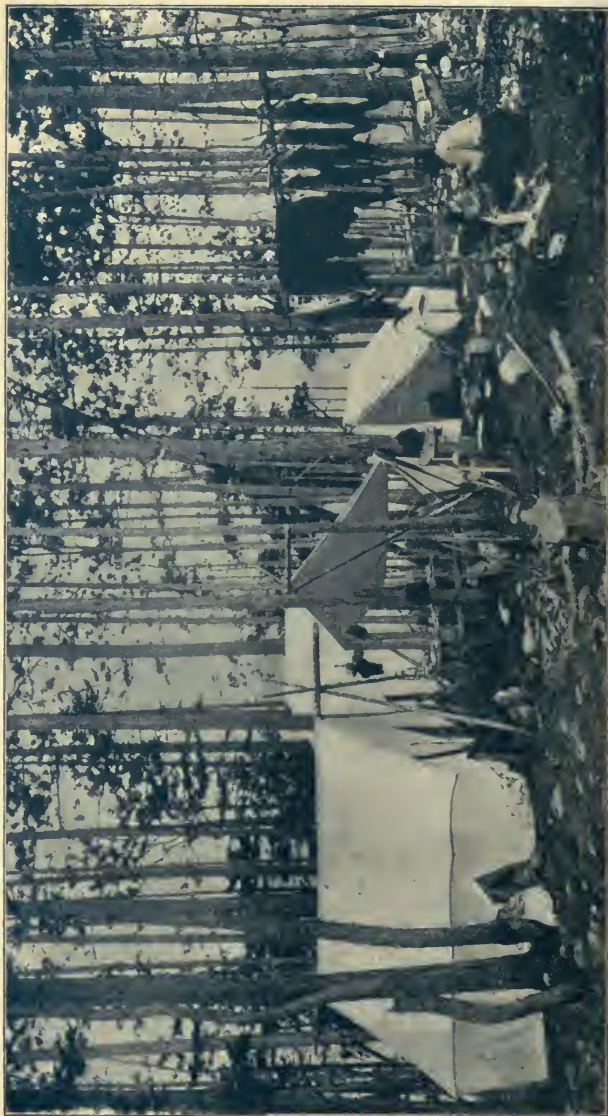
Life in the Wilds (Use magnifying glass to get details)