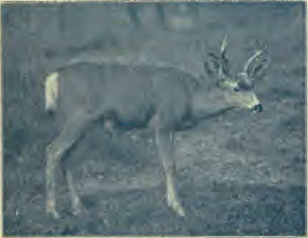
Rocky Mountain Blacktail

dent, lets his shooting get tucked away in a corner of his thoughts, is the one to whom still hunting is a pleasure, for the secret of this kind of hunting is not wholly hearing the sharp breaking of a twig which makes one quiver with restrained excitement, or the rush of a deer through the undergrowth which makes