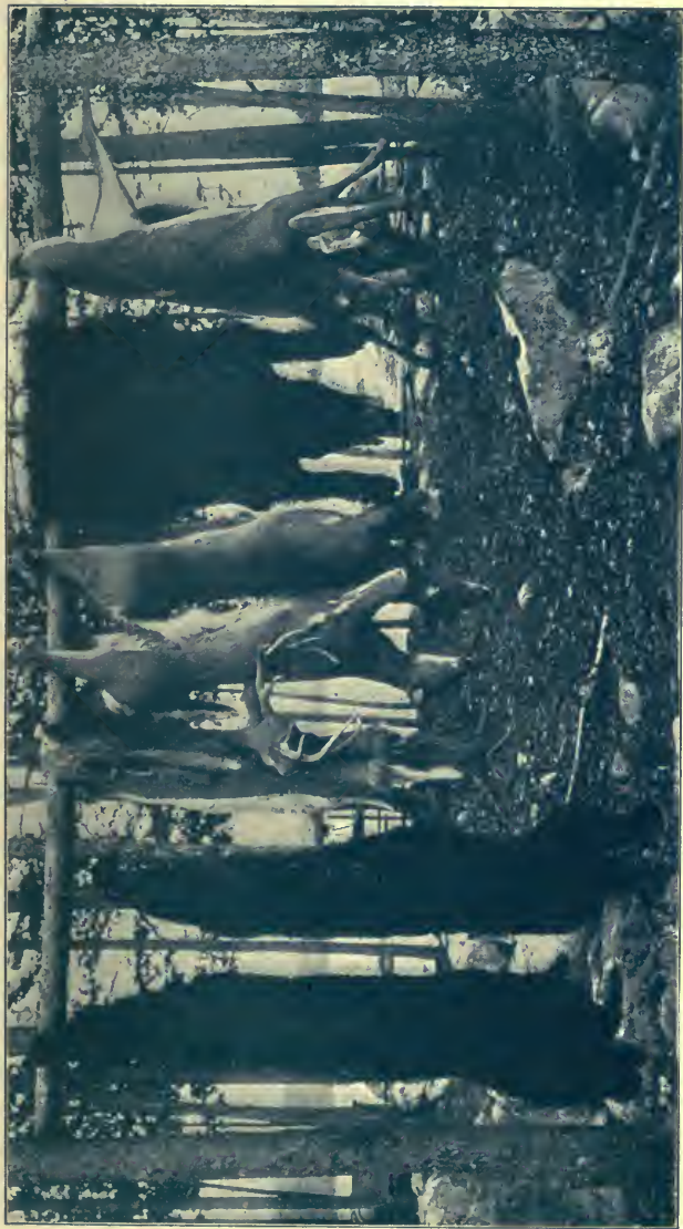
Our Best Week's Work