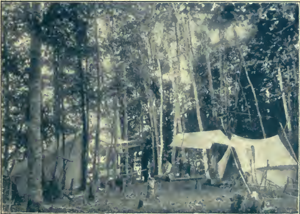
After the Day's Work is Over

If you have forgotten to bring your waterproof match box get some dry, decomposed wood, or punk as it is called, out of a decayed stump or rotten cedar log, and with a piece of quartz or a hard, jagged rock make a spark by striking it against your knife blade, with slanting blows toward the punk. If you have forgotten your knife use two rocks, and if you cannot find any punk make a fine lint with some of the cotton lining of your coat. Don't waste your time testing those Indian fables of rubbing two sticks together until one begins to burn, or those yarns about scraping fine curly shavings from a pine stick and lighting them with a spark.