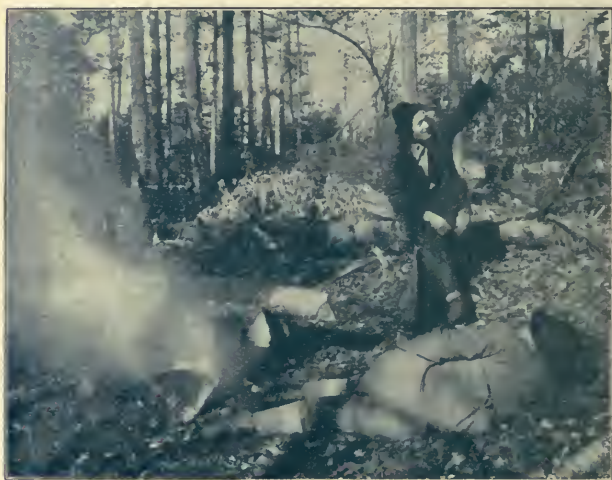
Telling About It Afterward

Remember that if you take your head in your hands and keep your heart out of your mouth, being lost in the woods is a comedy and not a tragedy.