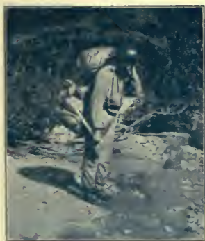
Tump-line and Load

Don't go into the woods if there is something on your conscience which keeps it pricking, as nature is sure to get you on to bed rock principles.