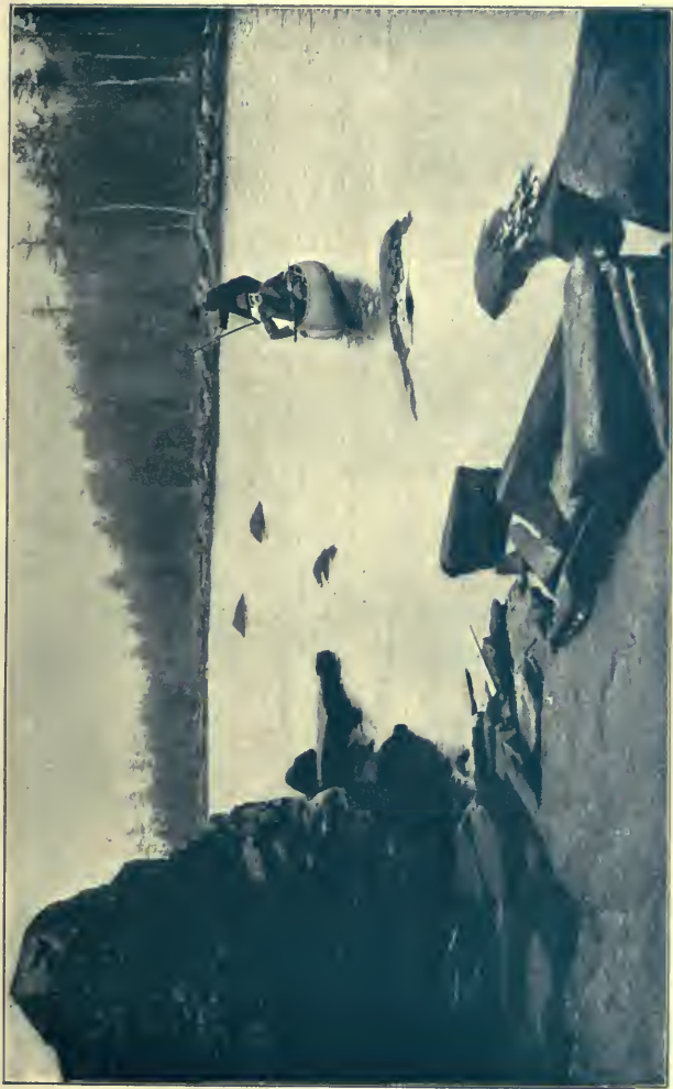
Stealing on to a Bunch of Ducks