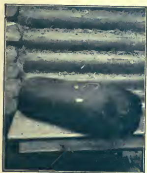
The Wangan Bag

EVERYTHING you take with you into the woods, except your guns and the canoes, is known as the wangan. It includes your clothing, all articles for personal