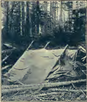
The Quickest Camp to Set Up

The most quickly constructed shelter is made by leaning three seven-foot poles against a fallen tree, and then spreading your rubber blankets over the poles, but be sure the tree is flat on the ground or there will be a draught under it.