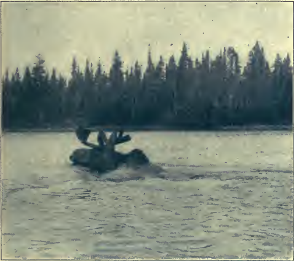
Shot with a Camera

If a moose falls backward on his haunches you may be sure he is mortally wounded, as he differs in this respect from a deer, which falls forward when hit in a vital spot.