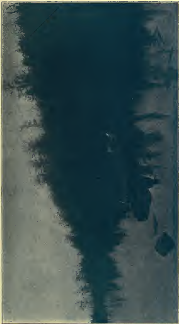
Getting a Shot After Dark