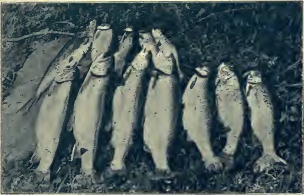
Enough for Breakfast

Pound out a piece of lead into a sinker and for ten cents you have an outfit. Bear in mind, however, that this is not angling which is a science, and that it requires brains to make a gamey fish take an artificial fly.