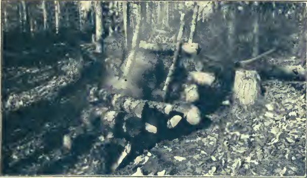
A Fire Built for the Night

stakes, and then drive in two stakes to hold them in position. As the bottom log against the stakes burns away the one above it will drop into its place and you will have a fire which will burn evenly all night, and radiate the heat into your tent instead of into the woods.