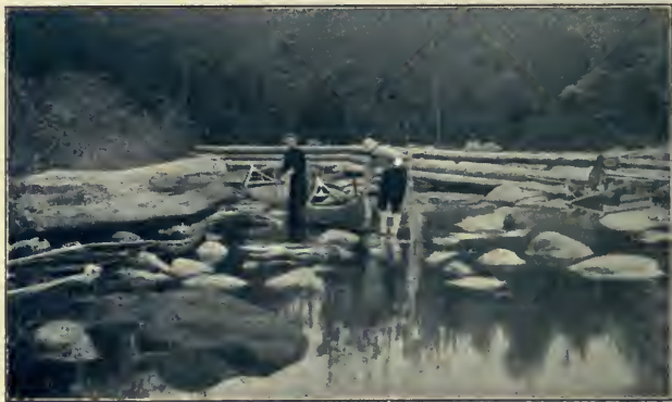
Getting into an Unfrequented Country

Remember that the golden rule in trapping is patience. Try it.