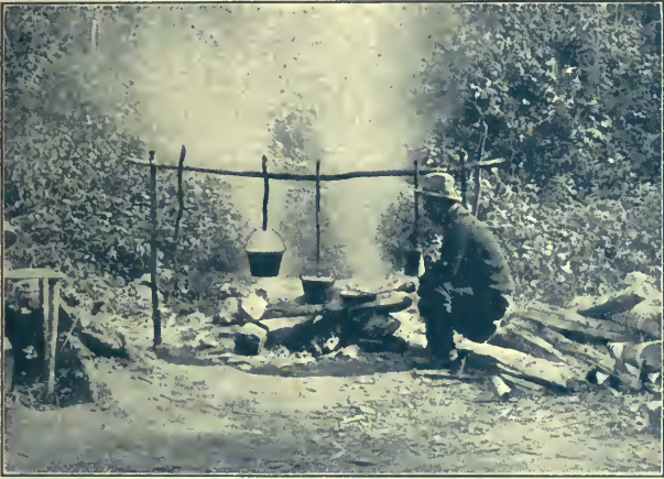
The Common Way

buckwheat cakes, boiled, fried, or stewed potatoes, rice cakes, doughnuts, and coffee; for dinner, rice soup, pea soup, potato soup, venison soup, fish chowder, partridge stew, fish in various forms, roast venison, pot pie, broiled partridge, geese, ducks, macaroni, rice, succotash, boiled beans, onions, potatoes in dif-