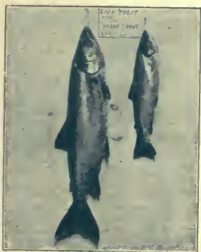
Lake and Brook Trout

CONTEMPLATIVE men who love quiet places generally go a-fishing, the favorite fish, as a rule, being the square-tail trout, otherwise known as speckled