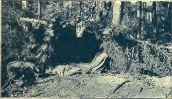
Known in the Woods as a Kennel

Next to these come the other firs, hemlock, juniper, cedar, and spruce in the order named, and then cherry, willow, alder, and the shrubs. If properly made one of these beds is as easy to sleep on as a hair mattress on wire springs. The bough bed should be at least a foot thick and be shingled from the back toward the opening, so that the butts will always be underneath. Before you begin laying them put a log at