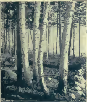
One Reason Why We Go into the Woods

MEN who go hunting, you will find, are divided into three classes: first, those who in a lazy way in the summer time do a little shooting when there is