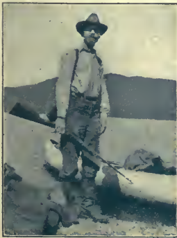
Ready for Business

THE ordinary way to fire a gun is to bring it against the shoulder, but a quicker way is to bring it into the crook of the arm, having the elbow nearly on a level with the shoulder. By