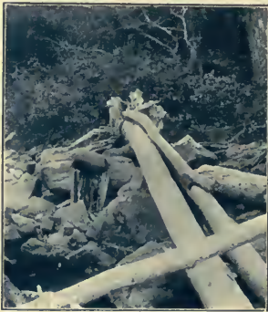
A Mink Trap

If you are to take your vacation between November and April it will pay you to take along a few traps, as it is always interesting to have something