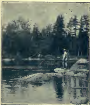
Patience is Everything

ENTHUSIASTIC black bass anglers claim that inch for inch and pound for pound the black bass is the gamest fish that swims. There are two varieties,