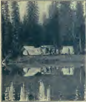
A Temporary Camp

So much for the preliminary canter. Let's now take it for granted that we have been paddling all day long away from civilization, and are looking for