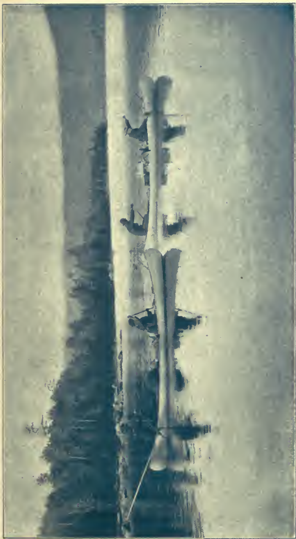
Starting for Home