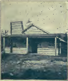
Hard to Find When You're Lost

NEARLY every one who has lived in the woods has at some time been lost, and when the usual run of bear stories are being told around the camp fire there