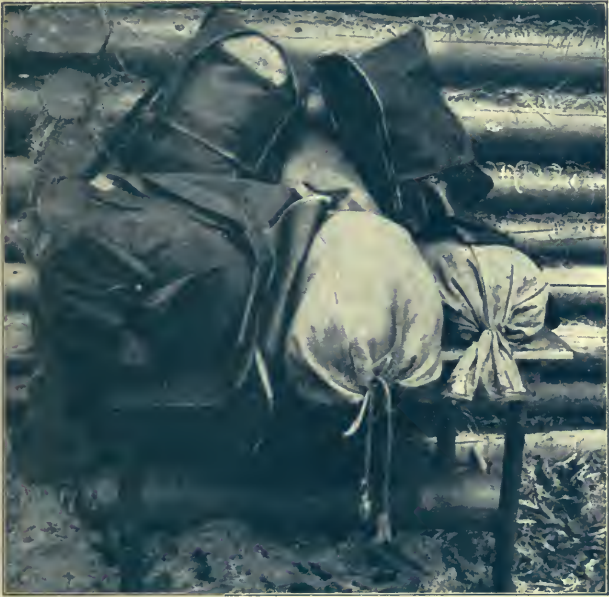
Ready for the Wilds

A camp stove is also a thing not to be laughed at, as it will heat your tent in cold weather and in pleas-