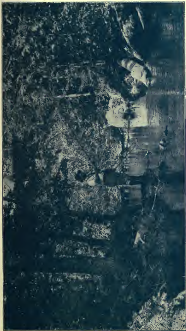
A Good Place for Trout