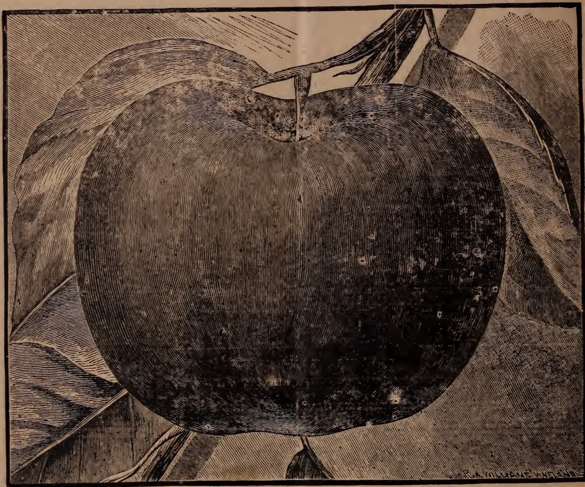
DELAWARE RED WINTER APPLE.