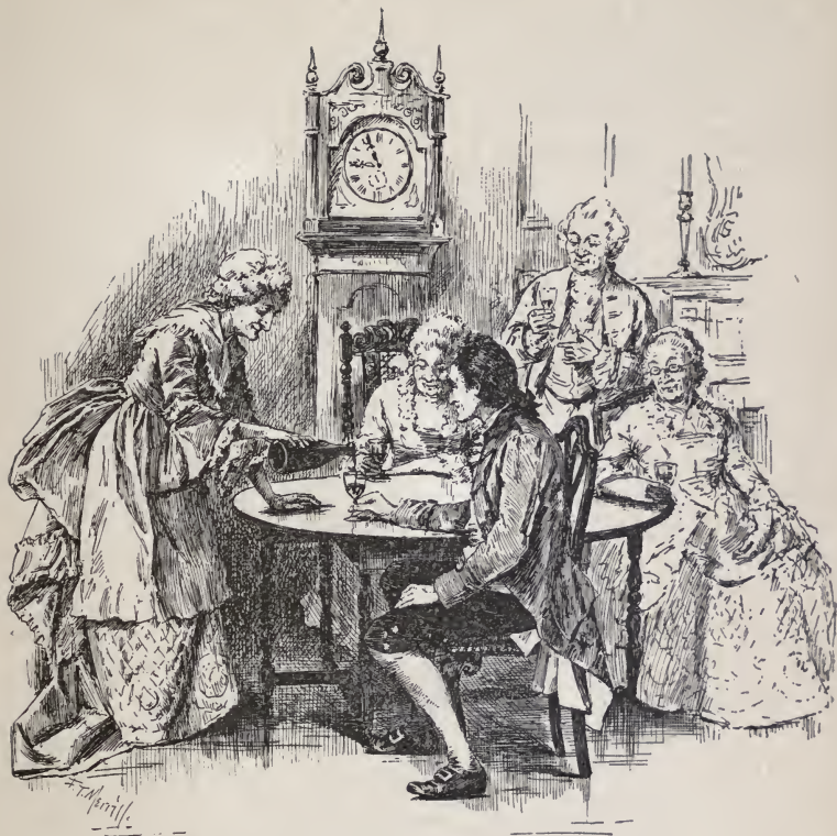
A few of the stanch, though crestfallen, old Tories