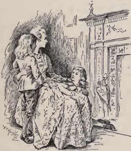
"One story of each blue tile

boast even of faded magnificence. The panelled wainscot is covered with dingy paint, and acquires a duskier hue from the deep shadow into which the Province House is thrown by the brick block that shuts it in from Washington Street. A ray of sunshine never visits this apartment any more than the glare of the festal torches which have been extinguished from the era