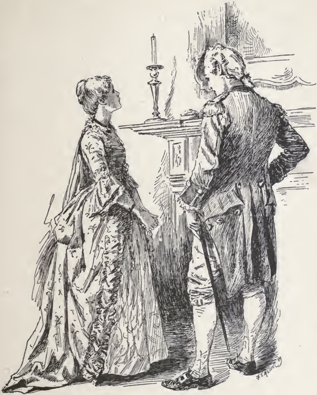
Ÿ young' captaine of Ÿ castle tells Ÿ story of Ÿ picture.