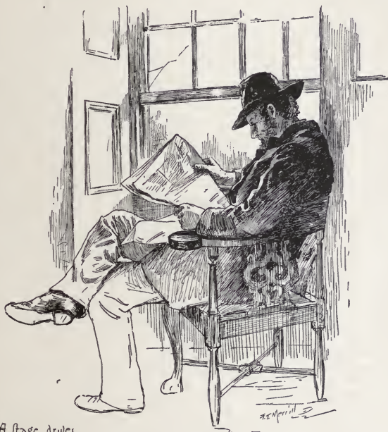
A stage driver

maid, no doubt. In truth, it is desperately hard work, when we attempt to throw the spell of hoar antiquity over localities with which the living world, and the day that is passing over us, have aught to do. Yet, as I glanced at the stately staircase, down