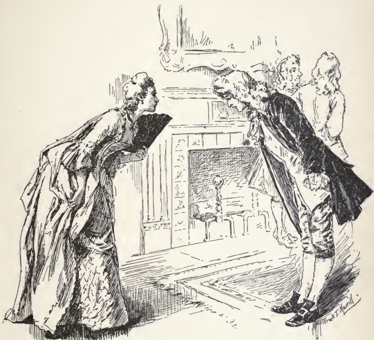
A gathering of rank, wealth, and beauty