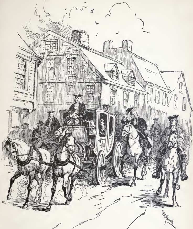
the beautiful Lady Eleanore cometh to Boston -