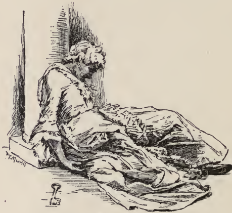
Fastidius unto death

that the clock was still striking in a bygone century. Neither of us would have wondered had a hoop-petticoated phantom of Esther Dudley tottered into the chamber, walking her rounds in the hush of midnight, as of yore, and motioned us to quench the fading embers of the fire, and leave the historic precincts to herself and her kindred shades. But, as no such vision was vouchsafed, I retired unbidden, and would advise Mr. Tiffany to lay hold of another auditor, being resolved not to show my face in the Province House for a good while hence, — if ever.