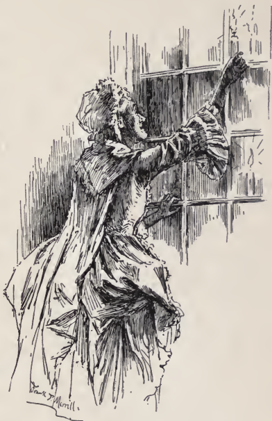
The King of England's birthday -

Oftentimes it was her custom to climb the weary staircase that wound upward to the cupola, and thence strain her dimmed