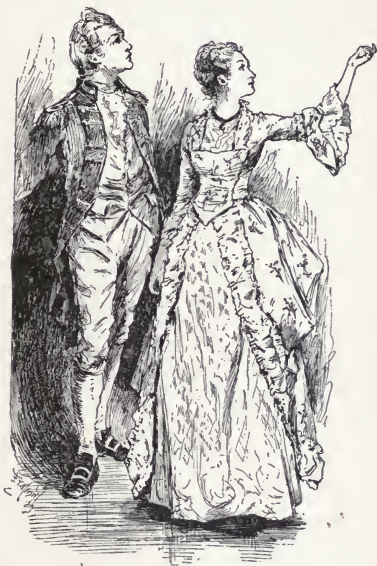
Alice beckoned to the picture

In the evening, Lieutenant-Governor Hutchinson sat in the same chamber where the foregoing scene had occurred, surrounded by several persons whose various interests had summoned them together. There were the Selectmen of Boston, plain, patriarchal fathers of the people, excellent representatives of the old puritanical founders, whose sombre strength had stamped so deep an impress upon the New England character. Contrasting with these were one or two members of Council,