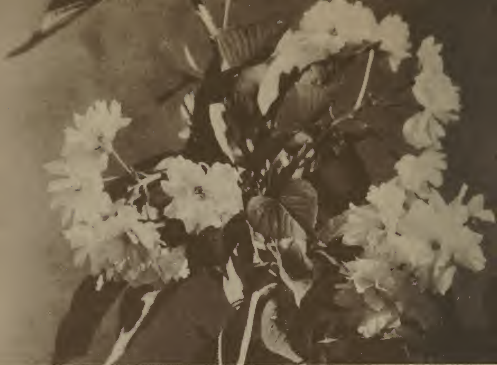
Branches of Japanese Cherries last a long time after cut. This is variety Hisakura