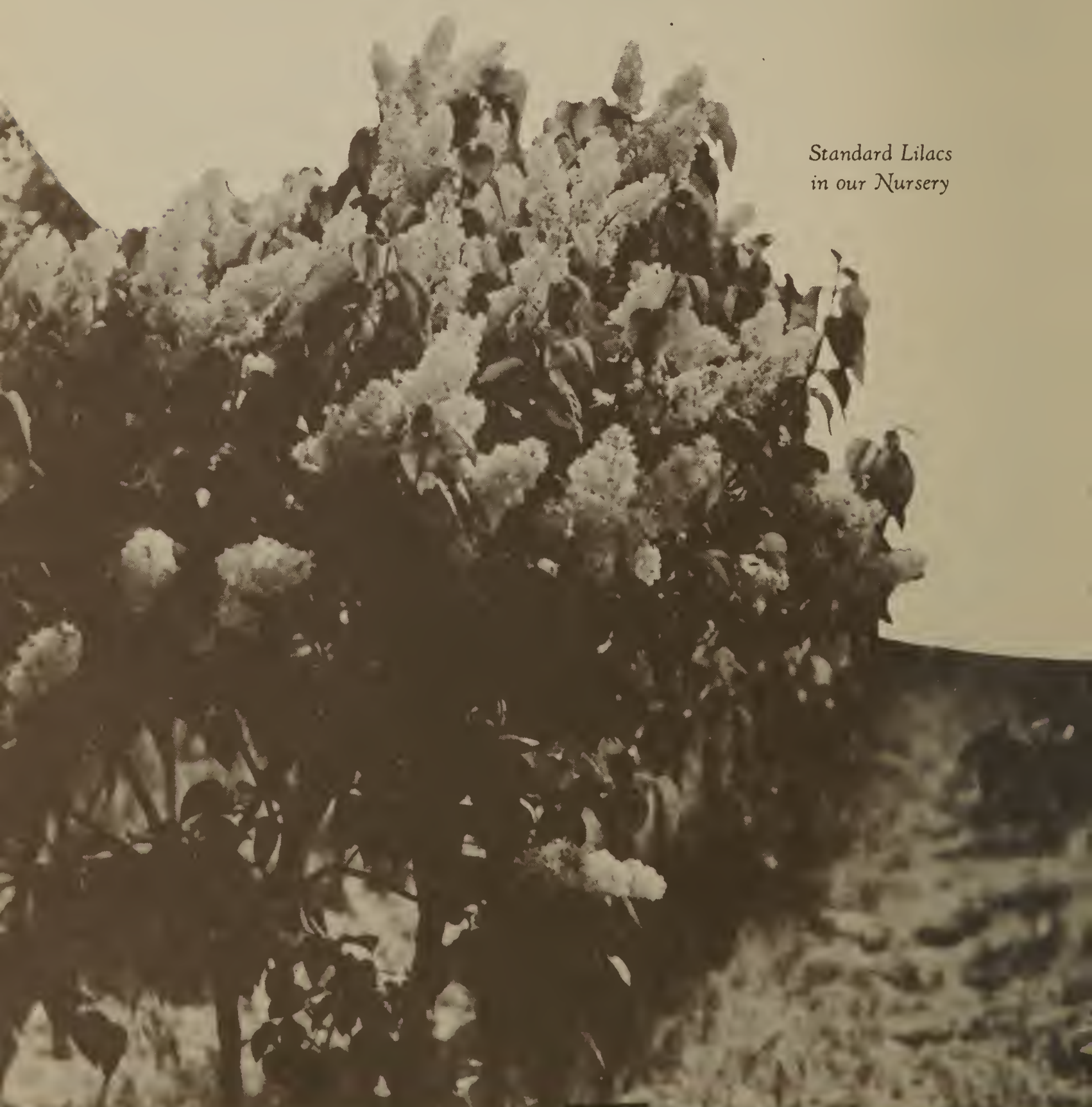
Standard Lilacs in our Nursery

Please Note: As we do not always have every variety in all sizes, we will appreciate it if you will state in your order what other size we can send in case the size you wish should be sold out.