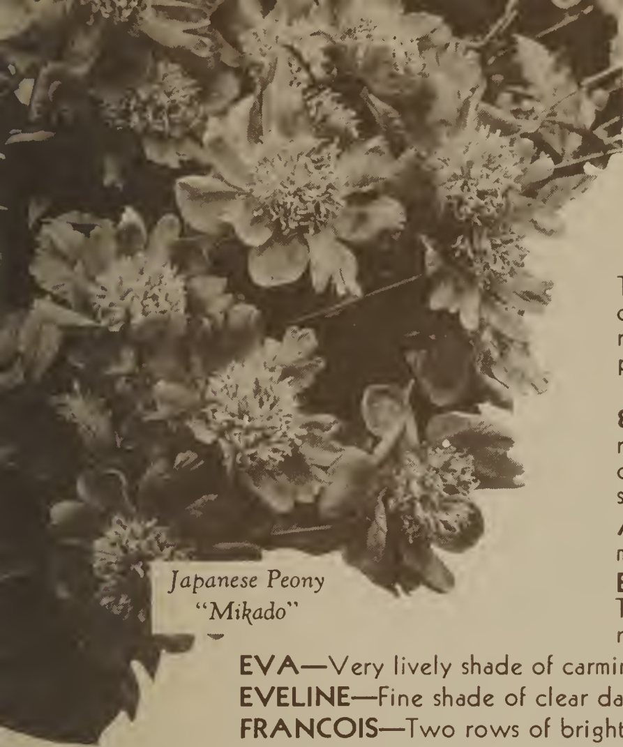
Japanese Peony "Mikado"