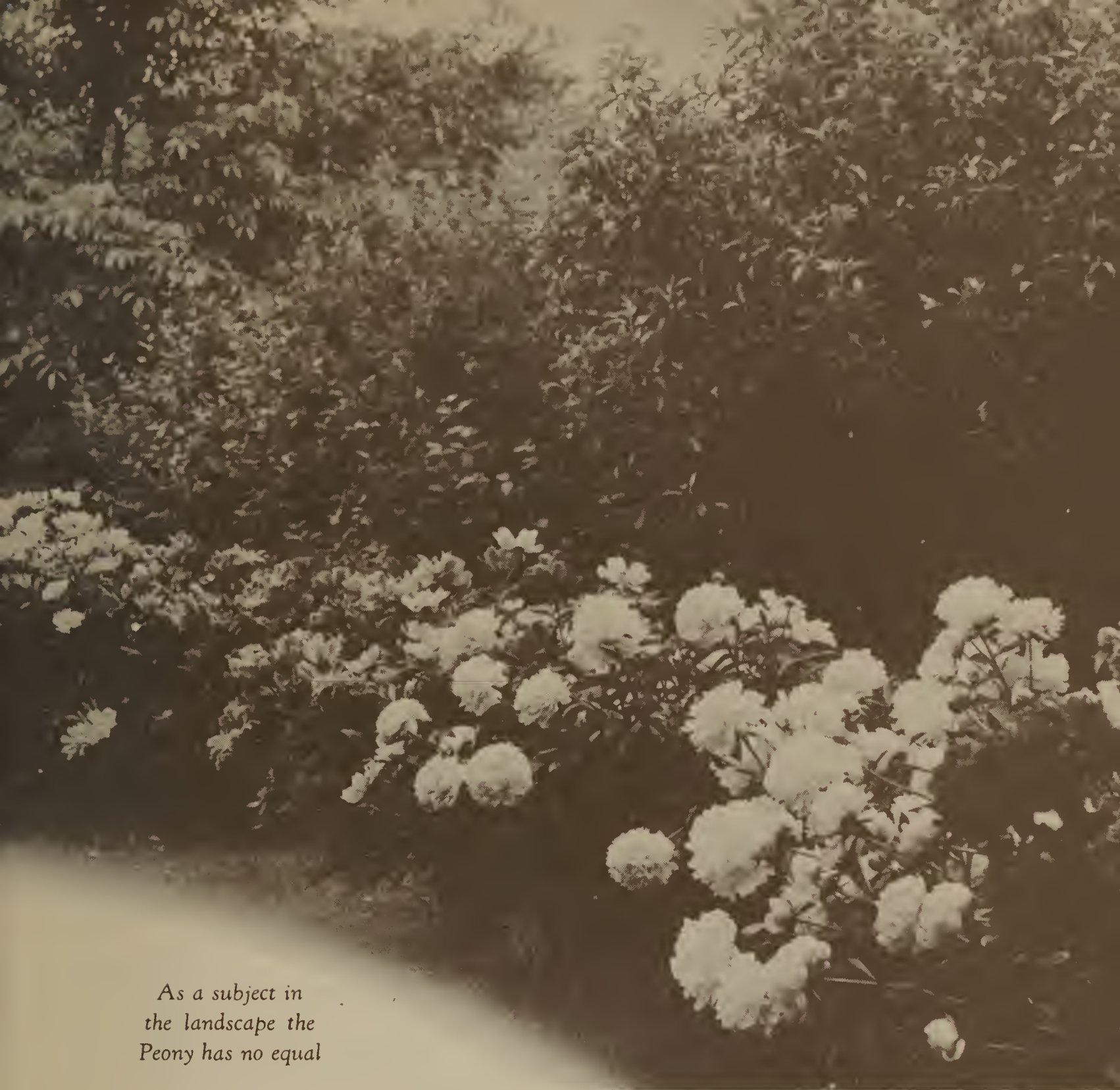
As a subject in the landscape the Peony has no equal