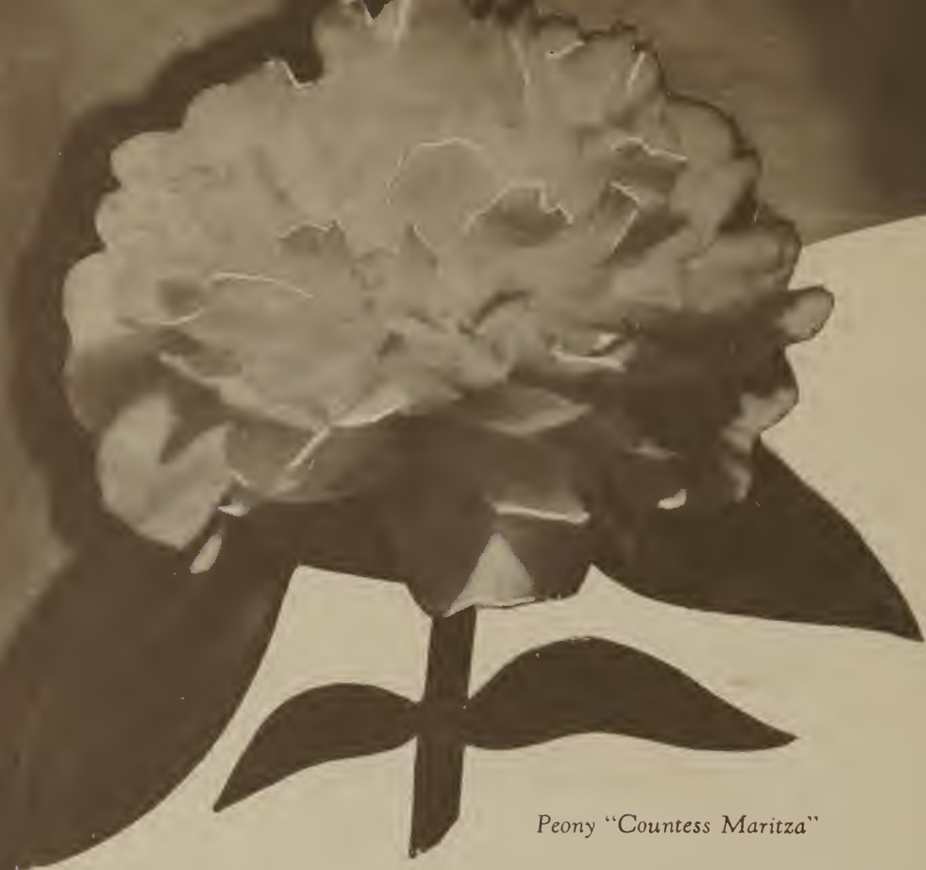
Peony "Countess Maritza"