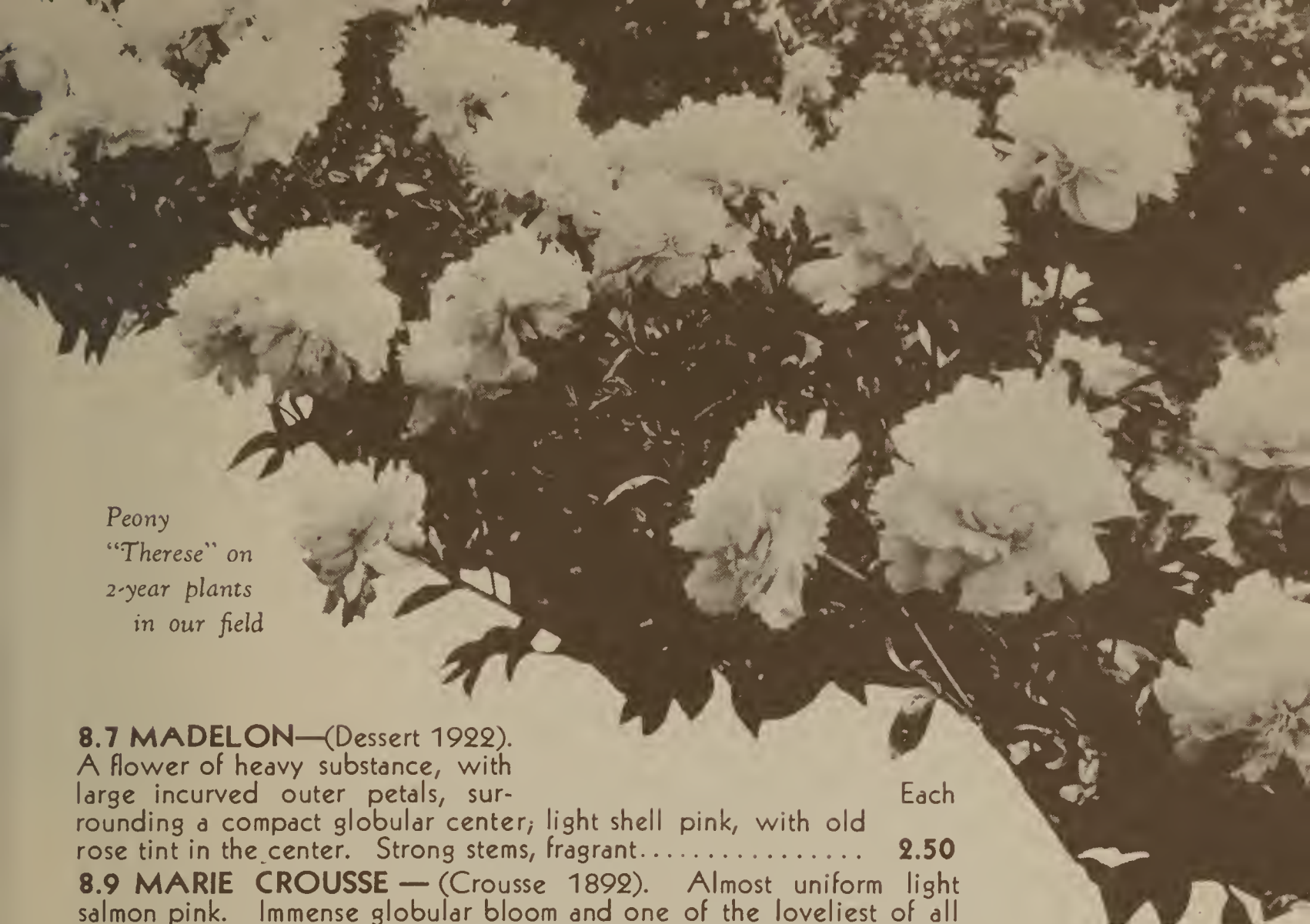
Peony "Therese" on 2-year plants in our field