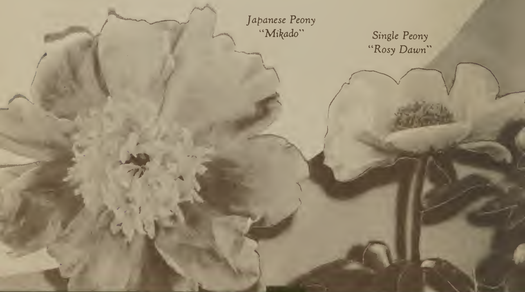
Japanese Peony "Mikado"