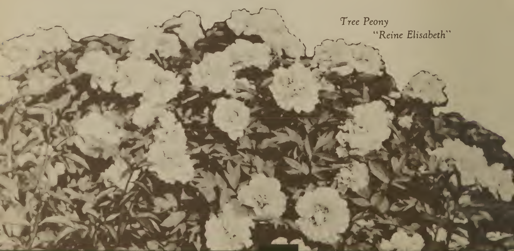
Tree Peony "Reine Elisabeth"