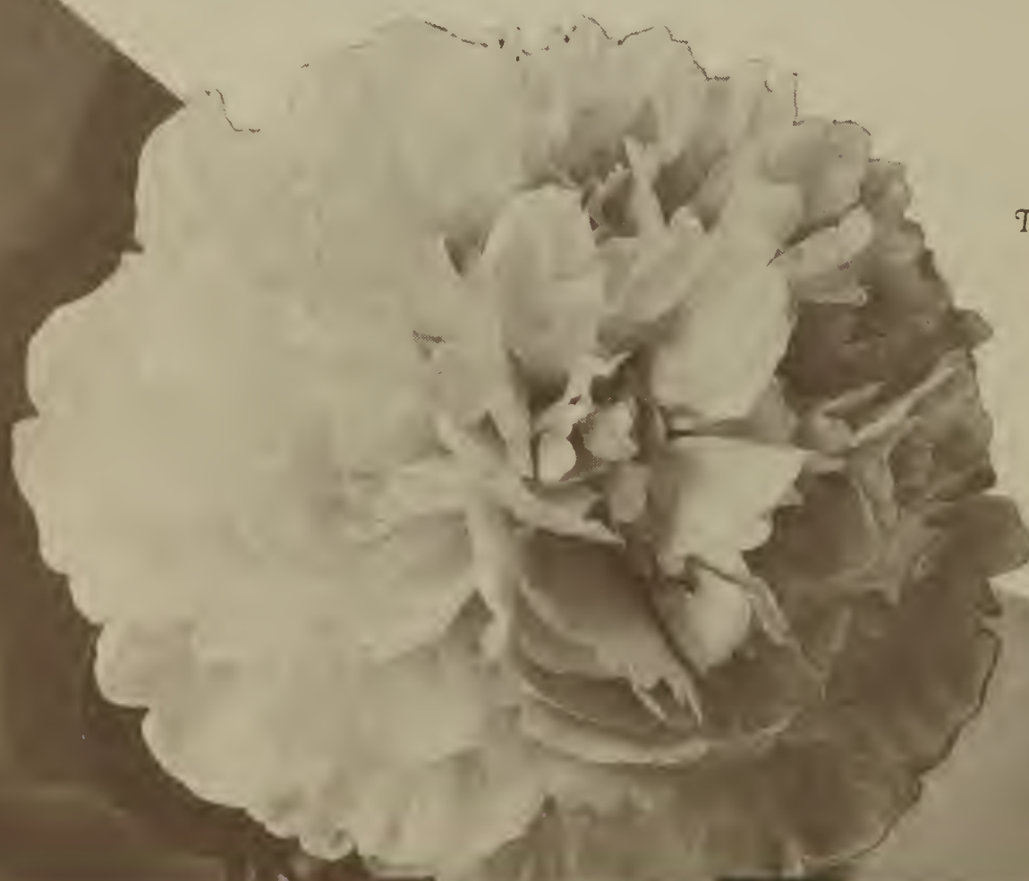
The exquisite light pink Peony "Reine Hortense" (Syn. Pres. Taft)