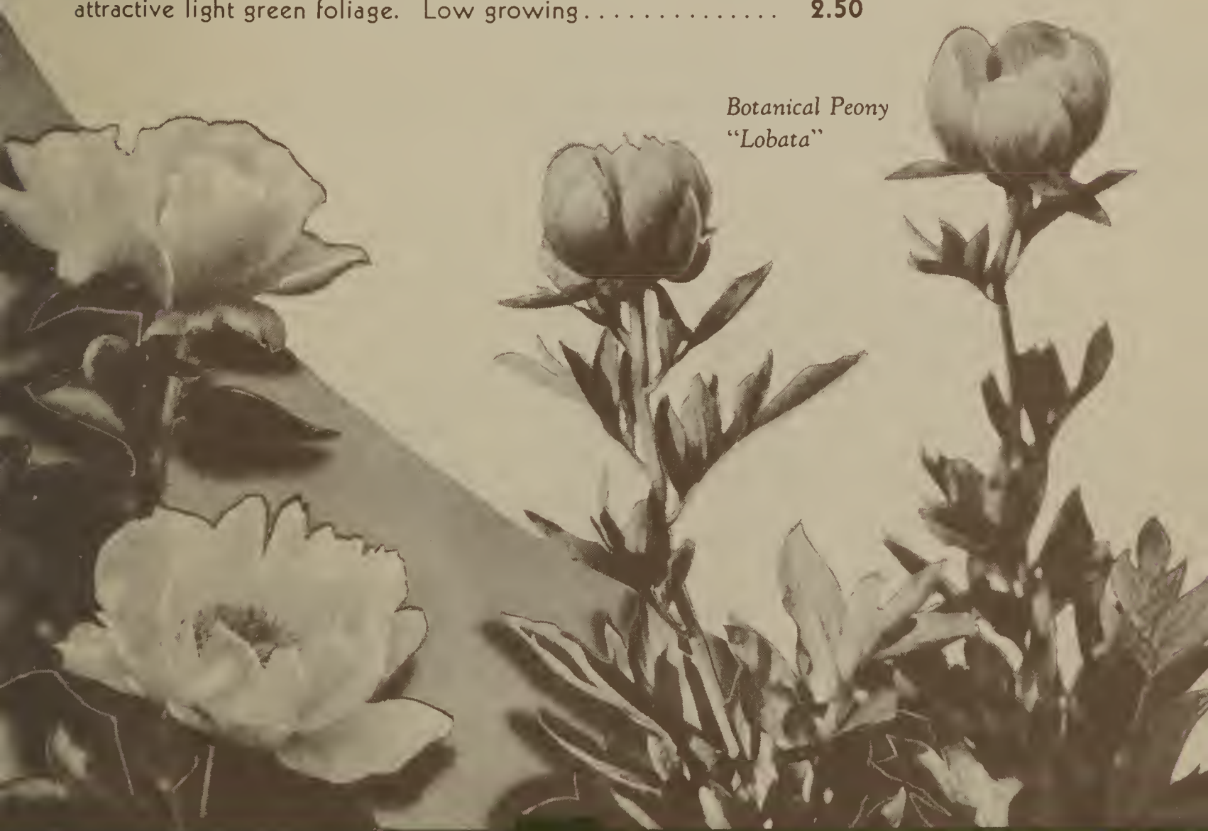
Botanical Peony "Lobata"