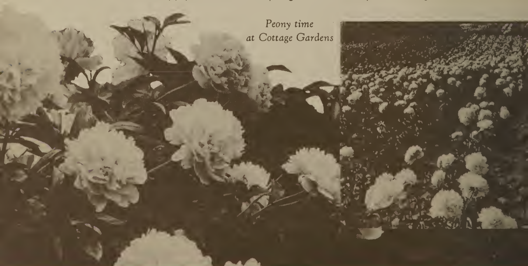
Peony time at Cottage Gardens

SHIPPING TIME —We start shipping Peonies Sept. 1st, and continue until the ground freezes. We can also supply Peonies in the spring from our Peony Root storage.