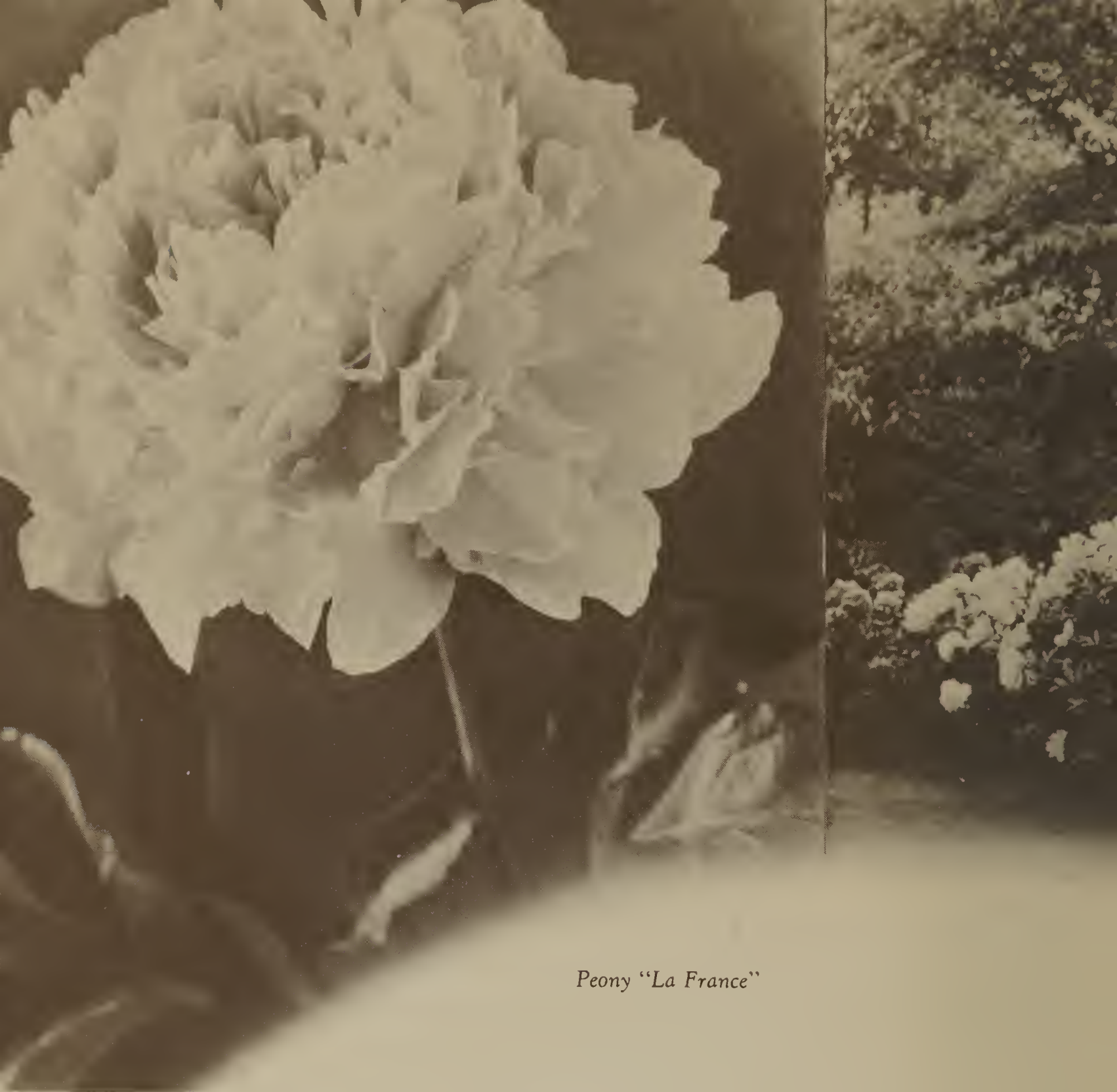
Peony "La France"