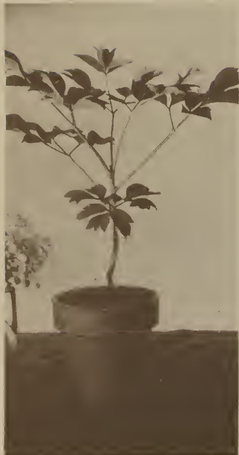
Tree Peony in 5-inch pot

Generally speaking the Tree Peony differs from the herbaceous Peony in that the stems of the Tree Peony are woody and the plant will attain a height of over 5 feet.