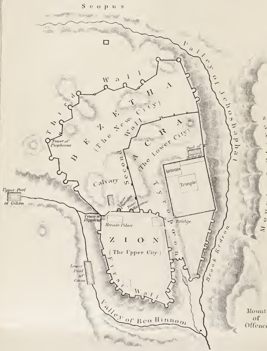
Sketch of the PLAN of ANCIENT JERUSALEM