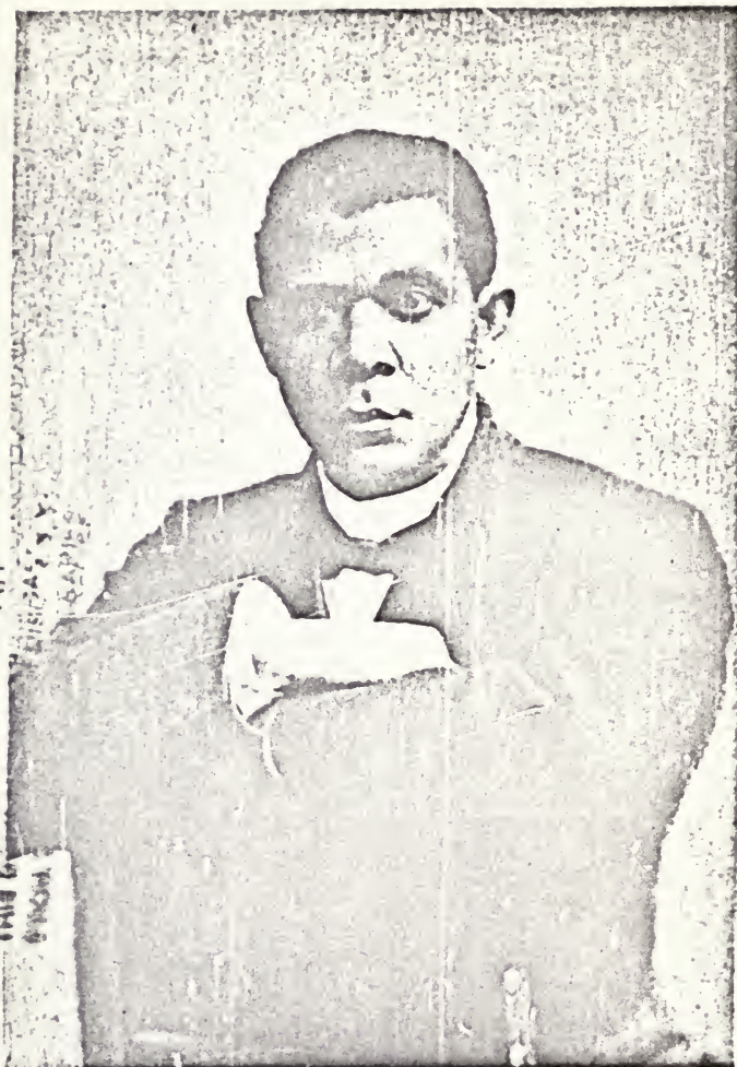
Booker T. Washington.

THE UNIVERSITY OF THE STATE OF NEW YORK DIVISION OF LIBRARY EDUCATION ALBANY, N. Y. 1914