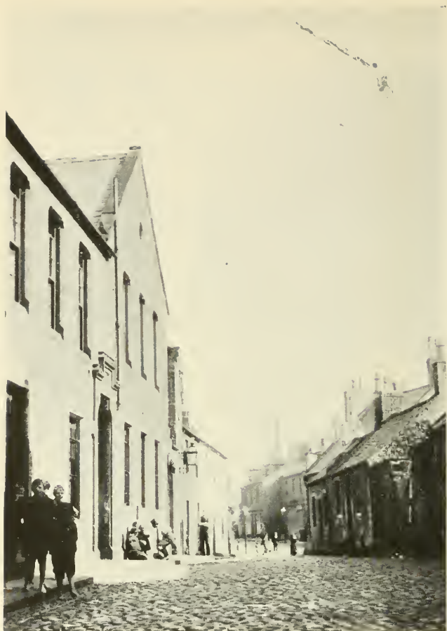
THE STREET ON WHICH BURNS DIED IN DUMFRIES, NOW CALLED BURNS STREET