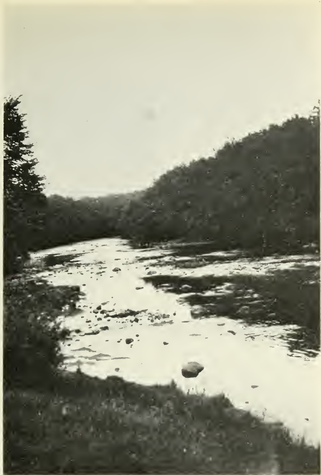
"AYR RINS WIMPLIN TO THE SEA."