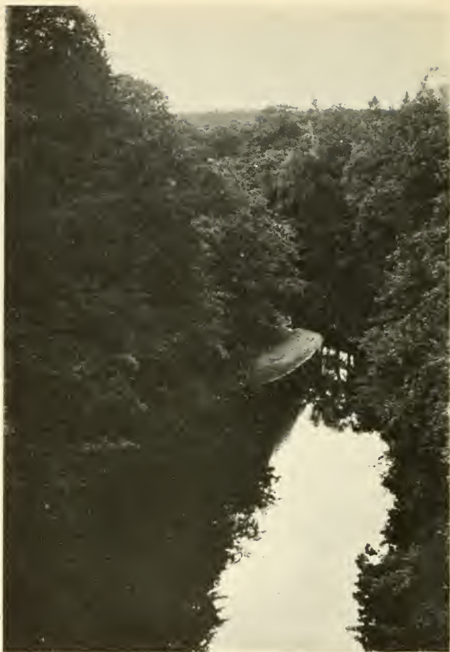
THE AYR AT BALLOCHMYLE ESTATE.