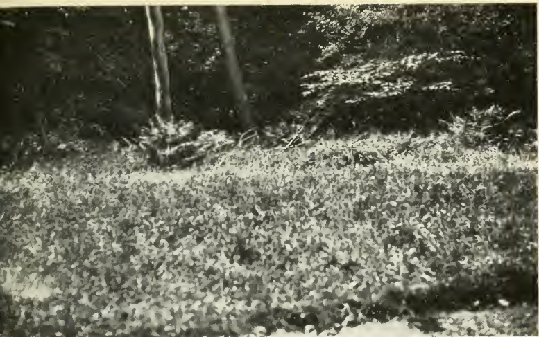
TAKEN IN FRIAR'S CARSE GROVE, NEAR ELLISLAND.

"Their groves of green myrtle let foreign lands reckon Far dearer to me yon lone glow o' green bracken."