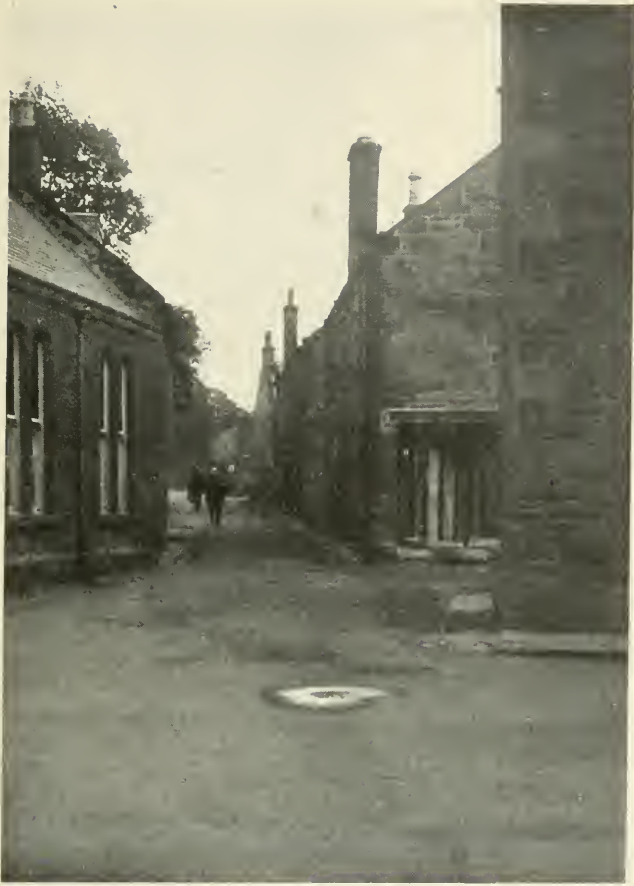
THE "COWGATE STREET," MAUCHLINE.

Jean Armour's birthplace and home was the first house on the right, now being made into a business place.