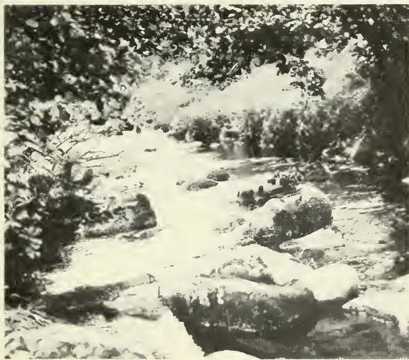
THE BANNOCK BURN.