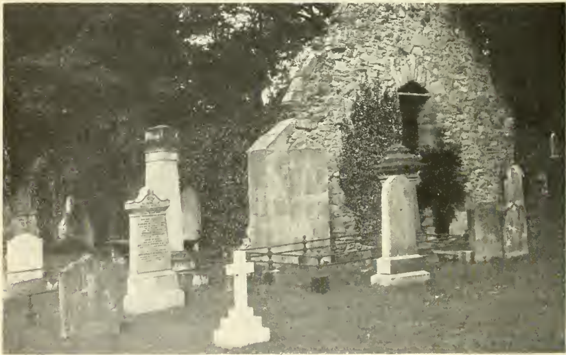
THE WEST END OF ALLOWAY KIRK.

Showing "A winnock bunker in the east," where Auld Nick sat playing music for the dancing witches that stirred the enthusiasm of Tam O' Shanter. "Winnock bunker" means window seat.