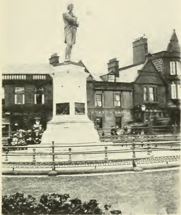
THE STATUE OF BURNS, AYR.