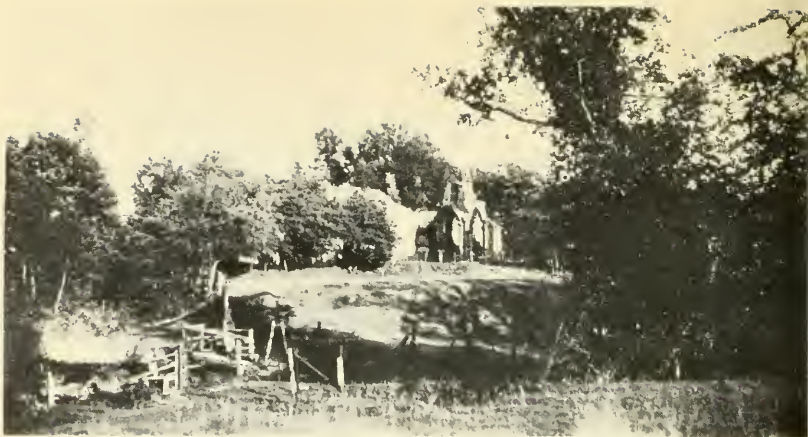
LINCLUDEN ABBEY FROM A DISTANCE.

The ruins are close to Dumfries. The roofless tower is seen at the left of the picture.