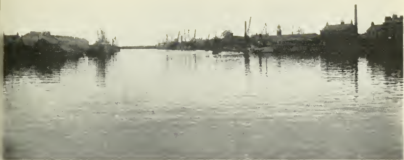
THE AYR RIVER IN AYR, NEAR THE CLYDE.