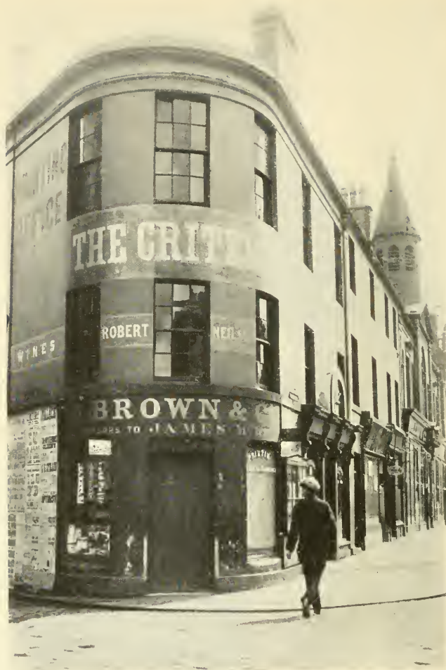
THE OFFICE, ON TOP FLOOR, WHERE THE "KILMARNOCK EDITION" OF POEMS OF BURNS WAS PUBLISHED.