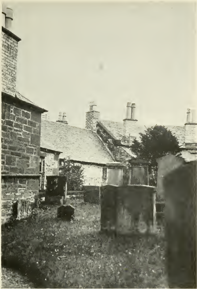
THE REAR OF MAUCLINE KIRK-YARD.