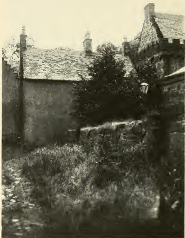
GAVIN HAMILTON'S HOUSE, MAUCLINE.

In which Burns and Jean Armour were married. It is close to Mauchline Kirk, about fifty yards from Jean's birthplace, and close to her first home with Burns.