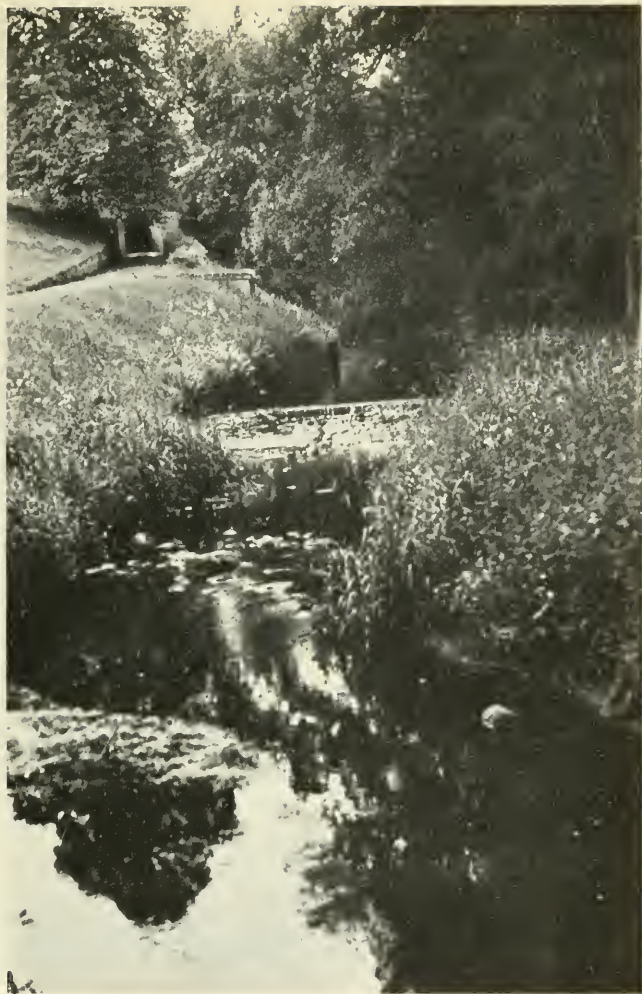
THE FAILE IN MONTGOMERY CASTLE GROUNDS.

Near the tree where Burns carved Mary Campbell's name and his own on the day of their final parting