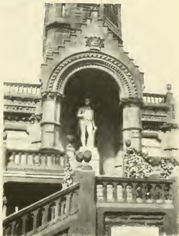
THE LOWER PART OF THE MONUMENT TO BURNS IN KILMARNOCK.

The finest monument to Burns in Scotland.