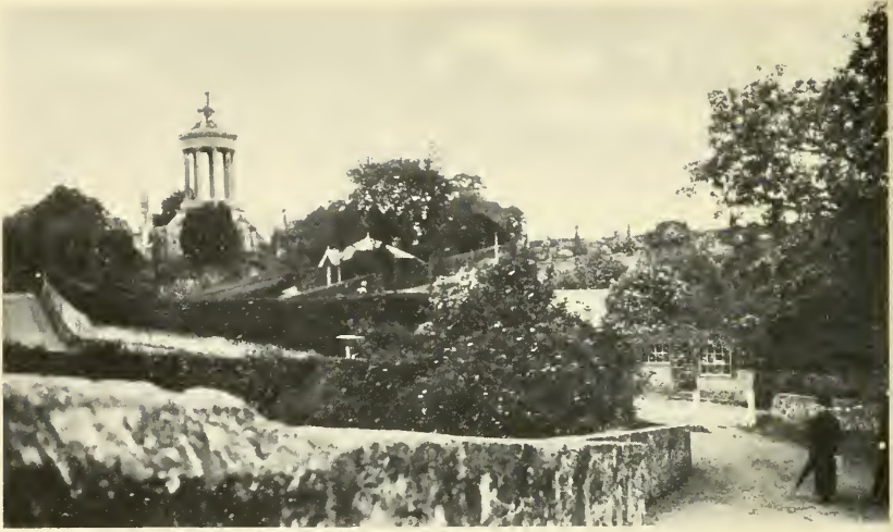
THE MONUMENT TO BURNS IN ALLOWAY.

In the Museum under the monument are many interesting relics, among them the Bible presented to Mary Campbell (Highland Mary), and which she and Burns held, one standing on one side of the Faile, and the other on the other side, when they made their Vows of Marriage on Sunday, May 14, 1786.