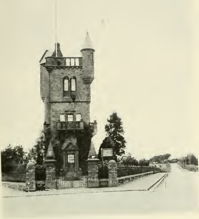
THE NATIONAL MONUMENT TO BURNS.

A mile from Mauchline, half way between Mossgiel and Mauchline.