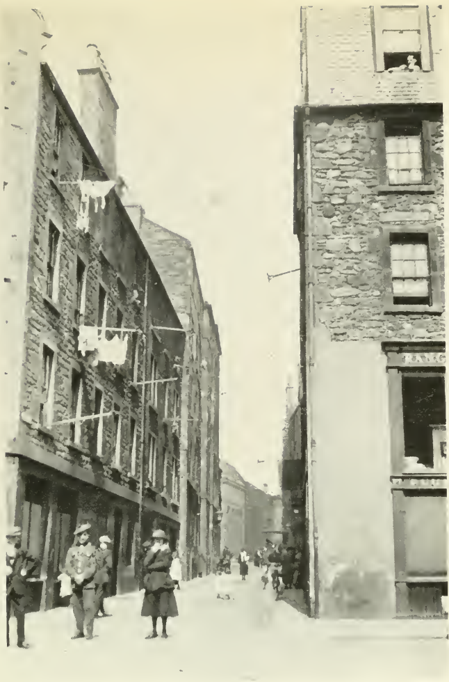
BUTTER ROW, EDINBURGH.

On which Clarinda lived, while Burns was in Edinburgh.