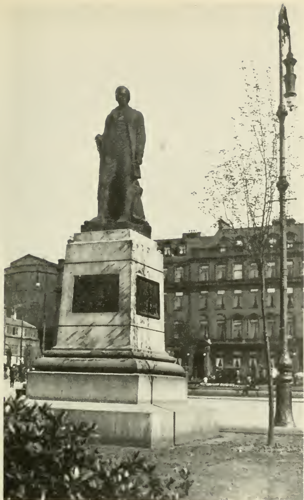
URNS STATUE IN GLASGOW.