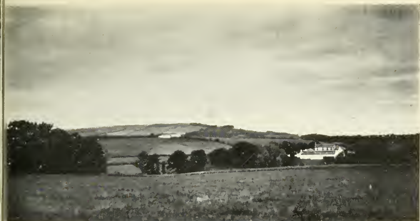
THE VIEW ACROSS THE CARRICK BORDER.

Seen from Mt. Oliphant farm. This picture is typical of the beauty of Carrick district of Ayrshire, of which district Maybole is the Capital.