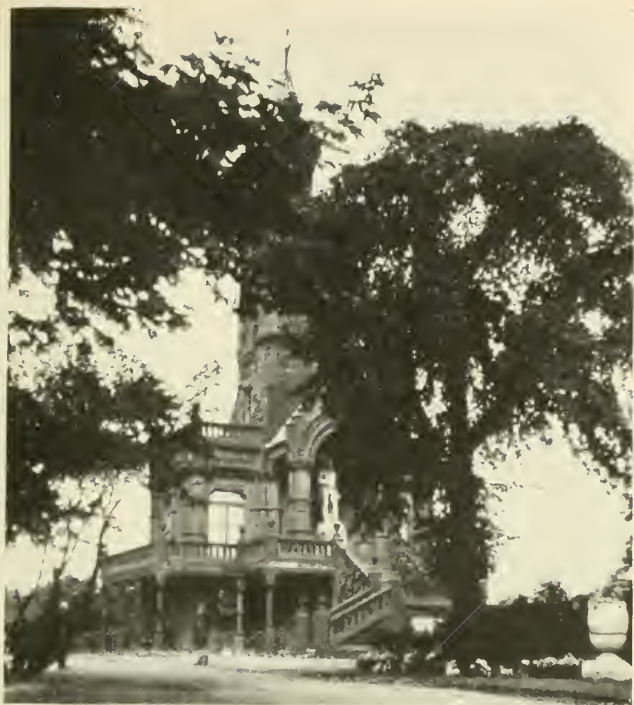
THE BURNS MONUMENT IN KILMARNOCK.

The finest monument to Burns in Scotland.