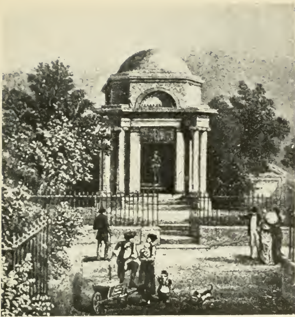
GREEK TEMPLE OVER THE GRAVE OF BURNS IN DUMFRIES.

"There's a road through the field of crowded graves—a road that leads from all the continents, all the towns—the moving feet of millions have trod it as holy ground; and men walk bare-headed and are silent as they seek the poet's grave. No King of all the world wins that remembrance. The temples and palaces of Babylon and Egypt have not that reverence. That track worn by the feet of pilgrims out of all the earth is the final answer of the world to the plea of Robert Burns."