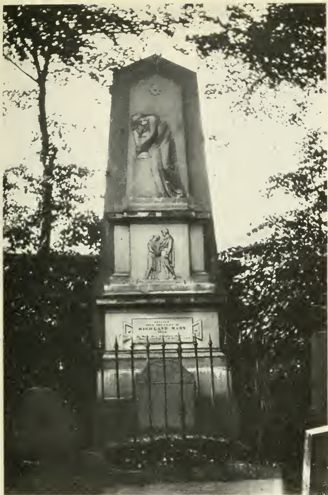
HIGHLAND MARY'S MONUMENT, GREENOCK.

The Kirkyard was sold near the close of 1919 to a shipbuilding company, but the British Parliament passed an act preserving "Highland Mary's" grave from desecration.