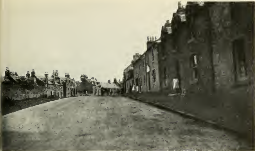
THE MAIN STREET IN KIRKOSWALD.