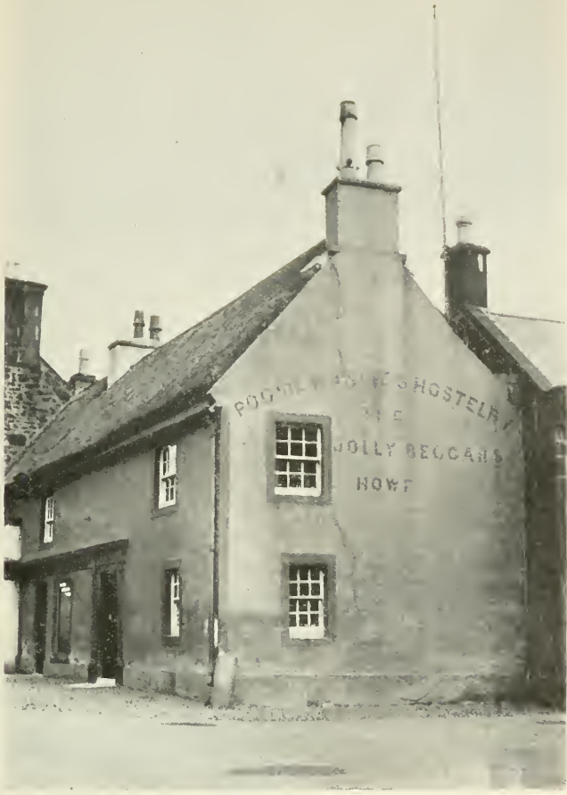
POOSIE NANSIE'S INN.

In which the "Jolly Beggars" caroused on Saturday nights.