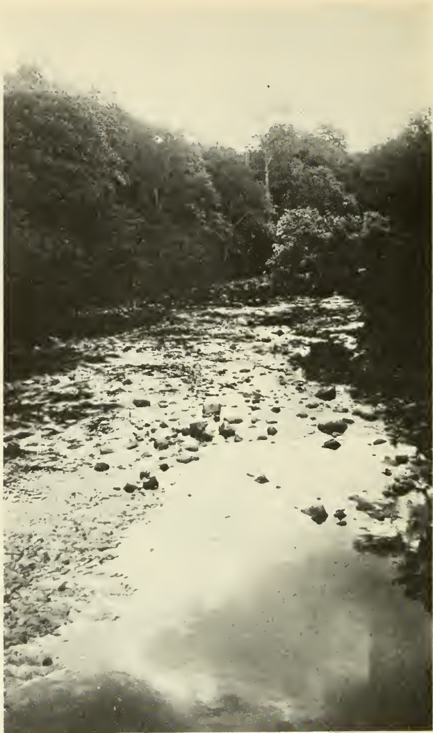
THE AYR RIVER NEAR HAUGH CLOSE TO BARSKIMMING.

Where Burns walked when he composed "Man Was Made to Mourn" in one evening.