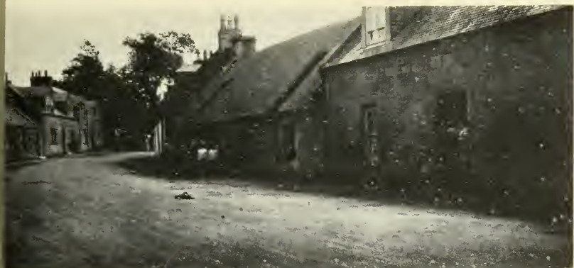
THE SHOP OF SOUTER JOHNNIE (Shoemaker Johnnie).