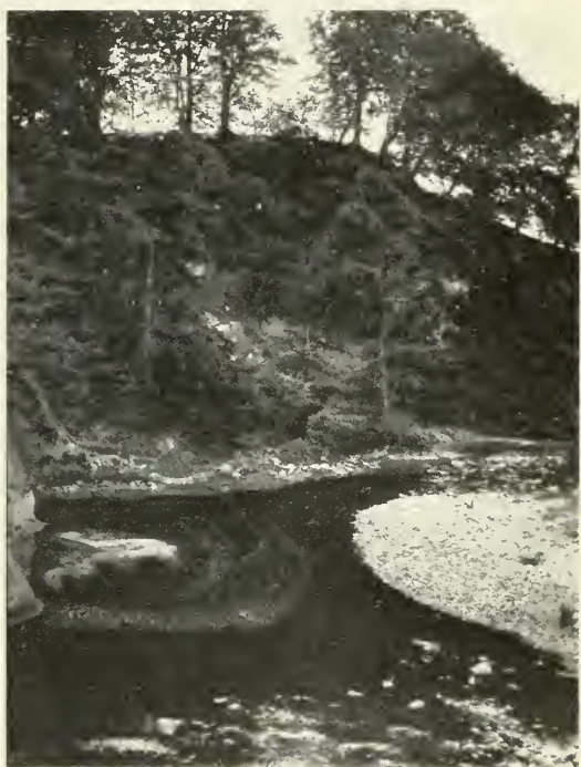
THE AYR NEAR BARSKIMMING.