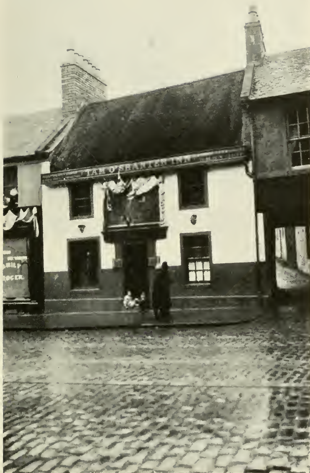
THE TAM O' SHANTER INN, AYR.