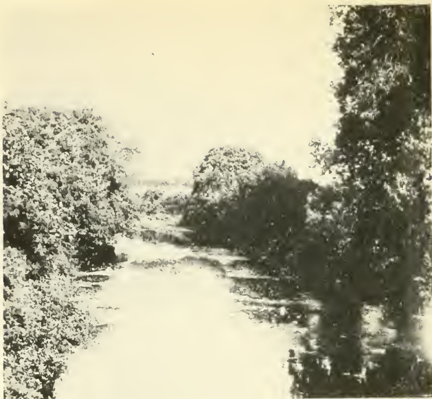
THE NITH RIVER AT LINCLUDEN ABBEY.

Flowing around the promontory on which the ruins of Lincluden Abbey stand "The burn adown its hazelly path, Was rushing by the ruined wa', Hasting to join the sweeping Nith, Whose roarings seem'd to rise and fa'."