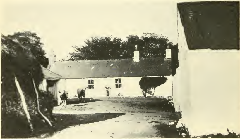
THE FARM HOME OF BURNS AT ELLISLAND.

And the farms nearer to Dumfries. A hundred yards behind, where the house stands, Burns wrote "Tam O' Shanter"—beyond the trees on the Nith.