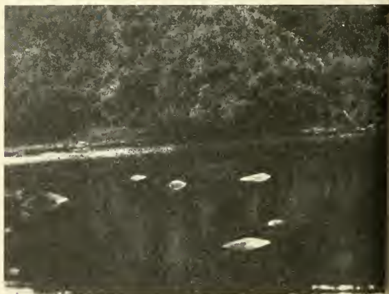
A QUIET PLACE IN LOCH-TURIT.