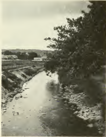
E IRWINE RIVER AT KILMARNOCK.