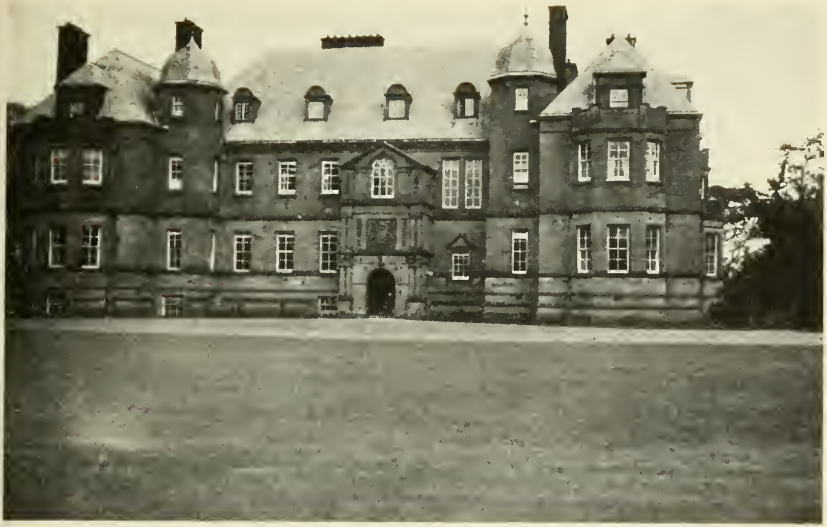
BALLOCHMYLE HOUSE, A MILE FROM MAUHLINE.