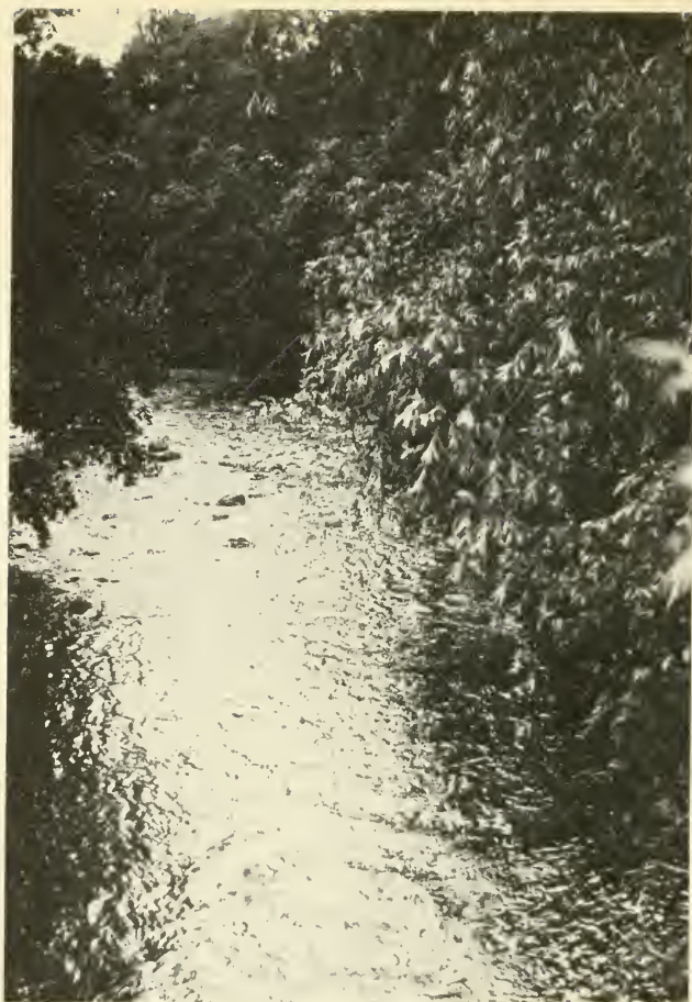
THE FAILE RIVER IMMEDIATELY BEHIND MONTGOMERY CASTLE.