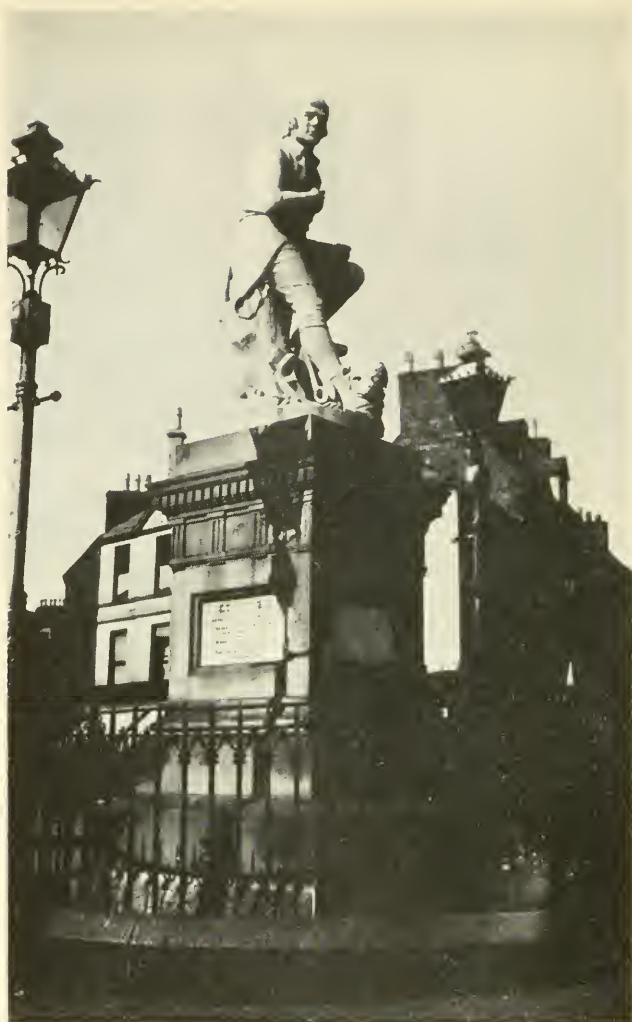
BURNS STATUE, DUMFRIES.