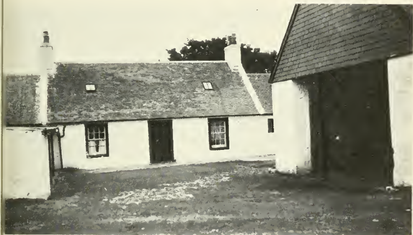
MT. OLIPHANT FARM BUILDINGS.

Seen from Mt. Oliphant farm. This picture is typical of the beauty of Carrick district of Ayrshire, of which district Maybole is the Capital.