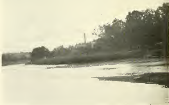
THE NITH AT DUMFRIES.