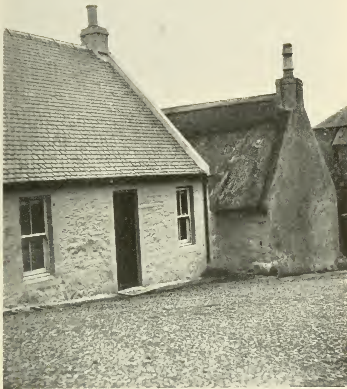
THE MASONIC LODGE-ROOM, WHERE BURNS WAS MASTER, IN TARBOLTON.

The house on the left was the Masonic Lodge-room, where Burns was master in Tarbolton. The house on the right is the one in which he learned to dance. He was initiated in St. David's Lodge, but after a time he and other members seceded and established St. James Lodge in this house.