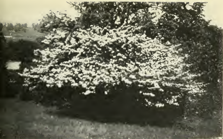
"MILKWHITE THORN" ON THE NITH.