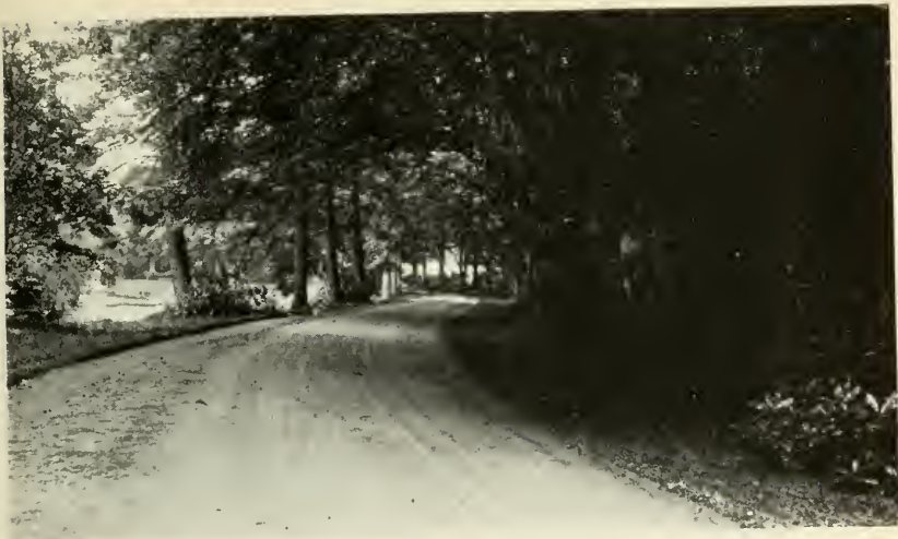
A VIEW OF BALLOCHMYLE DRIVE.