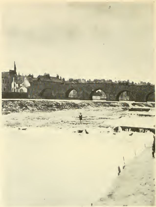
THE NITH NEAR DUMFRIES.