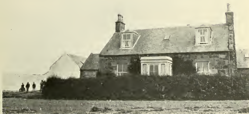
THE SHANTER FARM.

Fourteen miles from Ayr, on the Firth of Clyde, and about three miles from Kirkoswald, where Tam is buried.