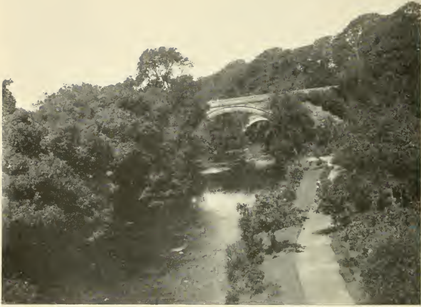
THE "NEW BRIG" O' DOON FROM THE AULD BRIG.