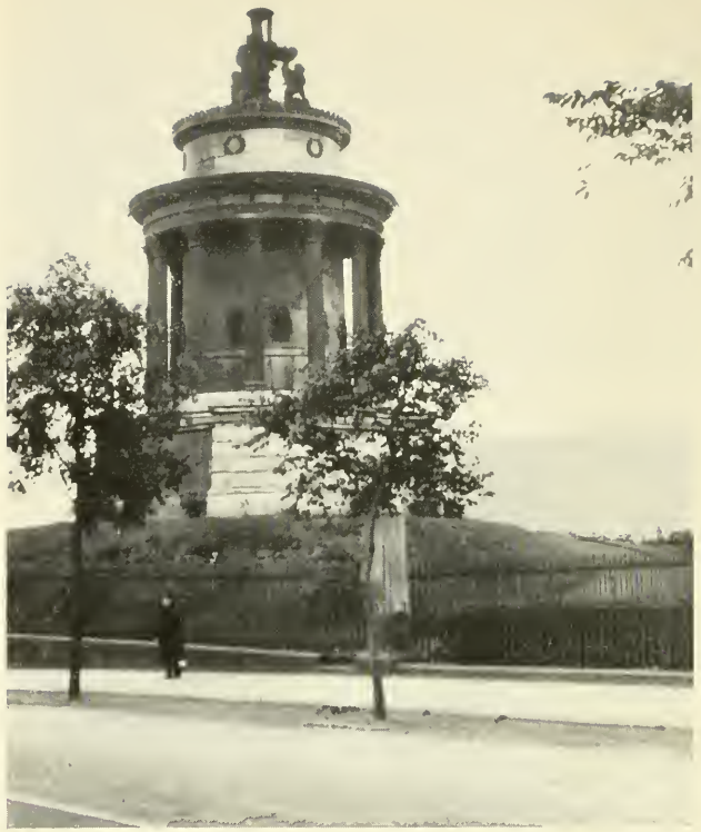
BURNS MONUMENT, EDINBURGH, ON CALTON HILL.