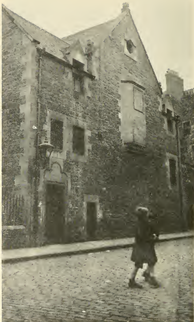
ST. JOHN'S MASONIC LODGE ROOM IN EDINBURGH.