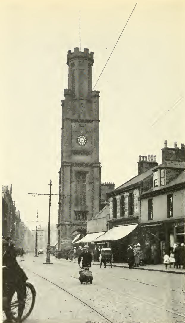
THE WALLACE MONUMENT IN AYR.

Referred to in "The Brigs of Ayr," erected in honor of Sir William Wallace, Scotland's great patriot; "Scots wha hae wi' Wallace bled."