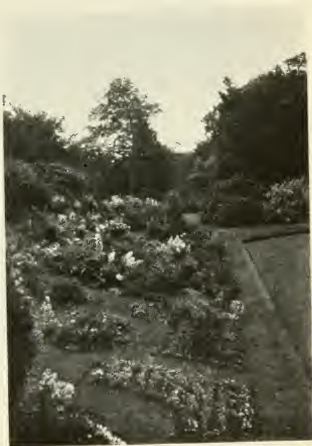
BARSKIMMING ESTATE IS ON THE AYR NEXT TO BALLOCHMYLE.

In Burns' time it was owned by Sir Thomas Miller, President of the Court of Sessions, of whom Burns wrote in "The Vision." The picture represents a small portion of the garden on Barskimming estate.