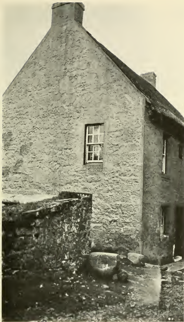
BURNS' BACHELORS' CLUB ROOM IN TARBOLTON.

Burns had a debating society in Tarbolton, in Kirkoswald, and in Mauchline, to develop his varied powers. The upper room in this picture was his Bachelors' Club Room in Tarbolton.