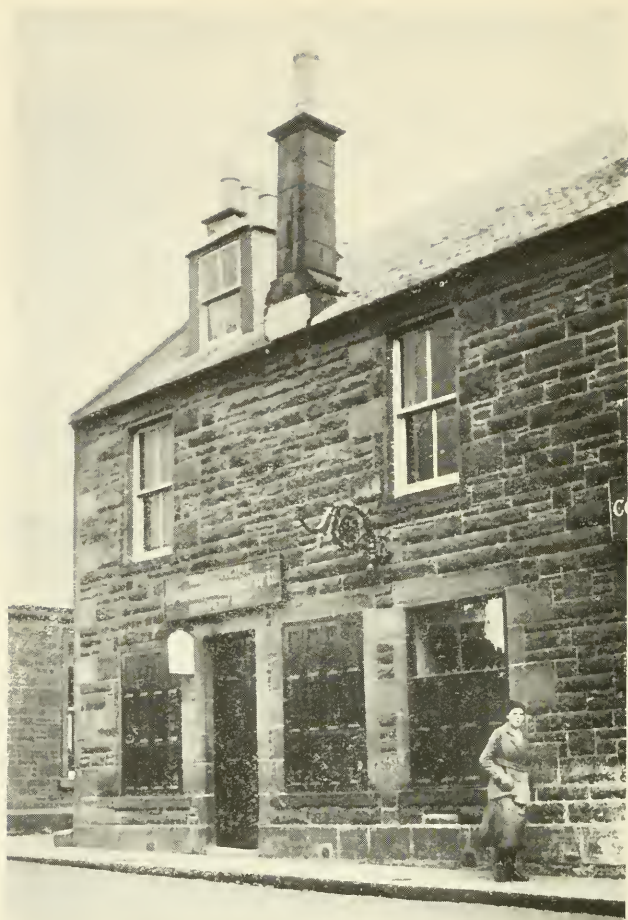
THE WHITEFORD ARMS, MAUCLINE.

Jean Armour's birthplace was the first house around the corner on Cowgate Street. The Bachelors' Club and Debating Society of Burns in Mauchline was held in the Whiteford Arms. This building was erected since the time of Burns.