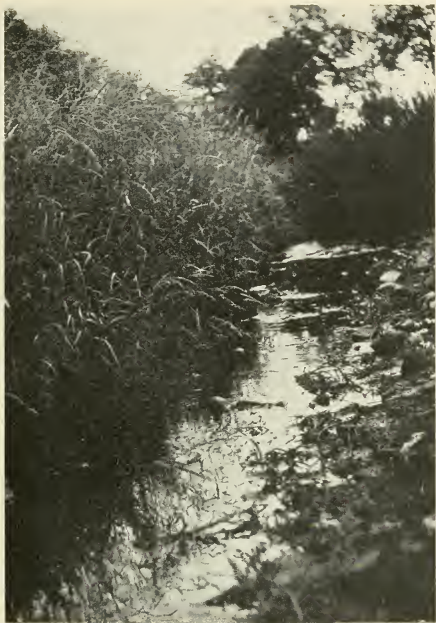
THE FAILE RIVER AT "WILLIE'S MILL."

About a mile from Montgomery Castle grounds through which it flows.