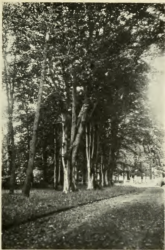
VIEW OF BALLOCHMYLE DRIVE.