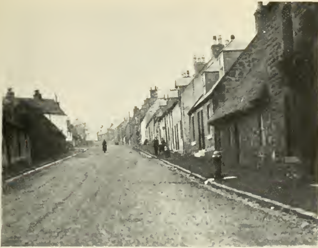
HILTREE ON THE LUGAR.