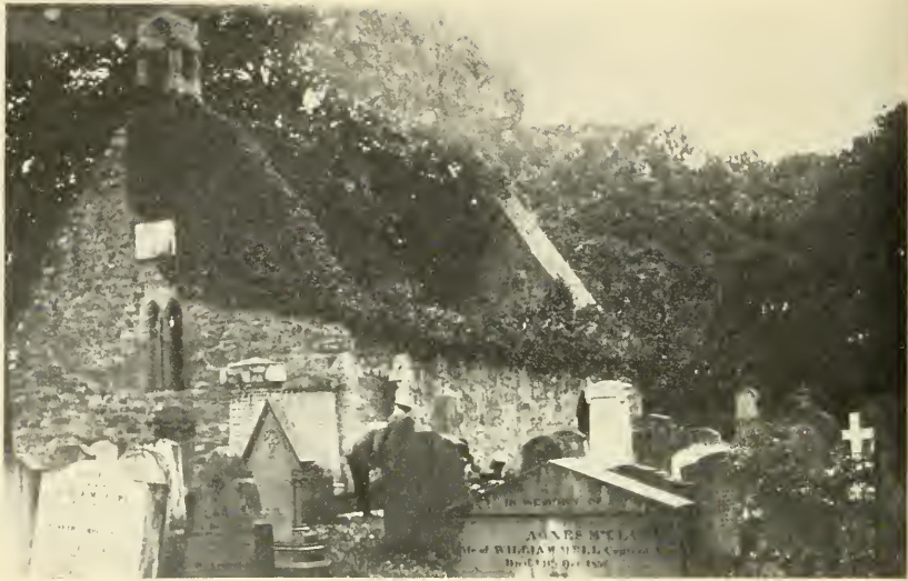
THE RUINS OF ALLOWAY KIRK.

Showing "A winnock bunker in the east," where Auld Nick sat playing music for the dancing witches that stirred the enthusiasm of Tam O' Shanter. "Winnock bunker" means window seat.