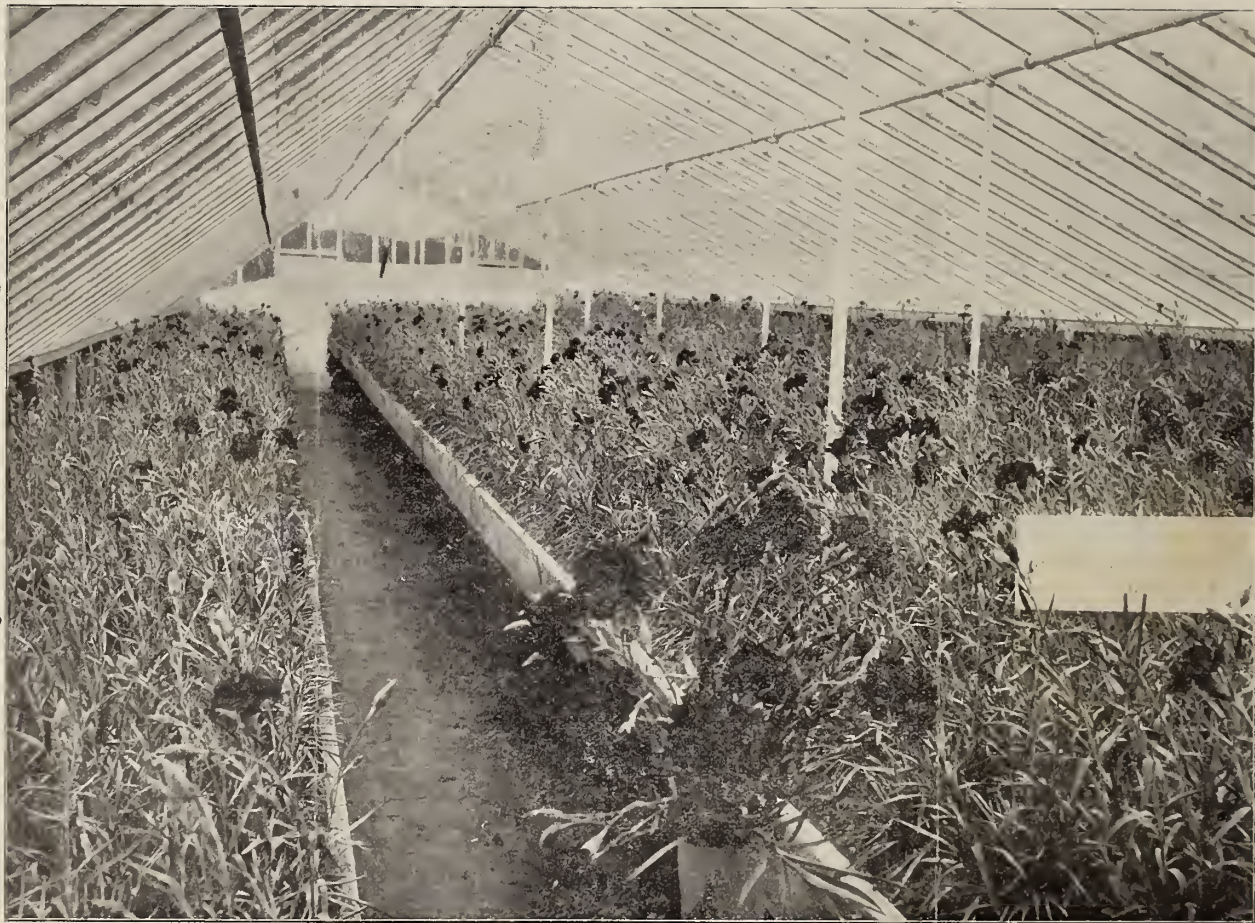
THE ABOVE HOUSE WAS TAKEN OCTOBER 10.