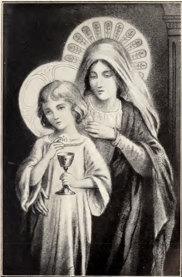
Our Lady of the Most Blessed Sacrament, Pray for us.