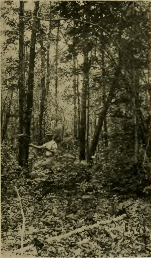
LARGE HARDWOODS. (Colored Dark Orange on Map.)