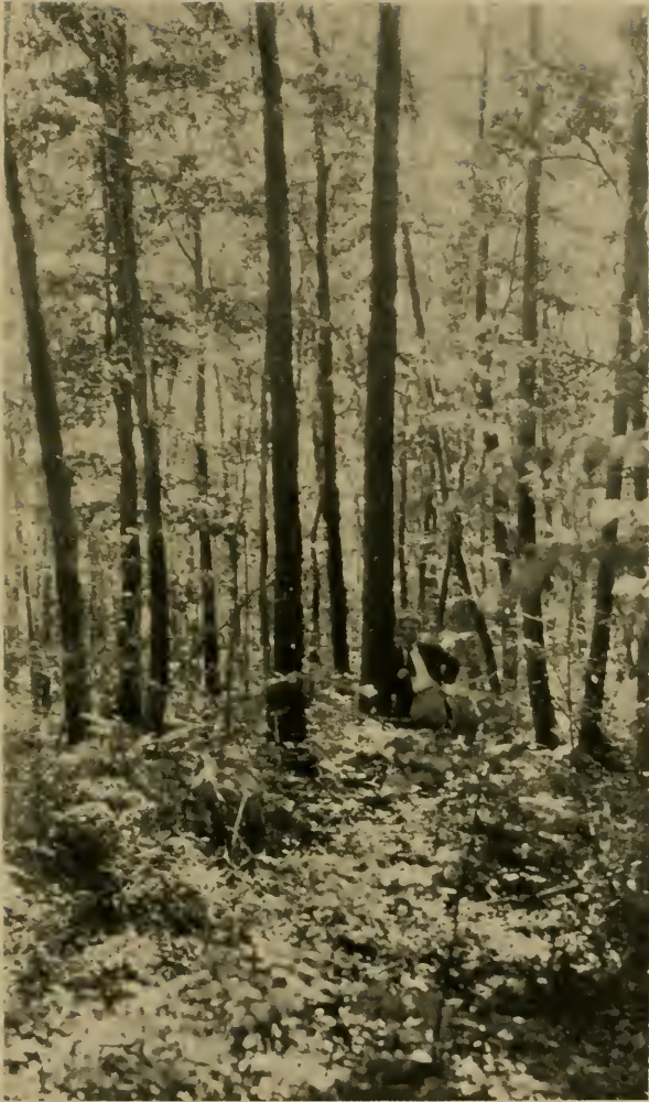
LARGE CHESTNUT GROWTH. (Colored Dark Orange on Map.)