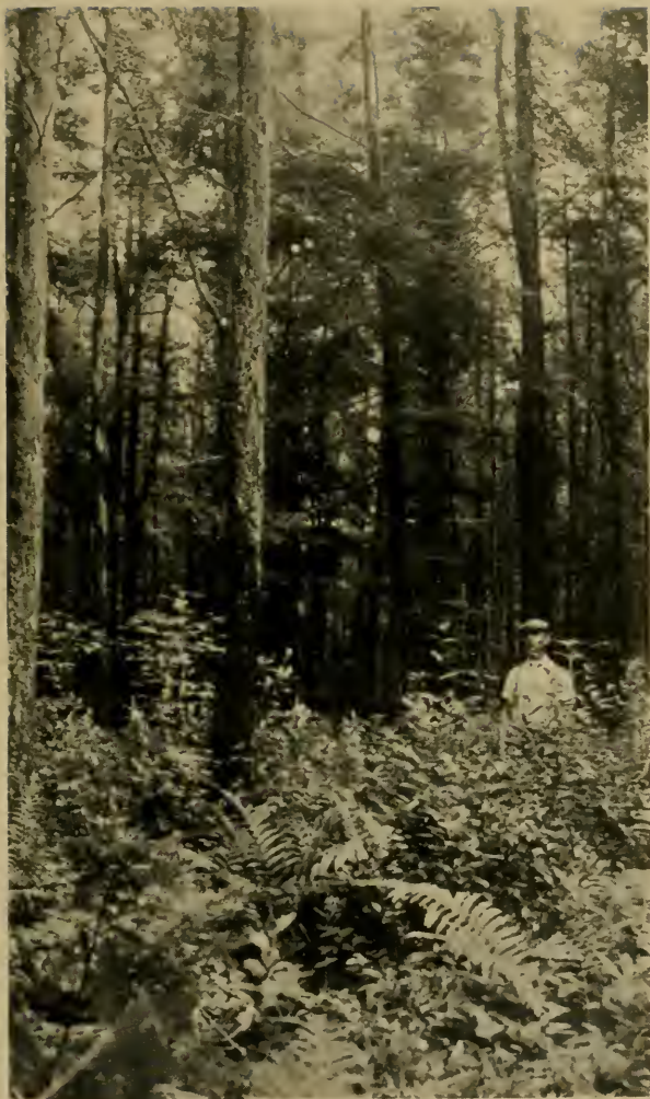
LARGE CEDAR SWAMP.