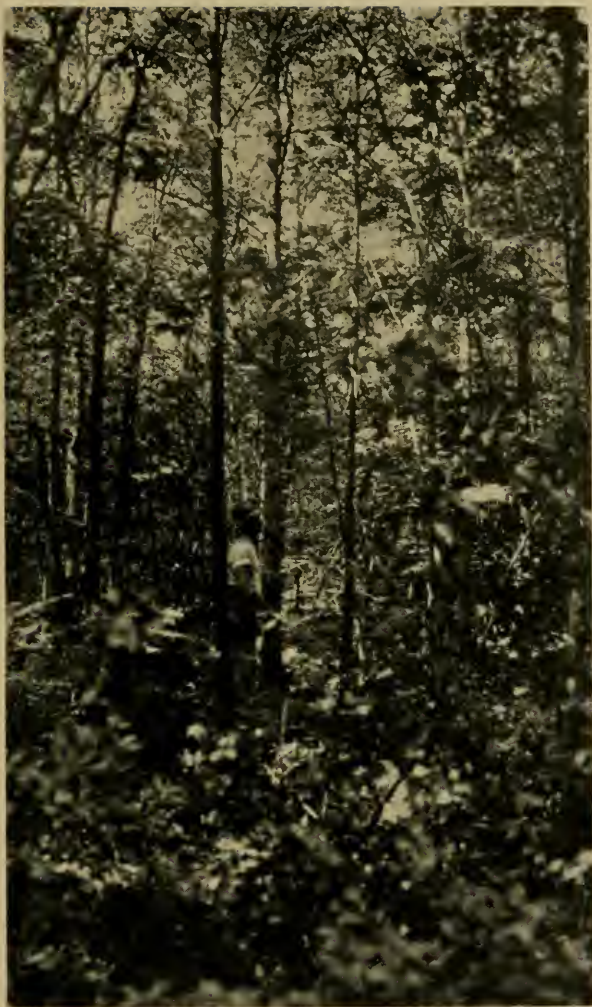
MEDIUM HARDWOOD GROWTH.