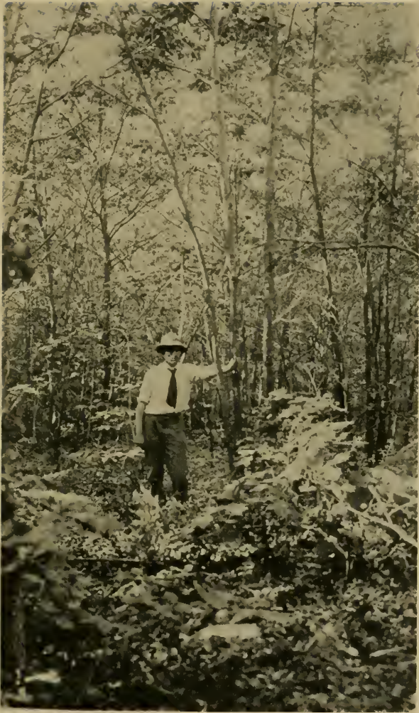
SMALL HARDWOODS. (Colored Yellow on Map.)