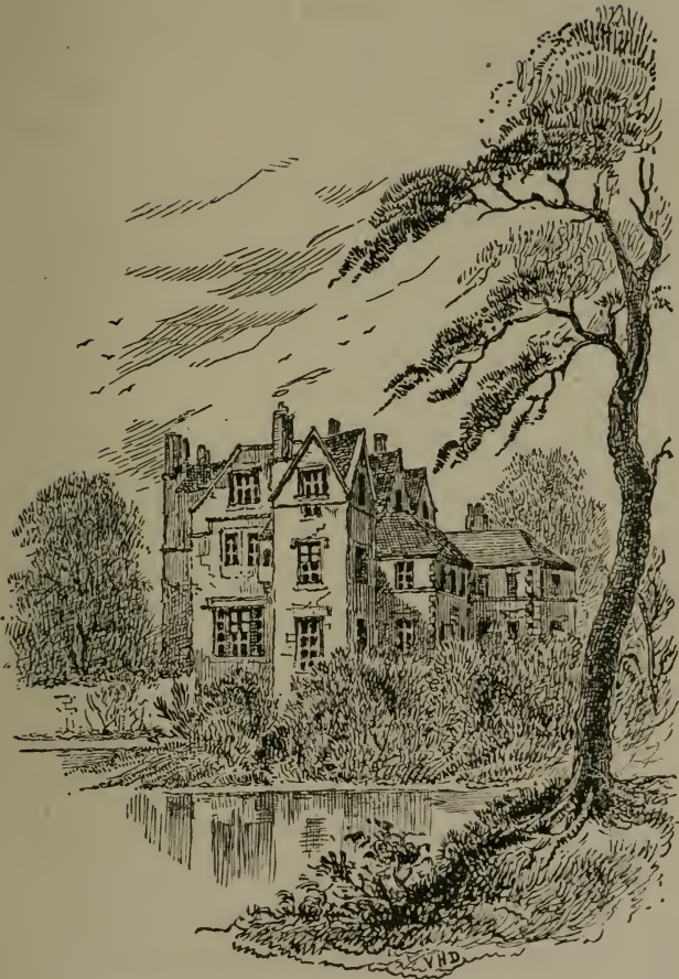
BREADSALL PRIORY, WHERE ERASMUS DARWIN DIED.