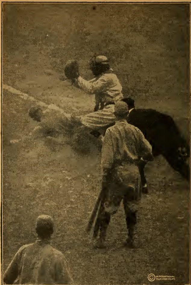
Gardner scoring in second inning of fourth game. Hoblitzel walked and Lewis doubled to right; both men tallied when Gardner drove the ball to the center field fence for a home run.