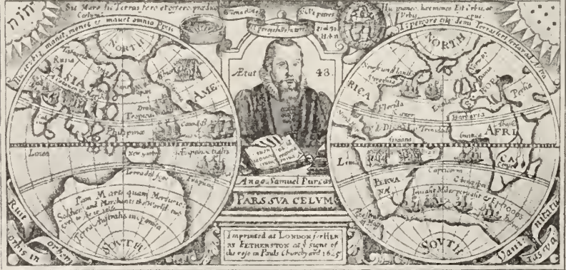
SAMUEL PURCHASE His Pilgrimes, 1625-1626 Reproduction of Engraved Title. [See No. 825]