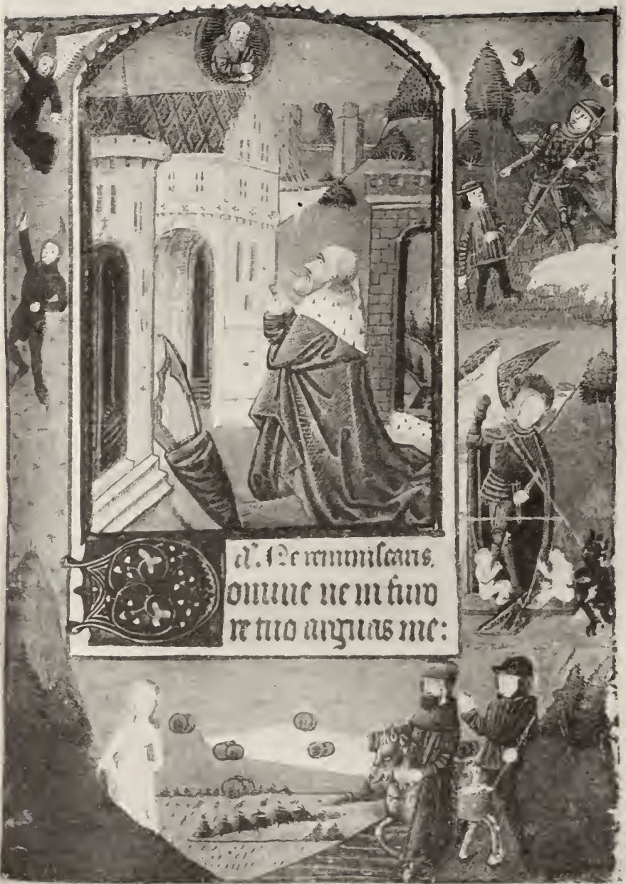
ILLUMINATED MANUSCRIPT Horae Beatæ Mariæ Virginis. Sæc. XV Reproduction of one of the Miniatures. [See No. 902]