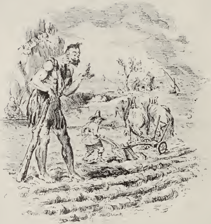
GEORGE CRUIKSHANK The Young Giant and the Tailor Reproduction of an Original Drawing. [See No. 336]