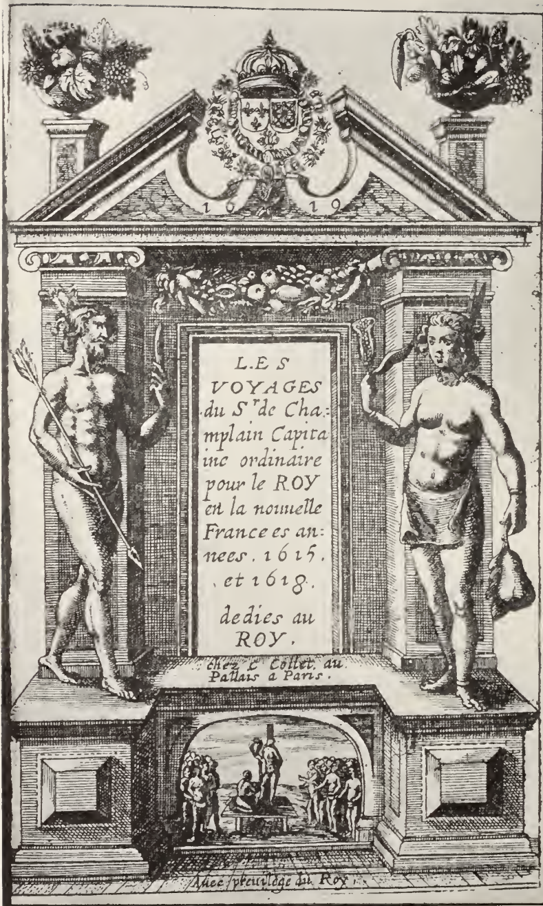
SAMUEL CHAMPLAIN Les Voyages en la Nouvelle France. 1620 Reproduction of Engraved Title. [See No. 246]