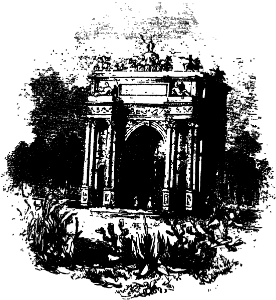
THE TRIUMPHAL ARCH OF MILAN.