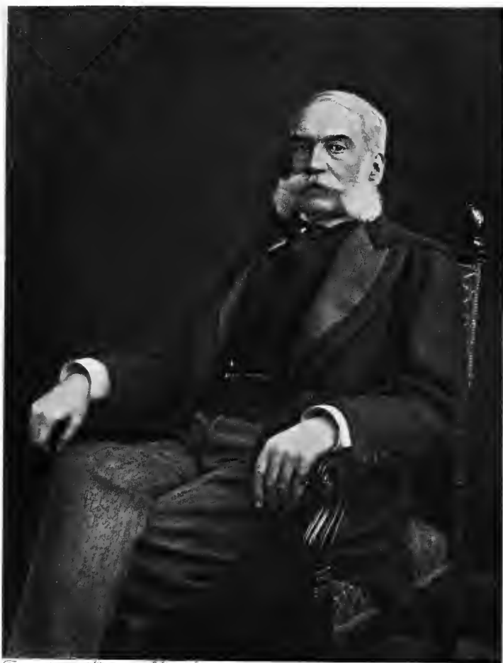
From a photograph Copyright by Homan & Co