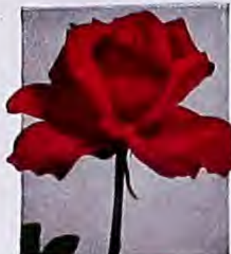
AMI QUINARD. Buds large; velvety maroon-crimson flowers with a blackish luster. Vigorous grower. Best-grade, 2-yr. plants, 40 cts. each, $4 per doz.