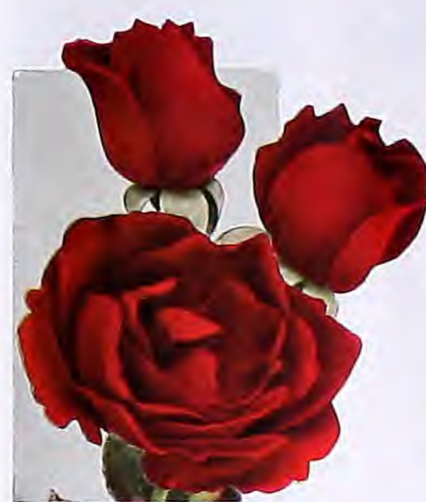
WORLD'S FAIR. Pat. 362 Dark scarlet blooms with golden stamens. Best-grade, 2-yr. plants, $1 each, $2.50 for 3, $10 per doz.