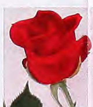
ETOILE DE HOLLANDE. Bright red, almost unfading. Best-grade, 2-yr. plants, 40 cts. each, $4 per doz.