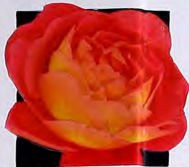
CONDESA DE SASTAGO. A large cupped flower, orange-red inside and yellow on the reverse. Very fragrant. Best-grade, 2-yr. plants, 40 cts. each, $4 per doz.