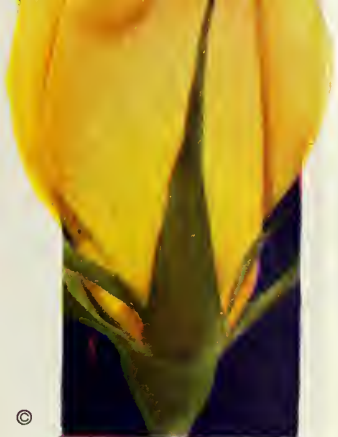
ECLIPSE. Pat. 172

The plants are entirely hardy and Blaze is undoubtedly the leading climbing Rose on the market today. Best-grade, 2-yr. plants, $1 each, $2.50 for 3, $10 per doz.