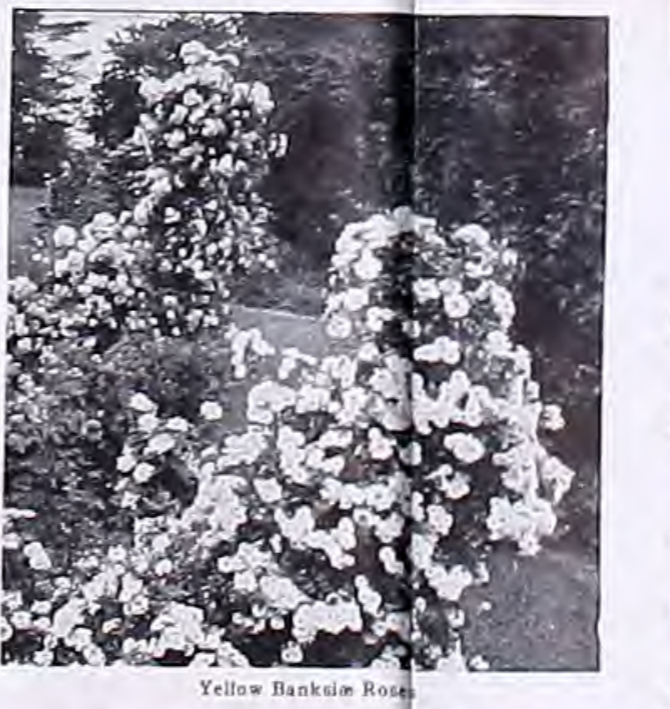
Yellow Bankslae Rose