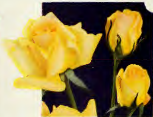
TOPAZ (Golden Sweetheart). Pat. 300

Brick-red marked with gold; center light red toning to pink. Best-grade, 2-yr. plants, 60 cs. each, $1.50 for 3, $6 per doz.