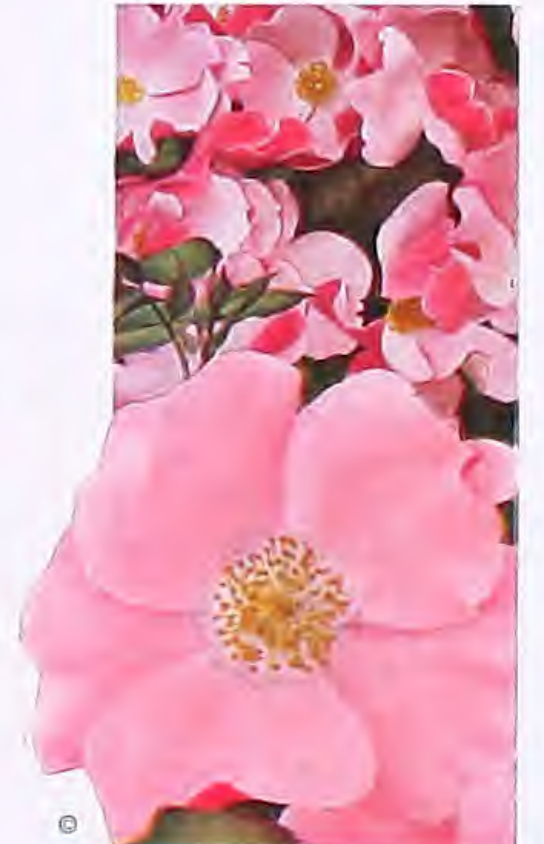
BETTY PRIOR. Pat. 340 Pink. Exquisite single blooms like pink dogwood are borne profusely throughout the season. 85 cts. each, $2.15 for 3, $8.60 per doz.