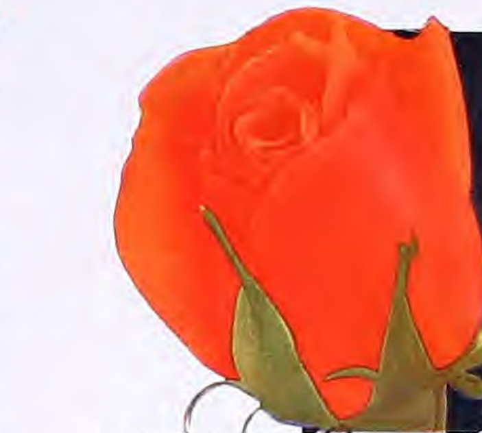
DUQUESA DE PENARANDA. Large, double flowers of brownish apricot with rich fruity fragrance are borne all season on upright plants with heavy attractive foliage. Best-grade, 2-yr. plants, 60 cts. each, $6 per doz.