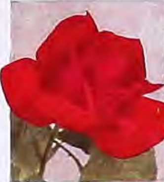
McGREY'S SCARLET. Brilliant scarlet with orange base. Best-grade, 2-yr. plants, 45 cts. each, $4.50 per doz.