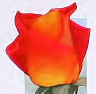
AUTUMN. Gay flowers of burnt-orange, heavily marked with red. Best-grade, 2-yr. plants, 40 cts. each, $4 per doz.