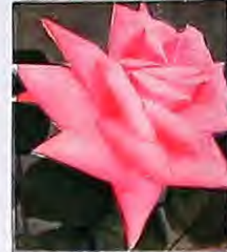
GRACE NOLL CROWELL. Brilliant pink, heavily veined crimson; yellow base. Best-grade, 2-yr. plants, 40 cts. each, $4 per doz.