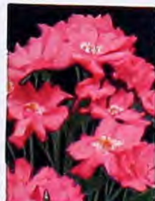
CHATILLON. Large heads of pink flowers. Dwarf plant. Best-grade, 2-yr. plants, 40 cts. each, $4 per doz.