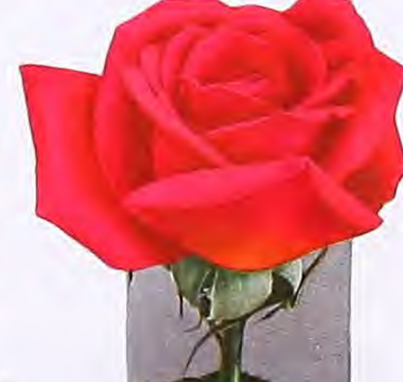
ELIZABETH OF YORK. Semi-double flowers of brilliant cerise-pink, borne singly on long stems. Very fragrant. Best-grade, 2-yr. plants, 50 cts. each, $5 per doz.