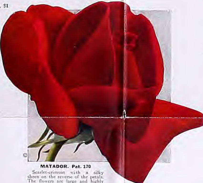
MATADOR. Pat. 170 Scarlet-crimson with a silken sheen on the reverse of the petals. The flowers are large and highly perfumed. Best-grade, 2-yr. plants, $1 each, $2.50 for 3, $10 per doz.