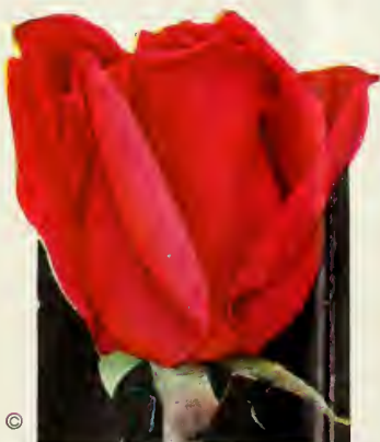
TEXAS CENTENNIAL. Pat. 152

Scarlet. Considered the best red from the world-famous Dicksons of Ireland. The illustration shows the form and petalage but does not tell of its defiance of the hottest summer sun without losing color. The fragrant blooms come singly on erect, strong stems and last long when cut. $1.25 each, $3.15 for 3, $12.60 per doz.