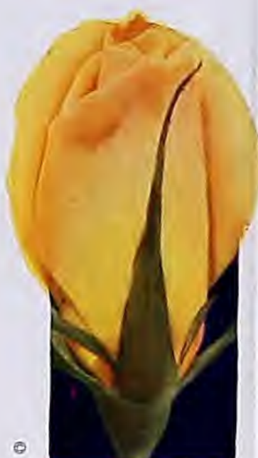
ECLIPSE. Pat. 172 Long-pointed bud opening into a reddish gold flower. The plant is a vigorous, upright grower, continuous bloomer. Best-grade, 2-yr. plants, $1 each, $2.50 for 3, $10 per doz.