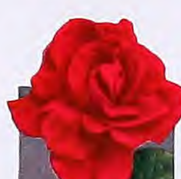
MARGY. A semi-double scarlet Polyantha. The brightest flower in the entire Polyantha class. Sturdy plants with good foliage. Best-grade, 2-yr. plants, 60 cts. each, $6 per doz.