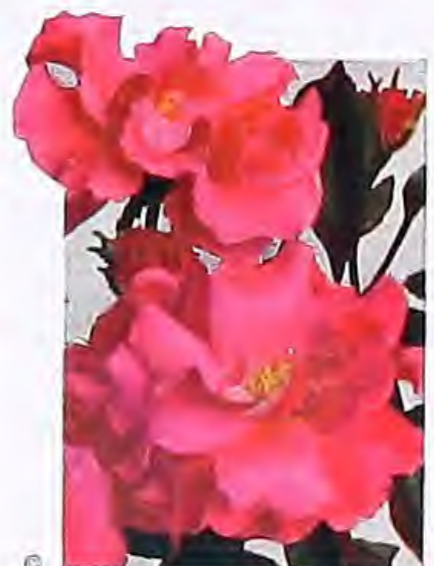
PERMANENT WAVE. Pat. 107 The single deep rose-pink blooms are 3 inches across and come in bouquets of six or more on a stem. Makes lovely, symmetrical, upright specimen plants. Best-grade, 2-yr. plants, 75 cts. each, $1.90 for 3, $7.60 per doz.