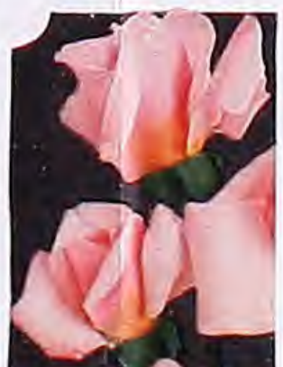
CECILE BRUNNER. Polyantha. The "Sweetheart Rose." Pink. Best-grade, 2-yr. plants, 40 cts. each, $4 per doz.