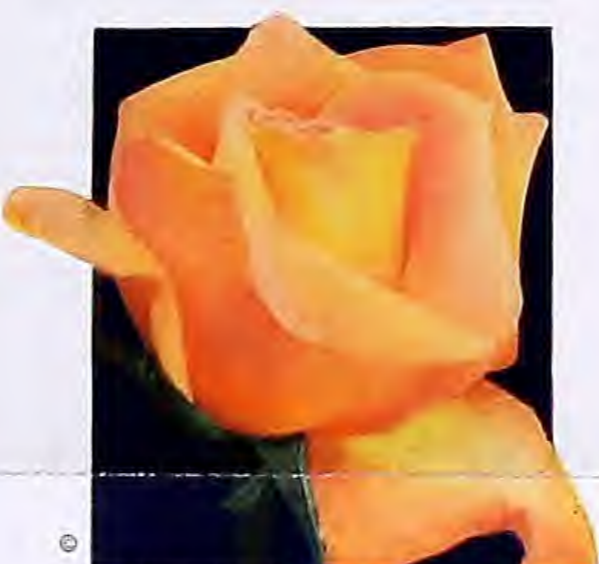
FEU PERNET-DUCHER. Pat. 103 A yellow Rose good from June to frost. The yellow blooms have a slight pink flush; late in the season the color is much darker. Tall, strong-growing plants. Best-grade, 2-yr. plants, $1 each, $2.50 for 3, $10 per doz.