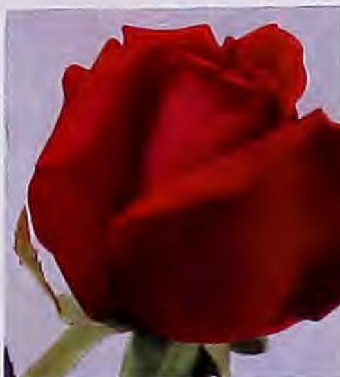
CRIMSON TALISMAN. A crimson sport of the popular Talisman Rose, with all of its parent's virtues, including a fine plant and lots of bloom. Fragrant. Best-grade, 2-yr. plants, 60 cts. each, $6 per doz.