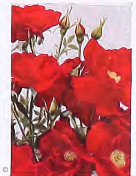
DONALD PRIOR. Pat. 317 Scarlet. Color is scarlet veiled with crimson. 85 cts. each, $2.15 for 3, $8.60 per doz.