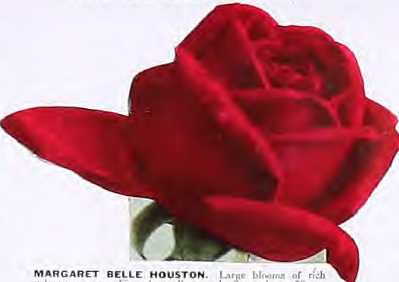
MARGARET BELLE HOUSTON. Large blooms of rich velvety crimson. Fine plant. Best-grade, 2-yr. plants, 50 cts. each, $5 per doz.