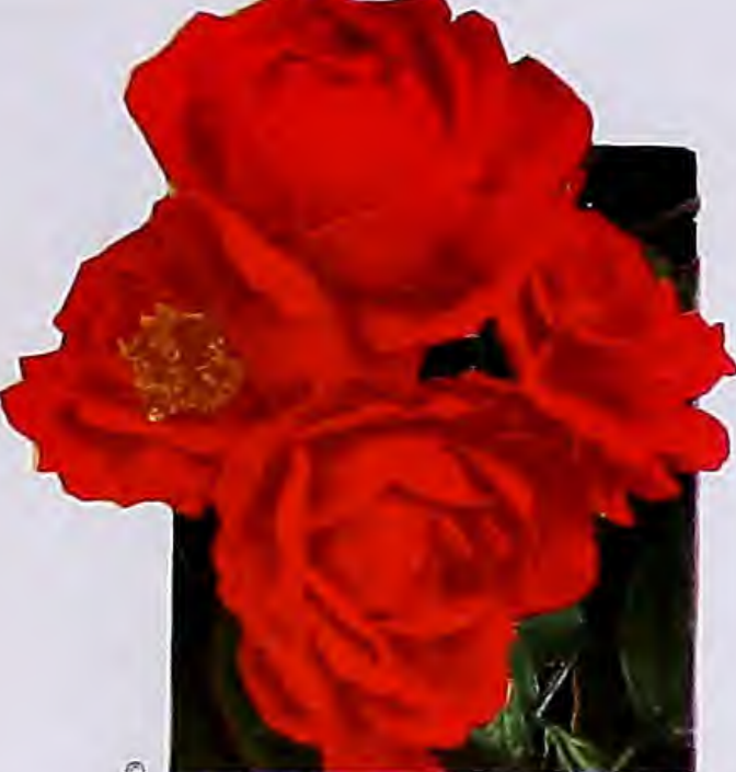
BLAZE. Pat. 10 The plants are entirely hardy and Blaze is undoubtedly the leading climbing Rose on the market today. Best-grade, 2-yr. plants, $1 each, $2.50 for 3, $10 per doz.

PRICES QUOTED ON THIS FOLDER ARE PREPAID