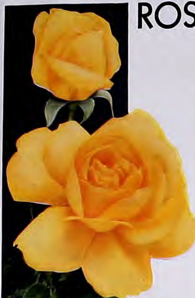
GOLDEN RAPTURE. Clear golden yellow flowers of fine form, lasting a long time. Old-Rose fragrance. Best-grade, 2-yr. plants, 60 cts. each, $6 per doz.

PRICES QUOTED ON THIS FOLDER ARE PREPAID