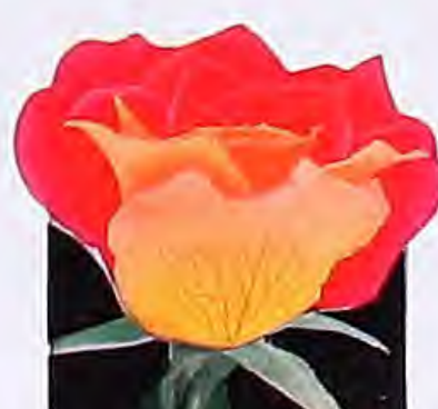
TALISMAN. Golden yellow and copper; leaves extremely fragrant, long-lasting and borne on long stems. Best-grade, 2-yr. plants, 35 cts. each, $3.50 per doz.