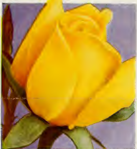
GOLDEN STATE. Pat. 303

Red and carmine; large, double, open blooms. Best-grade, 2-yr. plants, $1 each, $2.50 for 3, $10 per doz.