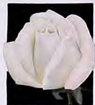
CALEDONIA. Flowers white, large, double, high-centered, slightly fragrant. Best-grade, 2-yr. plants, 40 cts. each, $4 per doz.