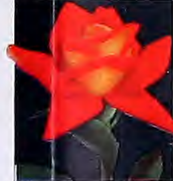
HEINRICH WENDLAND. Reddish copper with orange overcast. Best-grade, 2-yr. plants, 60 cts. each, $6 per doz.