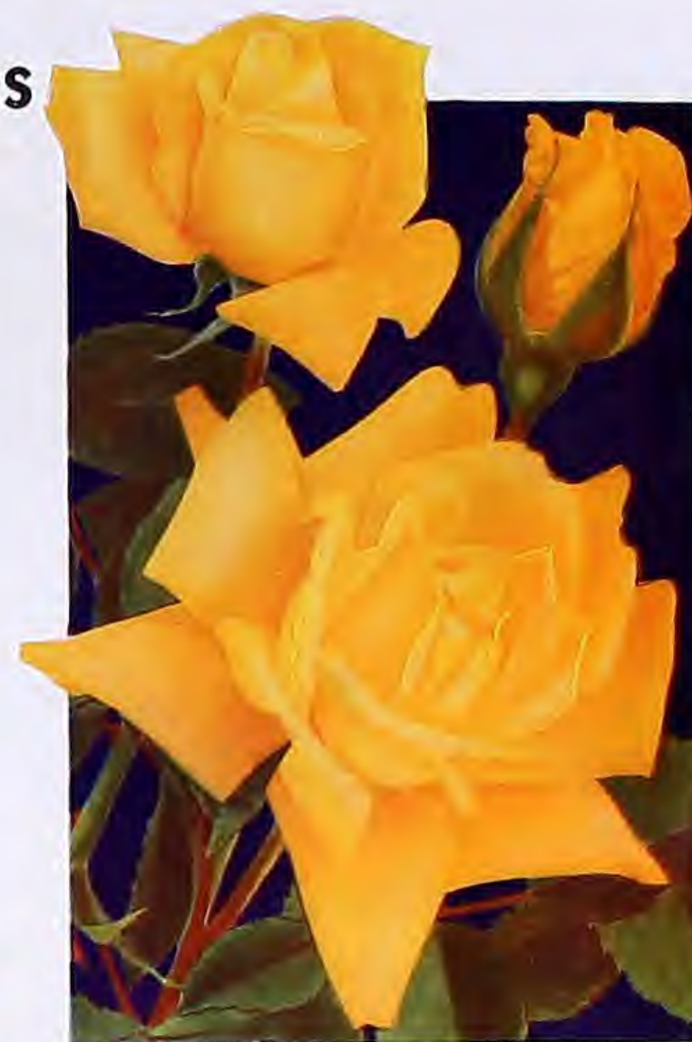
YELLOW TALISMAN. A yellow sport of the popular Talisman Rose, with its parents' good cutting quality and pleasing fragrance. A dependable yellow Rose. Best-grade, 2-yr. plants, 60 cts. each, $6 per doz.