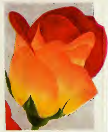
FLASH. Pat. 396

A new baby Rose with lovely sulphur-yellow buds, opening to double flowers. Best baby Rose we know. Best-grade, 2-yr. plants, $1.25 each, $3.15 for 3, $12.50 per doz.