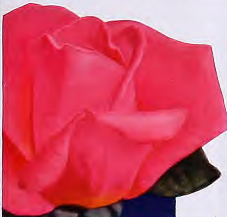
SOUV. DE MME. C. CHAMBARD. Coral-pink; fragrant. Free blooming. Best-grade, 2-yr. plants, 60 cts. each, $6 per doz.

WE HAVE NO AGENTS SEND YOUR ORDER DIRECT TO OUR TYLER HEADQUARTERS ROSEMONT NURSERIES TYLER · TEXAS