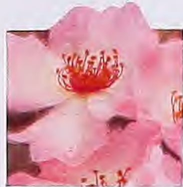
DAINTY BESS. Soft rose-pink. Excellent bloomer. Best-grade, 2-yr. plants, 40 cts. each, $4 per doz.