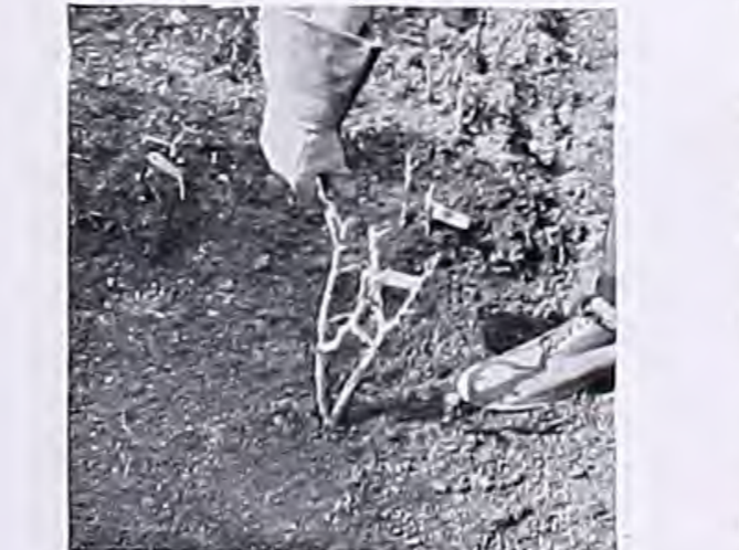
Holding roots in position