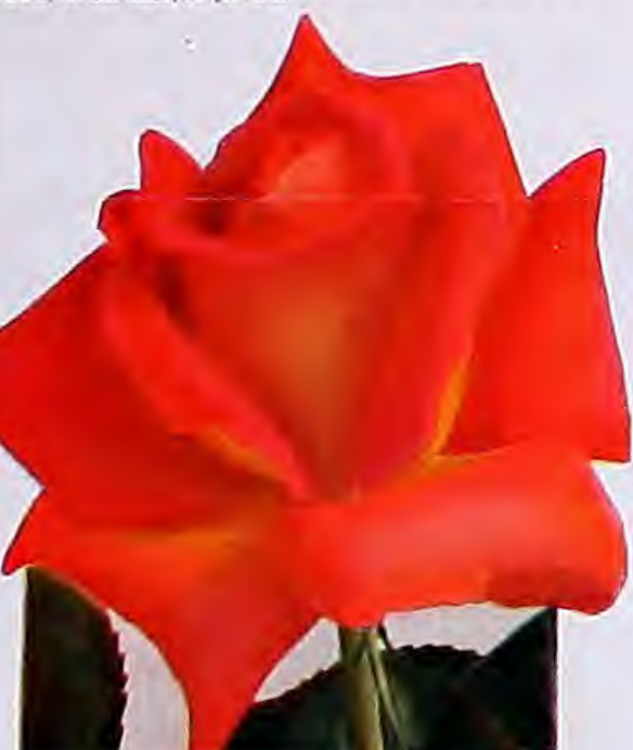
HINRICH GAEDE. A spectacular flower of luminous vermilion shaded golden yellow. Rich fragrance and sturdy plants. Best-grade, 2-yr. plants, 60 cts. each, $6 per doz.