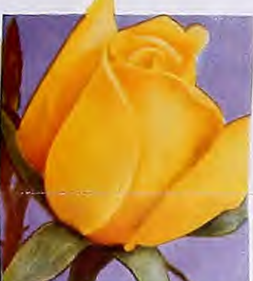
GOLDEN STATE. Pat. 303 Exceptionally beautiful buff-yellow flowers that have a glowing Mikado-orange heart, are borne on long stems and last a long time. Vigorous, profuse bloomer. Best-grade, 2-yr. plants, $1 each, $2.50 for 3, $10 per doz.