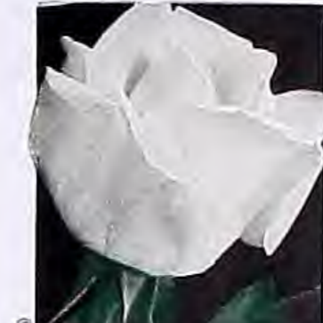
WHITE BRIARCLIFF. Pat. 108 Absolutely pure white. Vigorous, bushy plant. Best-grade, 2-yr. plants, $1 each, $2.50 for 3, $10 per doz.