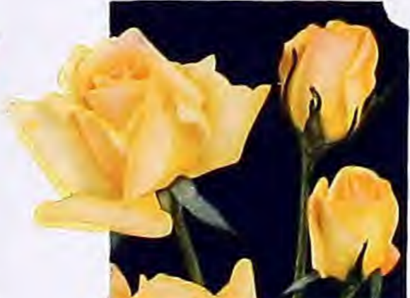
TOPAZ (Golden Sweetheart). Pat. 300 A new baby Rose with lovely sulphur-yellow buds, opening to double flowers. Best baby Rose we know. Best-grade, 2-yr. plants, $1.25 each, $3.15 for 3, $12.50 per doz.