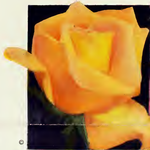
FEU PERNET-DUCHER. Pat. 103

Scarlet-crimson with a silky sheen on the reverse of the petals. The flowers are large and highly perfumed. Best-grade, 2-yr. plants, $1 each, $2.50 for 3, $10 per doz.