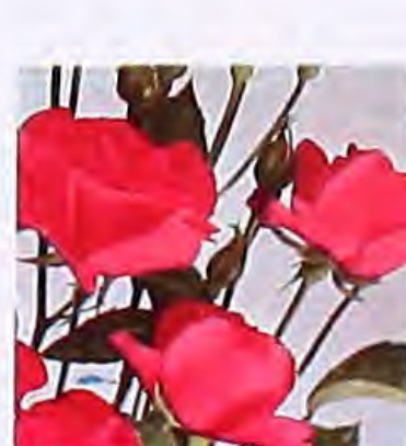
ELSE POULSEN. Semi-double, bright rose-pink blooms in clusters. Best-grade, 2-yr. plants, 40 cts. each, $4 per doz.