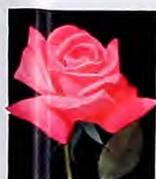
EDITOR McFARLAND. Large, fragrant, glowing pink flowers, suffused yellow. Best-grade, 2-yr. plants, 40 cts. each, $4 per doz.