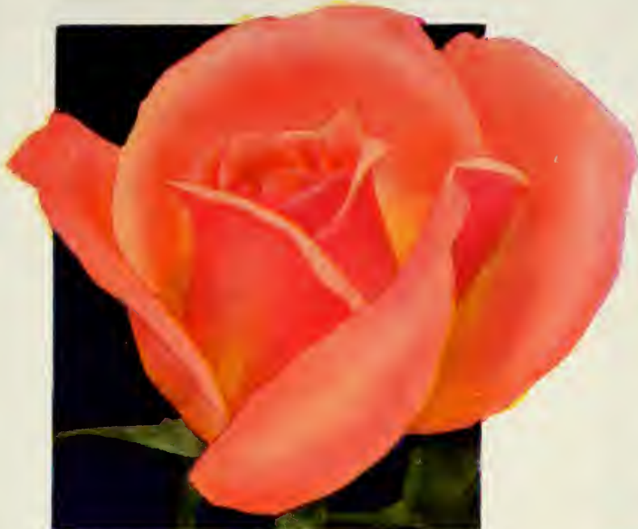
MME. COCHET-COCHET. Pat. 129

Long-pointed bud opening into a reddish gold flower. The plant is a vigorous, upright grower; continuous bloomer. Best-grade, 2-yr. plants, $1 each, $2.50 for 3, $10 per doz.