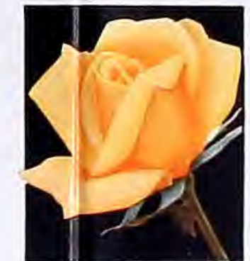
SEUR THERESE. A favorite yellow Rose in the South. Big plants with quantities of shapely golden yellow blooms. Thoroughly dependable. Best-grade, 2-yr. plants, 45 cts. each, $4.50 per doz.