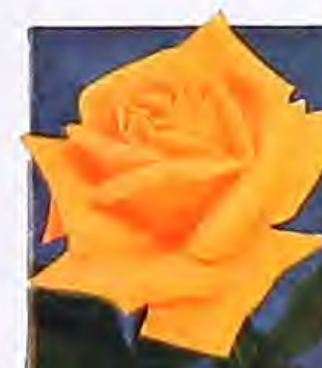
MRS. PIERRE S. DU PONT. Beautiful fragrant blossom of reddish golden yellow on a low spreading plant. Unusually free blooming. Best-grade, 2-yr. plants, 45 cts. each, $4.50 per doz.