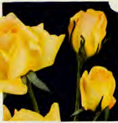
TOPAZ (Golden Sweetheart). Pat. 300

Bud orange-cora slightly fragrant, plants, $1.50 each,