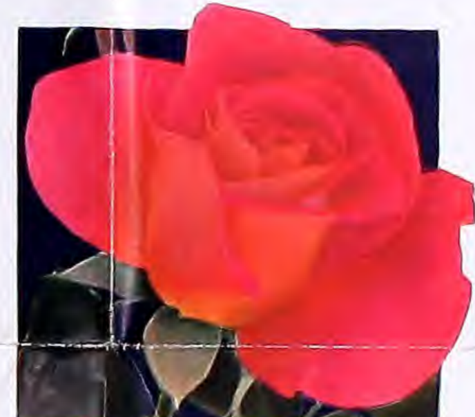
MME. HENRI GUILLOT. Pat. 337 Bud orange-coral, opening to very large, semi-double to double, slightly fragrant, orange-coral-red bloom. Best-grade, 2-yr. plants, $1.50 each, $3.75 for 3, $15 per doz.