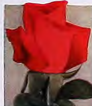
NATIONAL EMBLEM. Dark crimson, shading to vermilion edges. Best-grade, 2-yr. plants, 40 cts. each, $4 per doz.