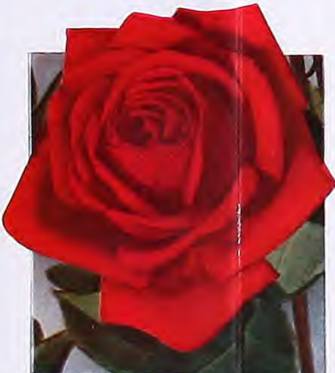
RADIANT BEAUTY. Pat. 97 Beautiful crimson flowers that do not turn blue. The plants are vigorous, upright in growth, free-blooming. Best-grade, 2-yr. plants, $1 each, $2.50 for 3, $10 per doz.