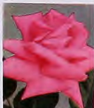
PINK PEARL. Fragrant pink flowers with salmon base, borne on long stems. Best-grade, 2-yr. plants, 50 cts. each, $5 per doz.