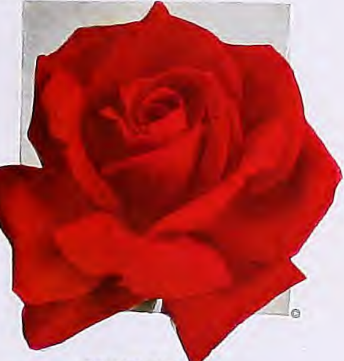
DICKSONS RED. Pat. 376 Scarlet. Considered the best red from the world-famous Dicksons of Ireland. The illustration shows the form and petalage but does not tell of its defiance of the hottest summer sun without losing color. The fragrant blooms come singly on erect, strong stems and last long when cut. $1.25 each, $3.15 for 3, $12.60 per doz.