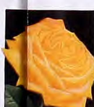
GOLDDAWN. Sunflower-yellow, fluted old-time. Best-grade, 2-yr. plants, 40 cts. each, $4 per doz.