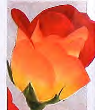
FLASH. Pat. 396 Excitingly brilliant but not gaudy. Early and profuse in bloom. $1 each, $2.50 for 3, $10 per doz.