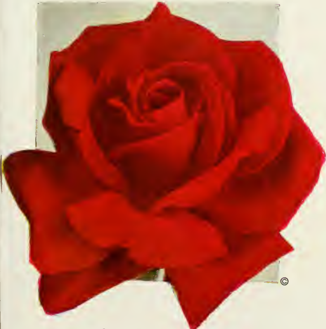
DICKSONS RED. Pat. 376

A yellow Rose good from June to frost. The yellow blooms have a slight pink flush; late in the season the color is much darker. Tall, strong-growing plants. Best-grade, 2-yr. plants, $1 each, $2.50 for 3, $10 per doz.