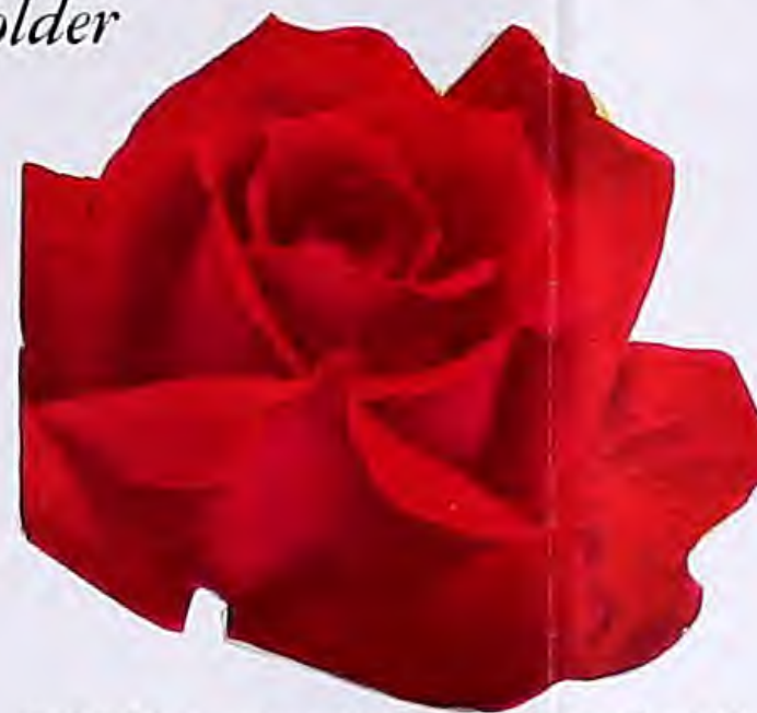
GRENOBLE. A great big scarlet bloom of fine form on a huge healthy bush. One of the finest red Roses. Best-grade, 2-yr. plants, 50 cts. each, $5 per doz.