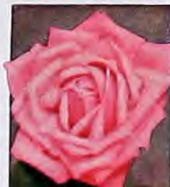
DAME EDITH HELEN. Pure glowing pink blooms carried on long stems and intensely fragrant. Best-grade, 2-yr. plants, 35 cts. each, $3.50 per doz.