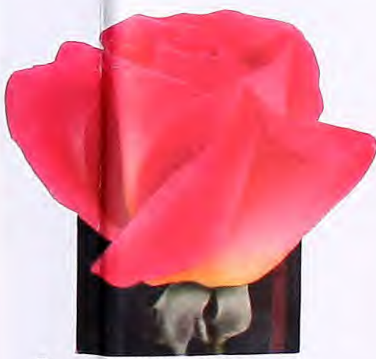
STERLING. Pat. 21 Bright pink flowers of splendid form come singly on vigorous-growing plants. Delightfully fragrant and fine for cutting. Sterling has proved so excellent that it now ranks as one of the best of the deep pink Hybrid Teas. Best-grade, 2-yr. plants, $1 each, $2.50 for 3, $10 per doz.