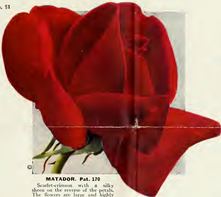
MATADOR. Pat. 170

Exceptionally beautiful buff-yellow flowers that have a glowing Mikado-orange heart, are borne on long stems and last a long time. Vigorous, profuse bloomer. Best-grade, 2-yr. plants, $1 each, $2.50 for 3, $10 per doz.