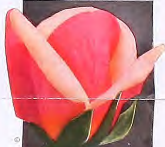
COUNTESS VANDAL. Pat. 38 The color is a blending of gold, copper, and salmon, difficult to describe or picture. Best-grade, 2-yr. plants, $1 each, $2.50 for 3, $10 per doz.