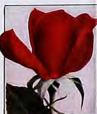
MARY HART. Pat. 8 Red and carmine; large, double, open blooms. Best-grade, 2-yr. plants, $1 each, $2.50 for 3, $10 per doz.