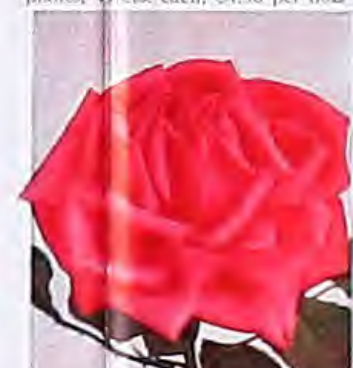
MARGUERITE CHAMBARD. Slightly fragrant geranium-red blooms. Best-grade, 2-yr. plants, 50 cts. each, $5.00 per doz.