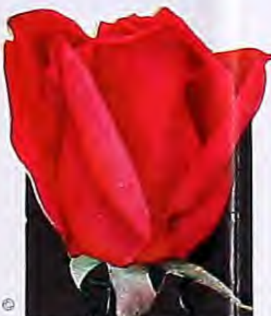
TEXAS CENTENNIAL. Pat. 162 Brick-red marked with gold; center light red toning to pink. Best-grade, 2-yr. plants, 60 cts. each, $1.50 for 3, $6 per doz.