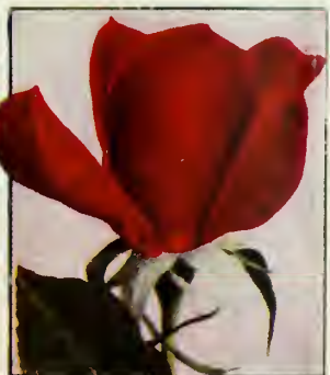
MARY HART. Pat. 8

Coppery pink; buds flushed orange. Best-grade, 2-yr. plants, $1 each, $2.50 for 3, $10 per doz.