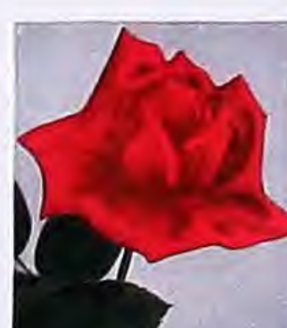
SYRACUSE. Splendidly formed scarlet blooms. The plants are upright, with healthy foliage. Best-grade, 2-yr. plants, 40 cts. each, $4 per doz.