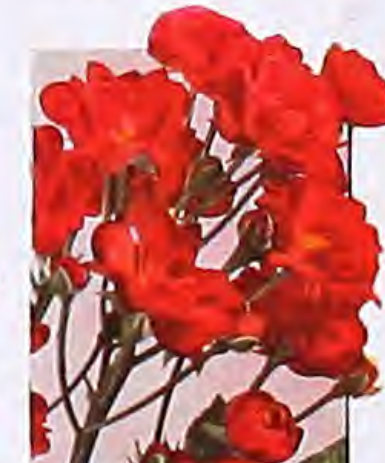
GLORIA MUNDI. Dainty orange-scarlet. Best-grade, 2-yr. plants, 40 cts. each, $4 per doz.