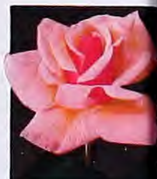
EDITH NELLIE PERKINS. Open red, shaded cerise-orange, inside salmon-pink. Best-grade, 2-yr. plants, 55 cts. each, $5.50 per doz.