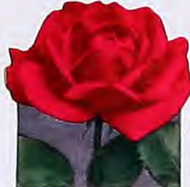
ROUGE MALLERIN. Brilliant red buds, opening to glowing scarlet. Best-grade, 2-yr. plants, 50 cts. each, $5 per doz.