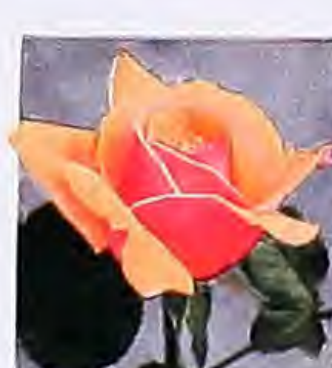
REV. F. PAGE-ROBERTS. Large, double flowers of golden yellow, stained red. Best-grade, 2-yr. plants, 50 cts. each, $5 per doz.