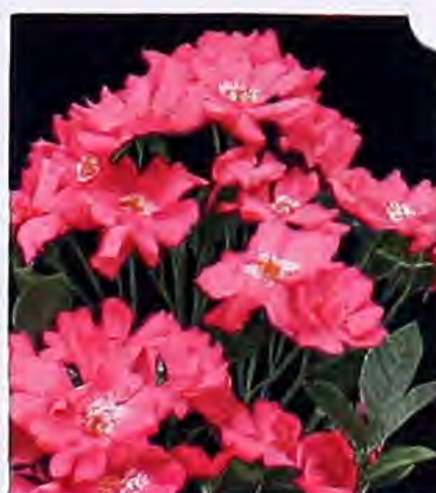
LAFAYETTE (Joseph Guy). Polyantha. Bright cherry-crimson flowers in immense clusters. Vigorous growth. Best-grade, 2-yr. plants, 40 cts. each, $4 per doz.

WE HAVE NO AGENTS SEND YOUR ORDER DIRECT TO OUR TYLER HEADQUARTERS ROSEMONT NURSERIES TYLER · TEXAS