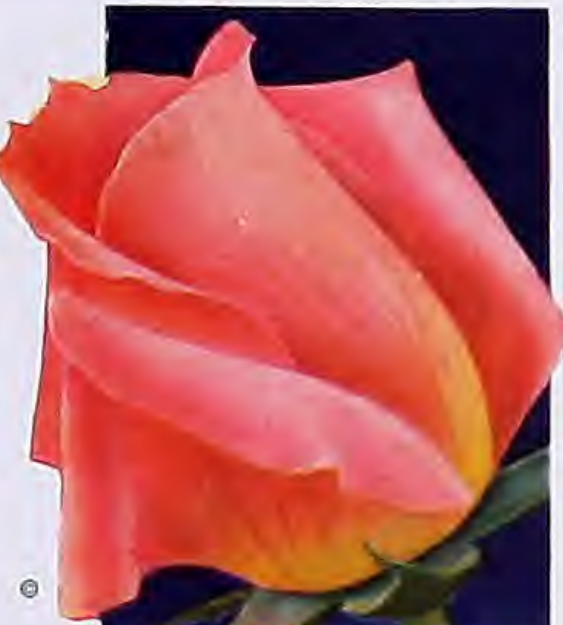
GLOAMING. Pat. 137 Since its introduction, about six years ago, this Rose has proved a "winner." The buds open into good-sized blooms which are of a pink tone overlaid with salmon. Vigorous, tall-growing plants. Best-grade, 2-yr. plants, $1 each, $2.50 for 3, $10 per doz.