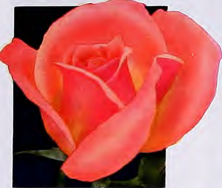
MME. COCHET-COCHET. Pat. 129 Coppery pink; buds flushed orange. Best-grade, 2-yr. plants, $1 each, $2.50 for 3, $10 per doz.