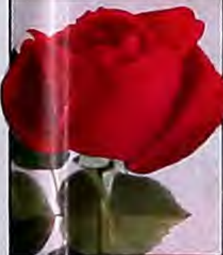
RED BRIARCLIFF. Rich red. Form of flower similar to Briarcliff. Best-grade, 2-yr. plants, 60 cts. each, $6 per doz.