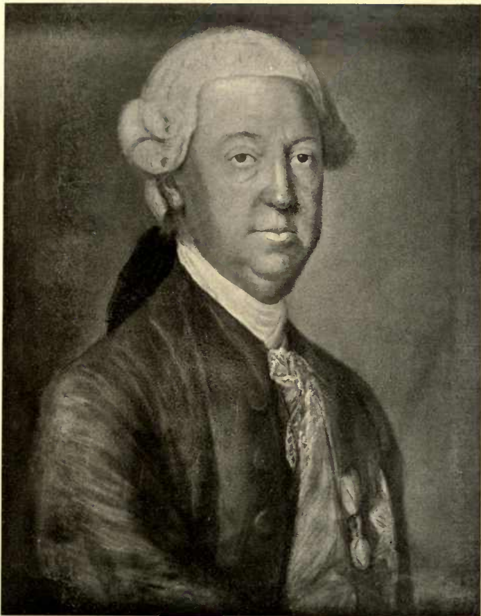
CHARLES EDWARD STUART