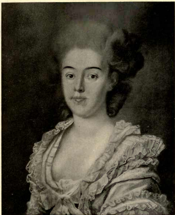
LOUISE, COUNTESS OF ALBANY