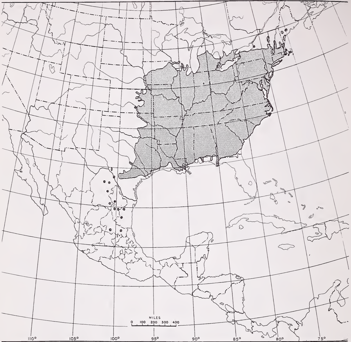
Figure 1. — Natural range of American sycamore.