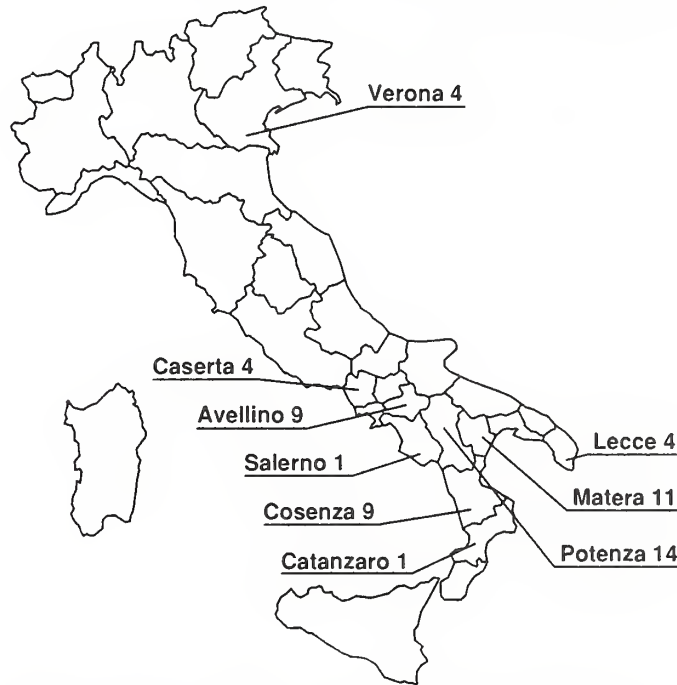
Figure 1 —Location of the 57 outbreaks of foot-and-mouth disease reported in Italy as of June 21, 1993.

After being free of FMD for nearly 4 years, Italy isolated FMD in the Potenza province, Basilicata region, in the southern part of the country on February 28, 1993. Although the source of the FMD is undetermined, its introduction is believed to be related to the importation of cattle from Croatia. As of June 21, 1993, there have been 57 outbreaks of FMD reported, most of which occurred in southern Italy (fig. 1). In addition, there have been four outbreaks in the Veneto region in northern Italy including Verona. However, these four outbreaks have been attributed to movements of animals from the primary focus of infection in southern Italy.