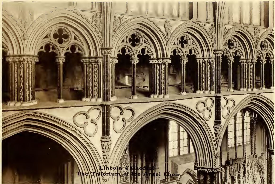
Lincoln Cathedral The Triforium of the Angel Choir