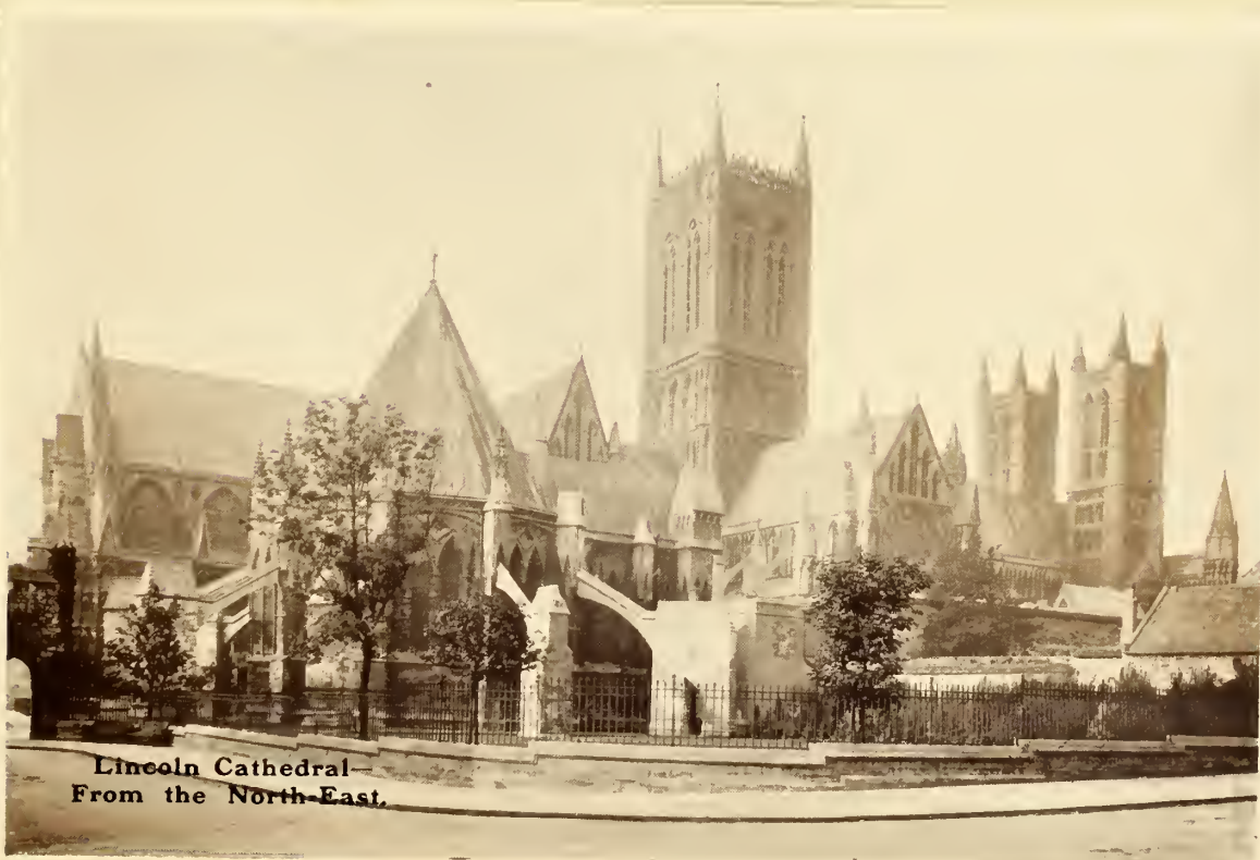
Lincoln Cathedral From the North-East.