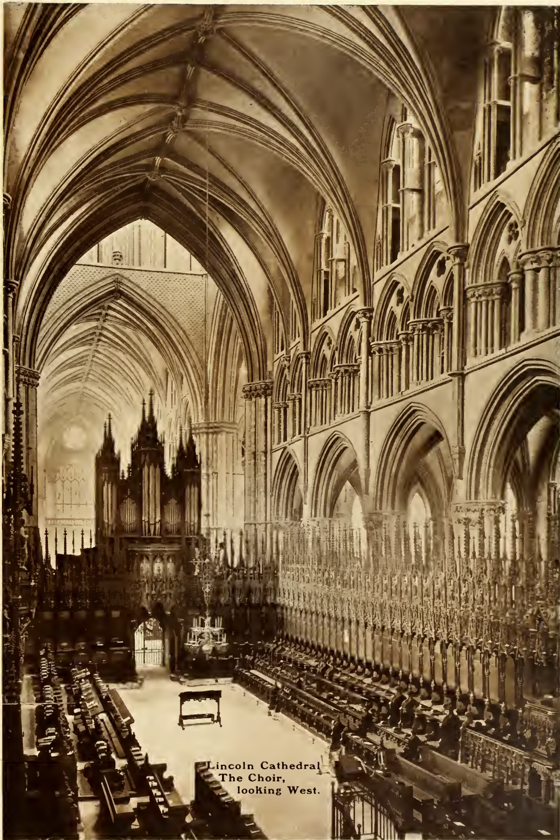
Lincoln Cathedral The Choir, looking West.