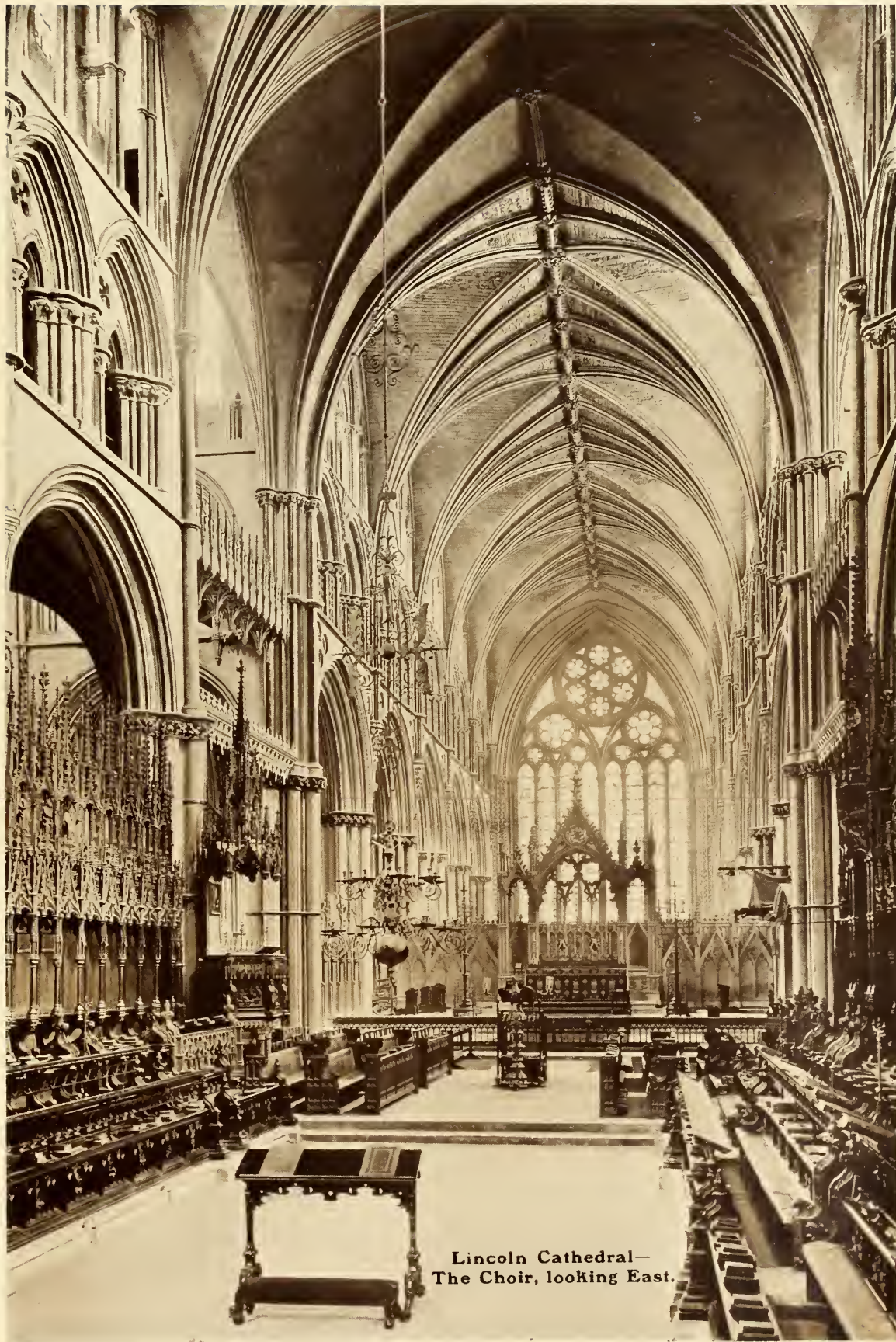
Lincoln Cathedral— The Choir, looking East.