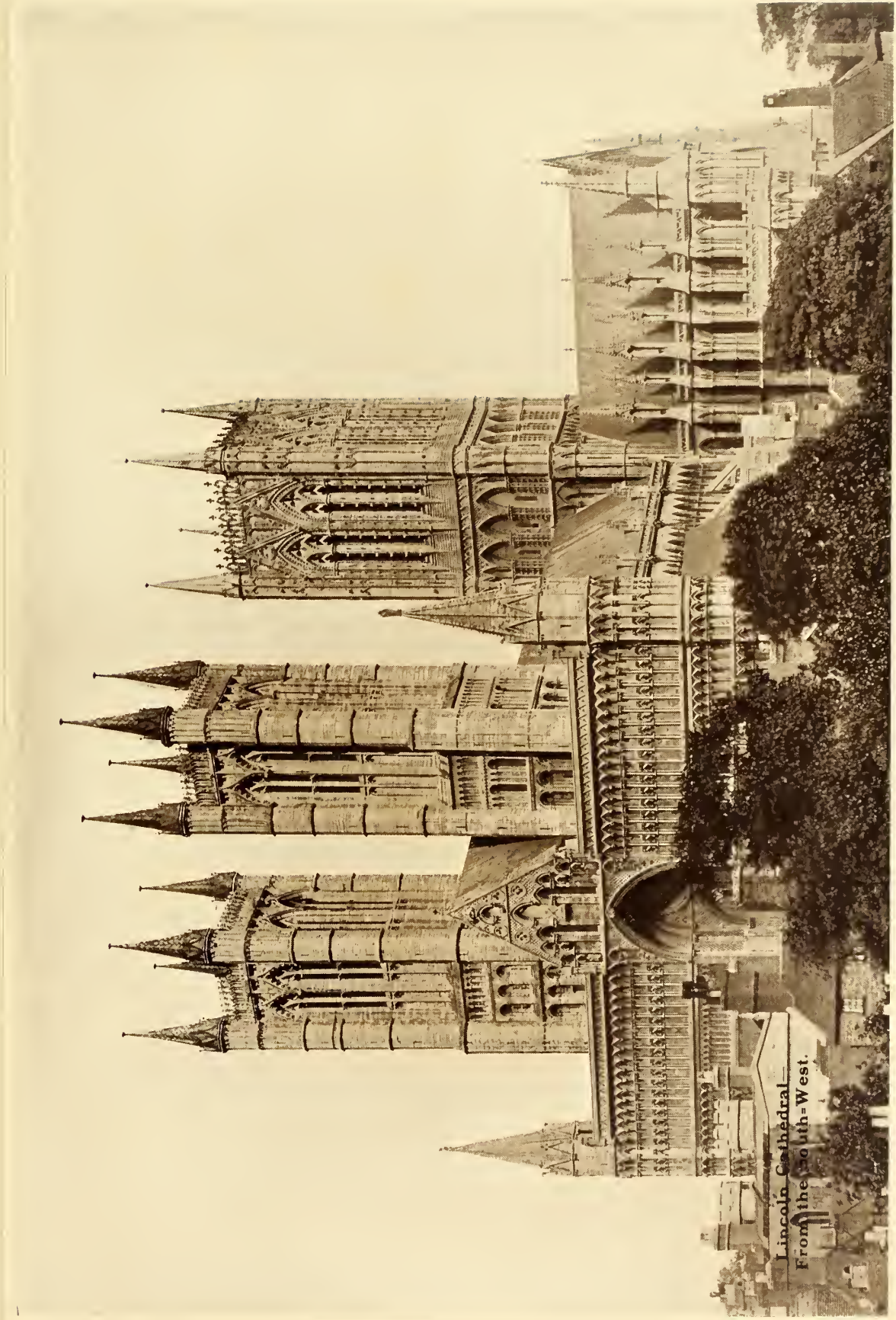
Lincoln Cathedral From the South-West.