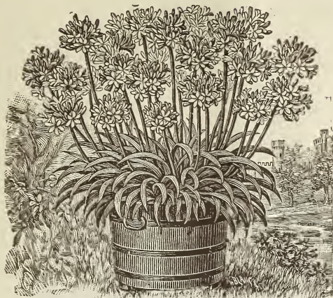
Agapanthus Umbellatus (Blue Lily of the Nile). A lovely, ornamental plant, grand for piazzas or lawns; grown in pots or tubs. Flower spikes 2 to 3 feet tall, bearing clusters of rare azure blue. Each' 50c.; 3, $1.40.