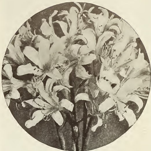
HARDY AMARYLLIS, HALLII

Spotted Calla. Alba maculata. Flowers white; foliage green, spotted white. Beautiful for pot culture. Each, 30c.; 3 for 85c.