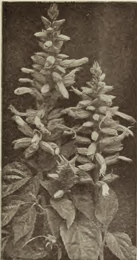
Salvia (Flowering Sage)

FARINACEA A. (Exquisite Blue Salvia). That rare tint among flowers of a beautiful clear morning sky. It flowers in July and August, keeping in bloom till frosts. Pkt., 15c; 1/8 oz., 50c.