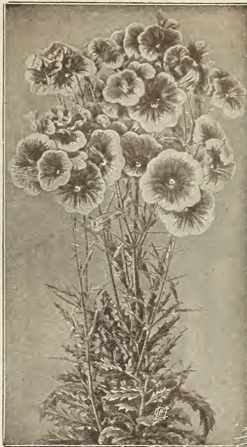
Salpiglossis variabilis superbissima

Single Annual Mixed. Blooms the first year. Pkt., 10c.