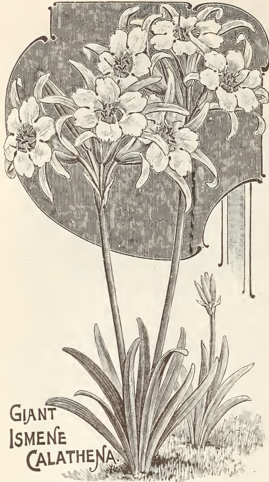
GIANT ISMENE CALATHENA