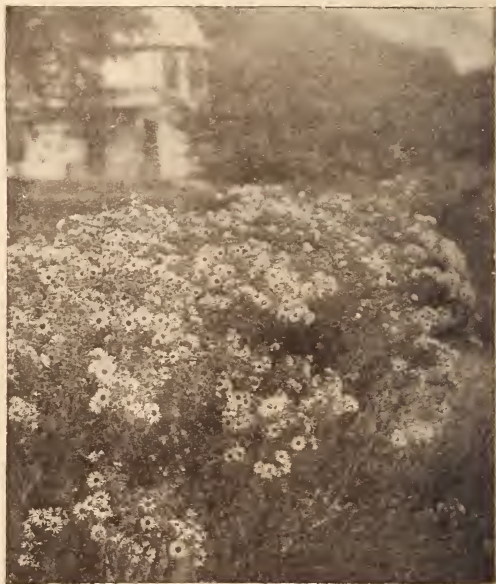
A Wild Flower Nook

Blend of California Wild Flowers for Shady Places. Pkt., 10c.; ¼ oz., 25c.