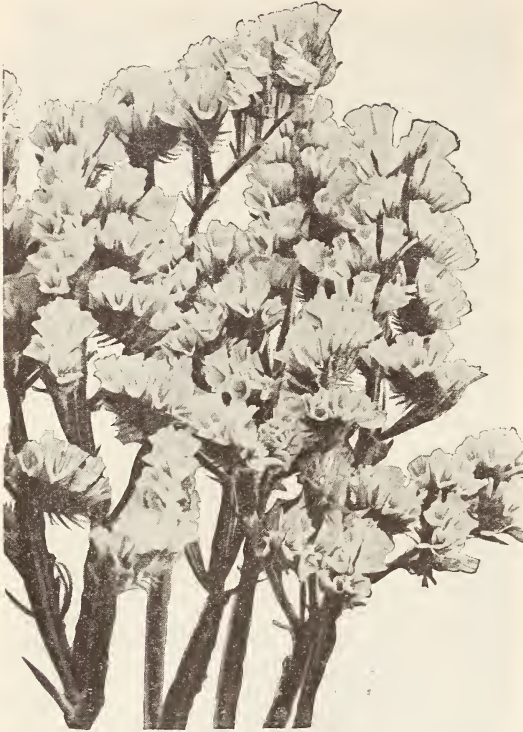
STATICE SINUATA "Rosea Superba"