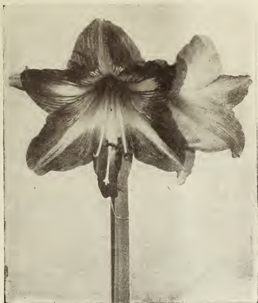
NEW ROYAL AMARYLLIS Amaryllis